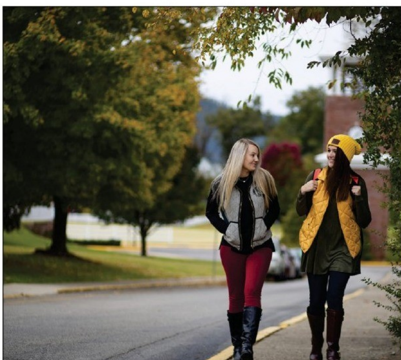
University of the Cumberlands is moving in-seat undergraduate students from a traditional semester schedule to the use of 8-week course terms.

According to Coleman, “One of the benefits of an