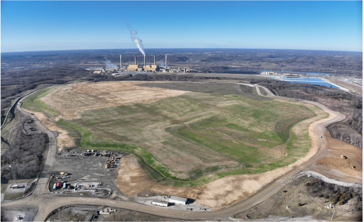
Phase III Ghent ATB #2 – December 2023