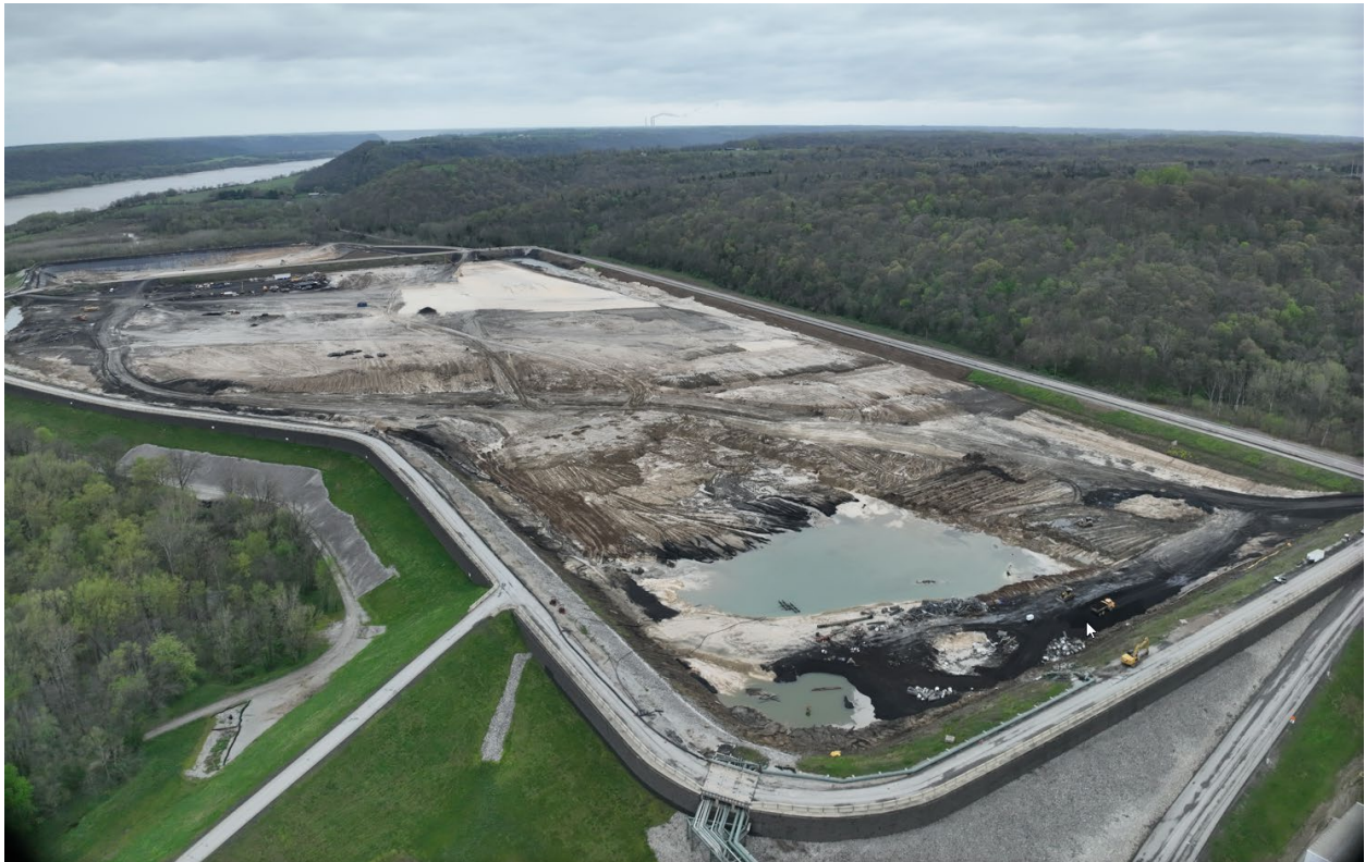
Trimble BAP – Looking Northeast – March 2024