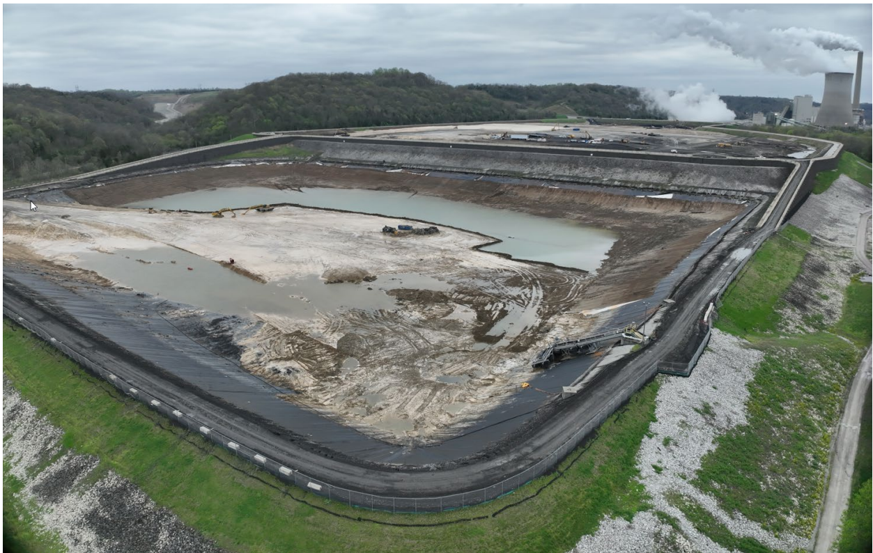
Trimble GSP – Looking South – March 2024