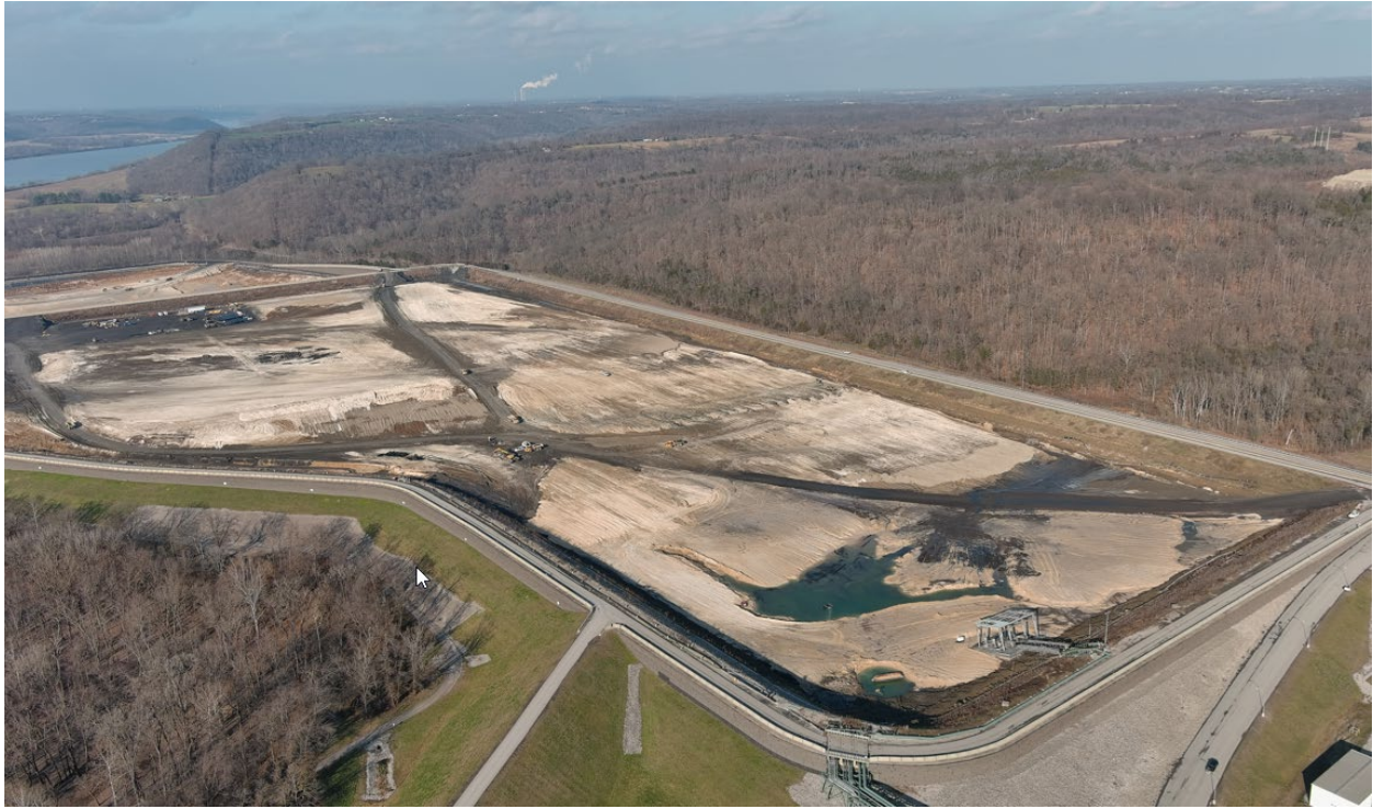
Trimble BAP – Looking Northeast – December 2023