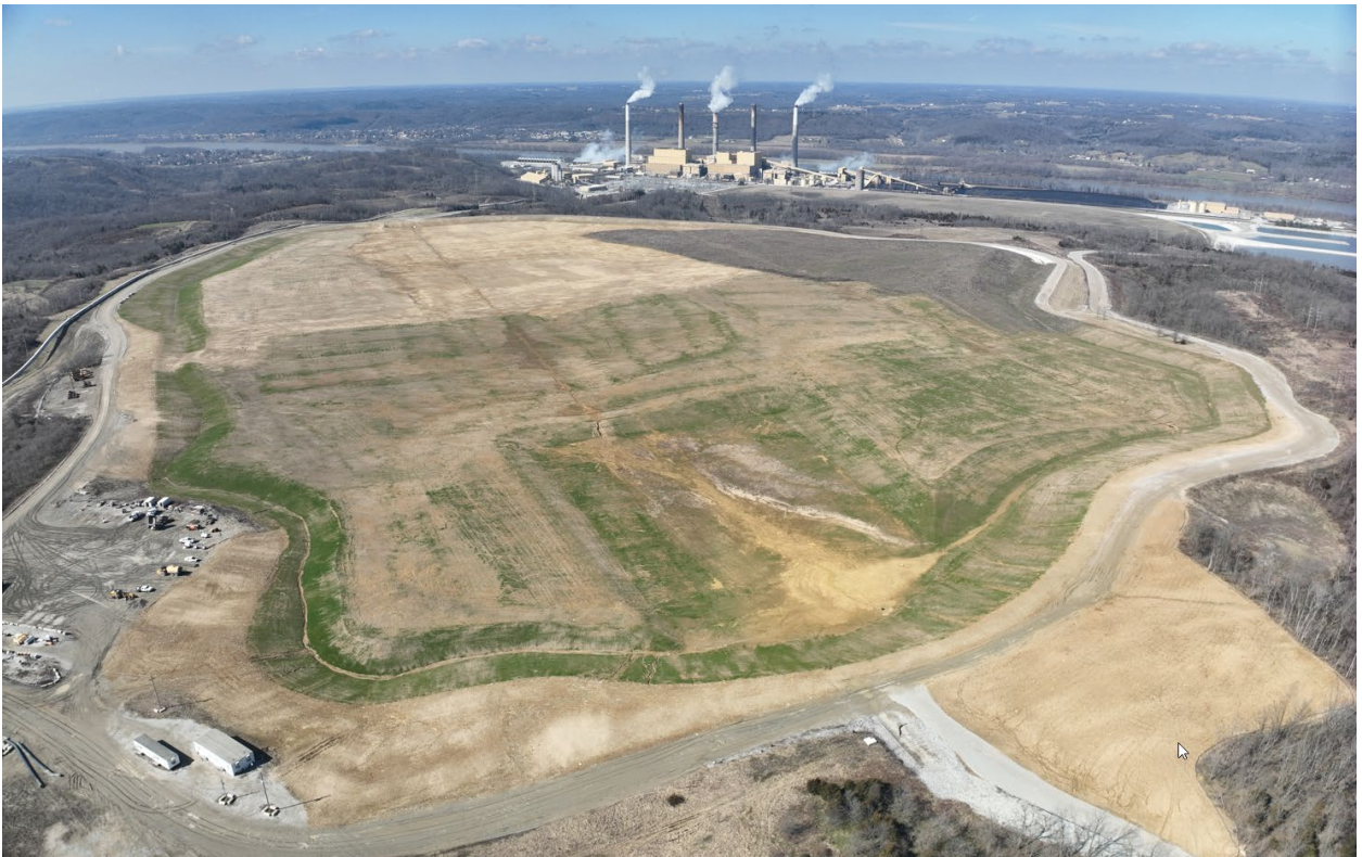
Phase III Ghent ATB #2 – March 2024