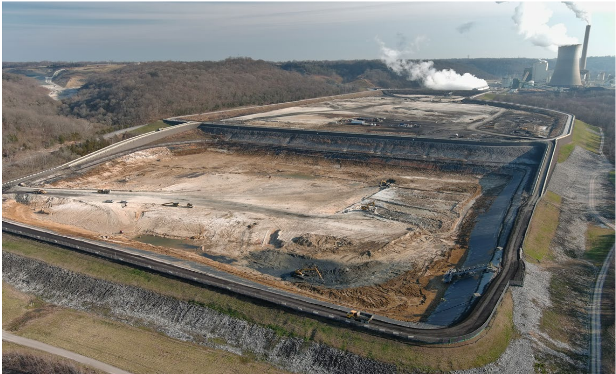
Trimble GSP – Looking South – December 2023