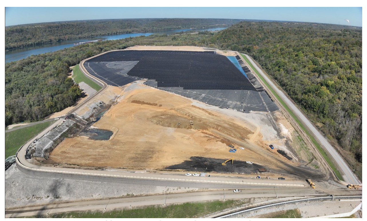
Trimble BAP – Looking Northeast – September 2024