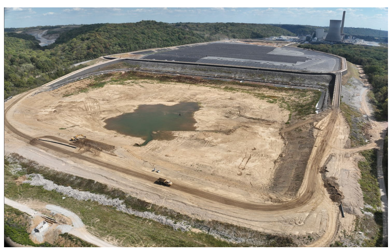
Trimble GSP – Looking South – September 2024