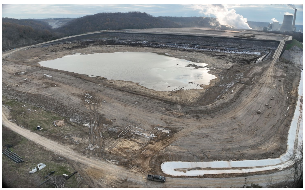
Trimble \; GSP-Looking \; South-December \; 2024