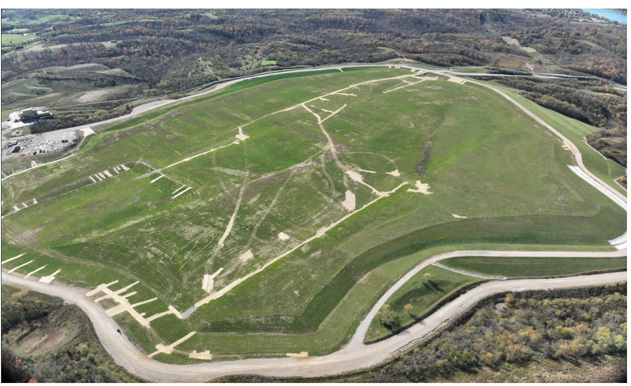
Phase III Ghent ATB #2 – December 2024