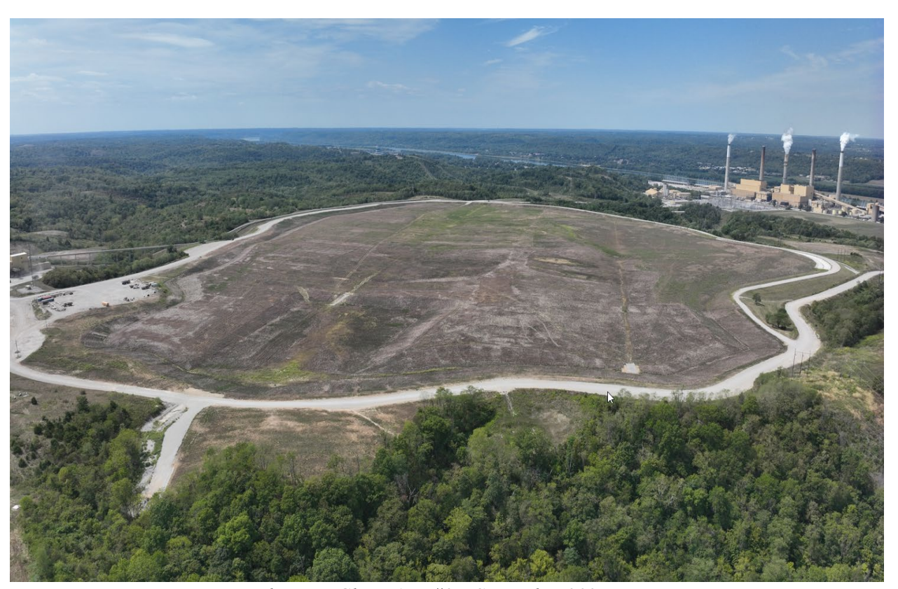
Phase III Ghent ATB #2 – September 2024