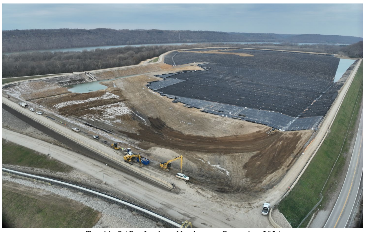
Trimble BAP – Looking Northeast – December 2024