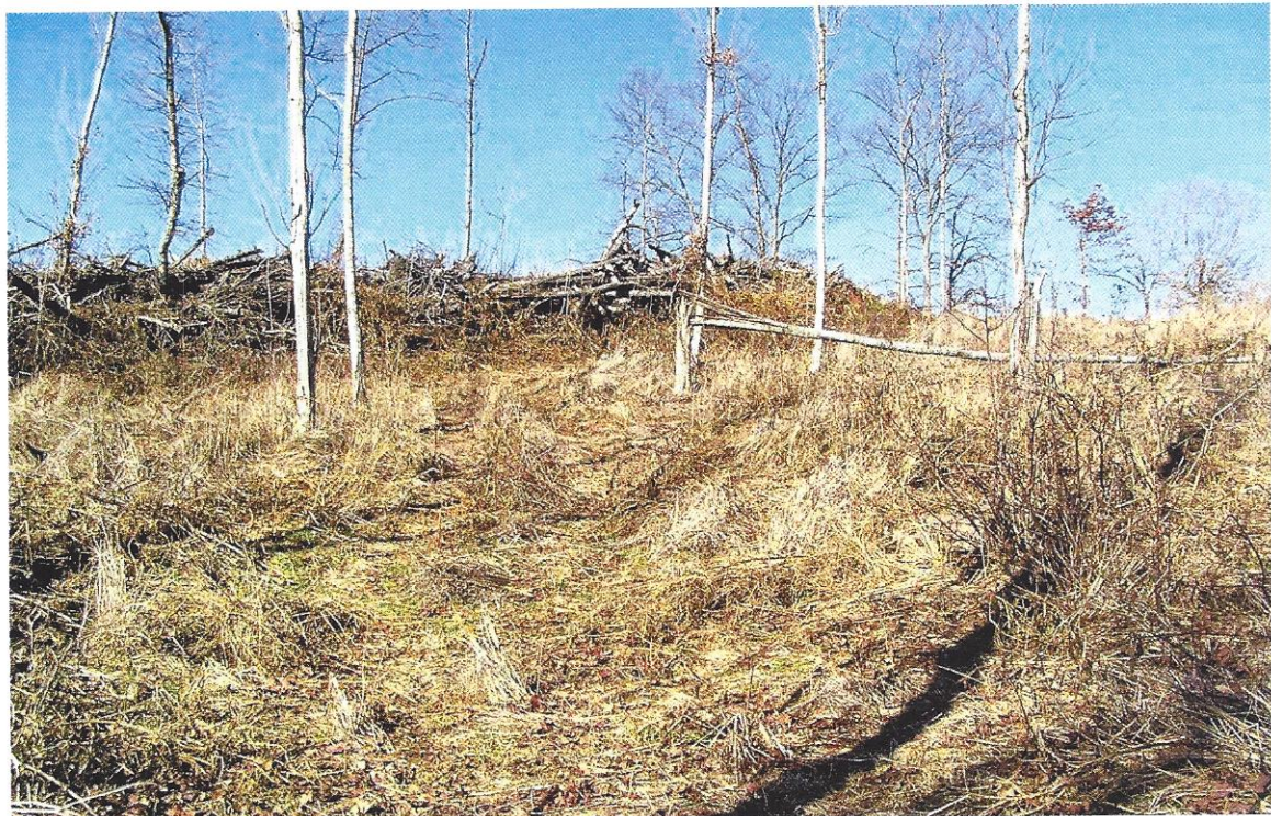
View of the Project Site from the southeast