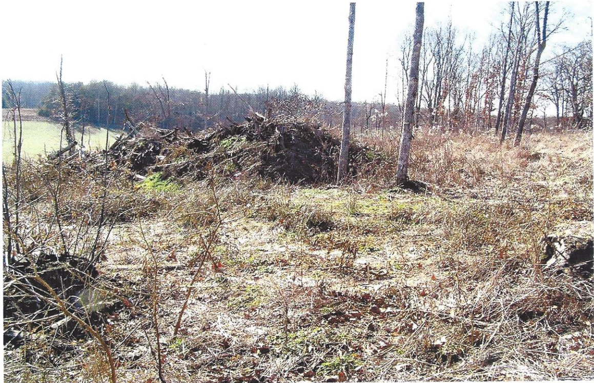
View of the Project Site from the north