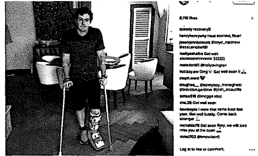
This image released Monday by world No. 1 golfer Rory McIlroy shows him posing on crutches and with his left leg in a medical support. McIlroy ruptured a ligament in his left ankle while playing soccer less than two weeks before the defense of his British Open title.

"It's not ideal for him because he's wearing that boot and he's going to have everyone in the media on his back now," Lowry said. "But should he be playing football? I don't know. He likes playing football, and he likes playing football with his mates. What's wrong with that? ... People think because you're good at something you should just do that and focus on that, but that's not what life is about."