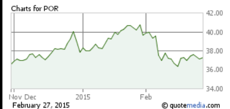
Chart for POR