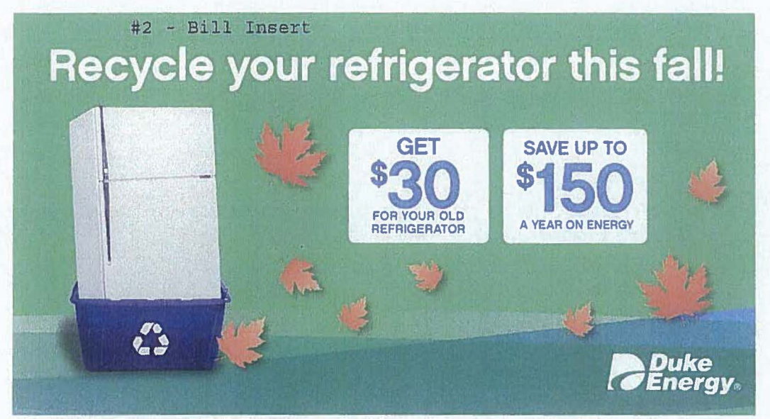
Figure 17. Seasonal Bill Insert