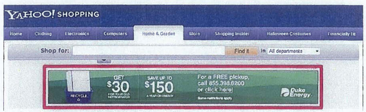
Figure 18. Yahoo Banner Ad

Get rid of the old Fridge - Get a $30 rebate & easy pickup