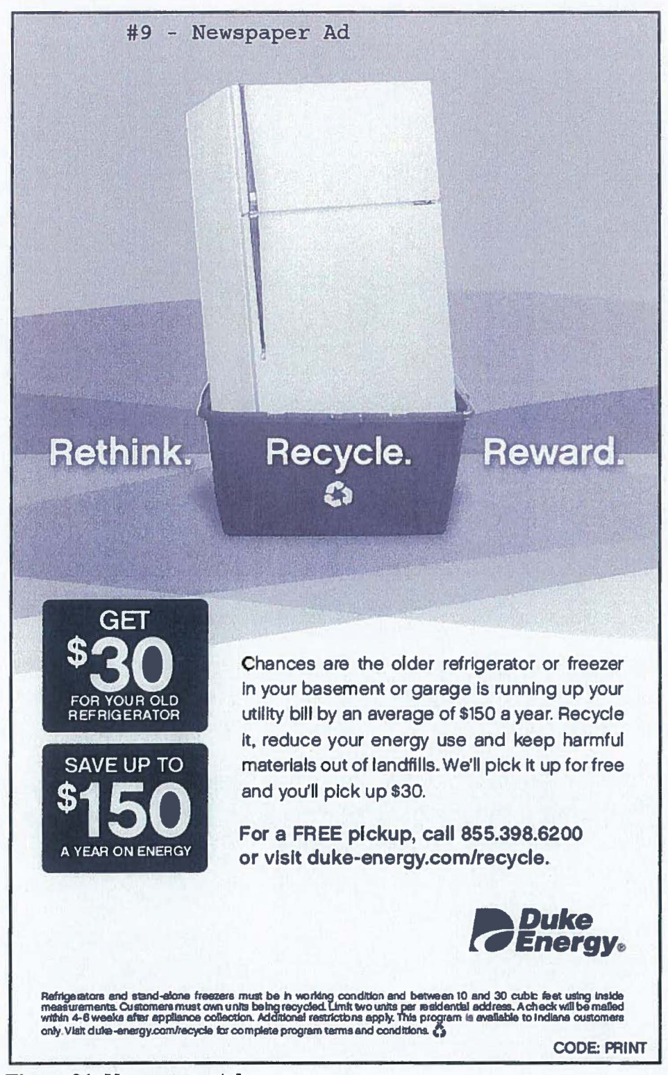
Figure 21. Newspaper Ad