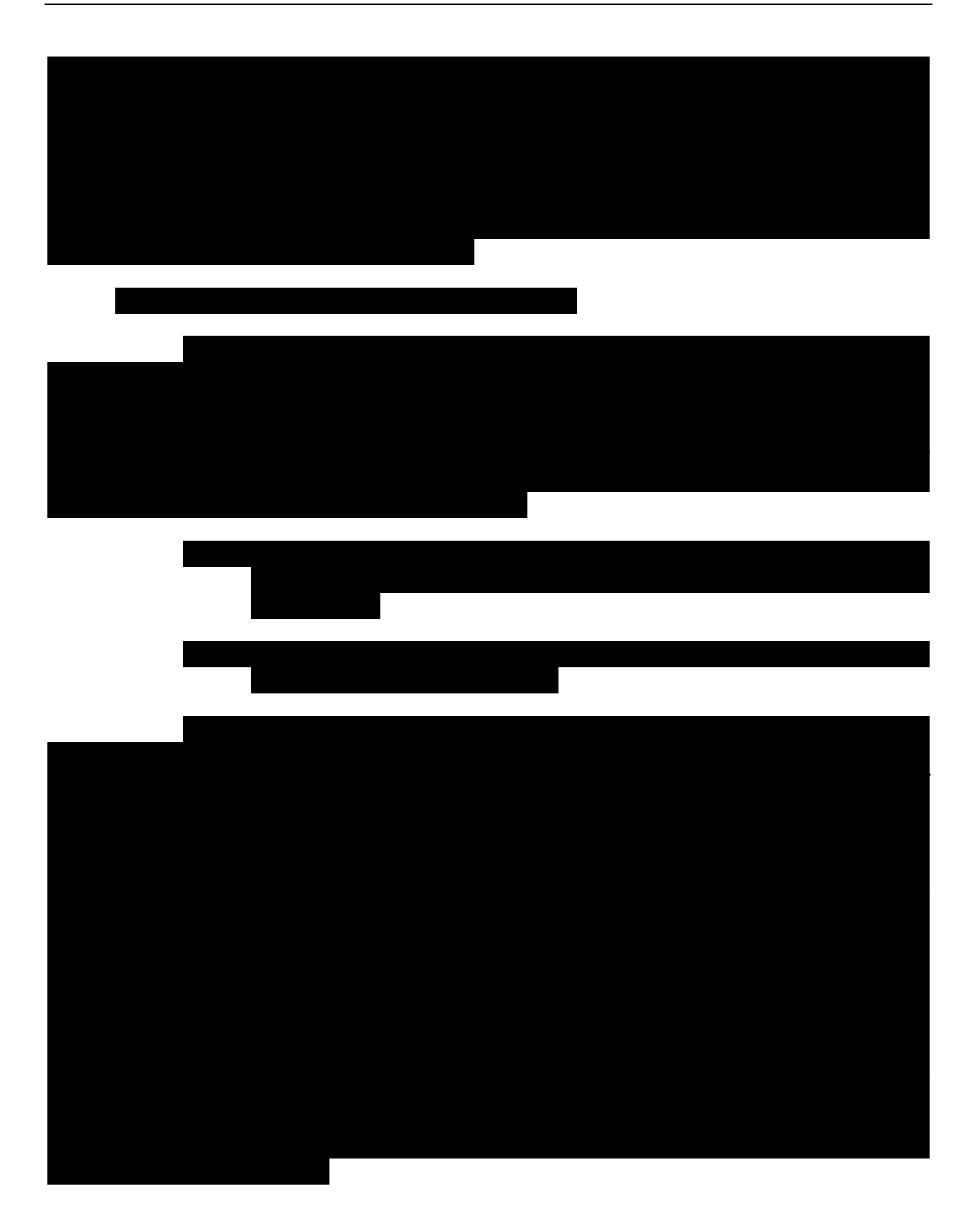
Page \mathbf{2} of \mathbf{3}