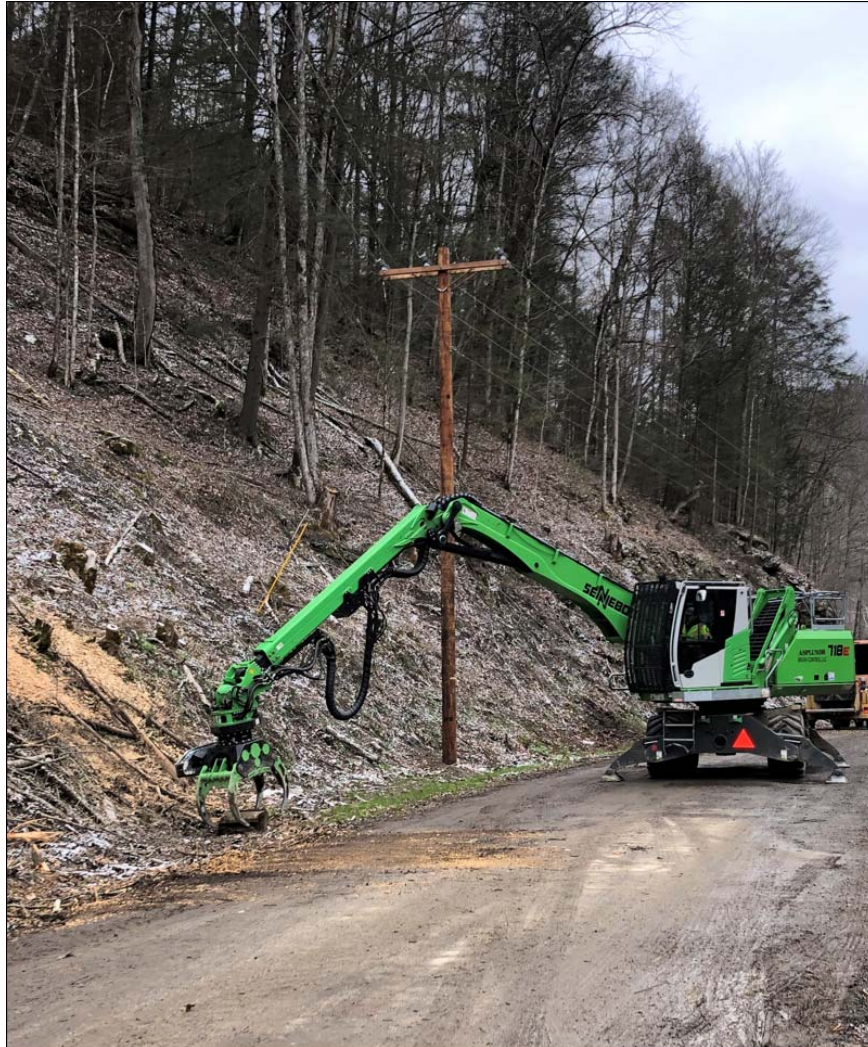
Equipment being utilized to mitigate debris from newly cleared right-of-way in the Hazard District Construction of new 3-phase tie line in Breathitt County – Photo taken on March 14, 2023