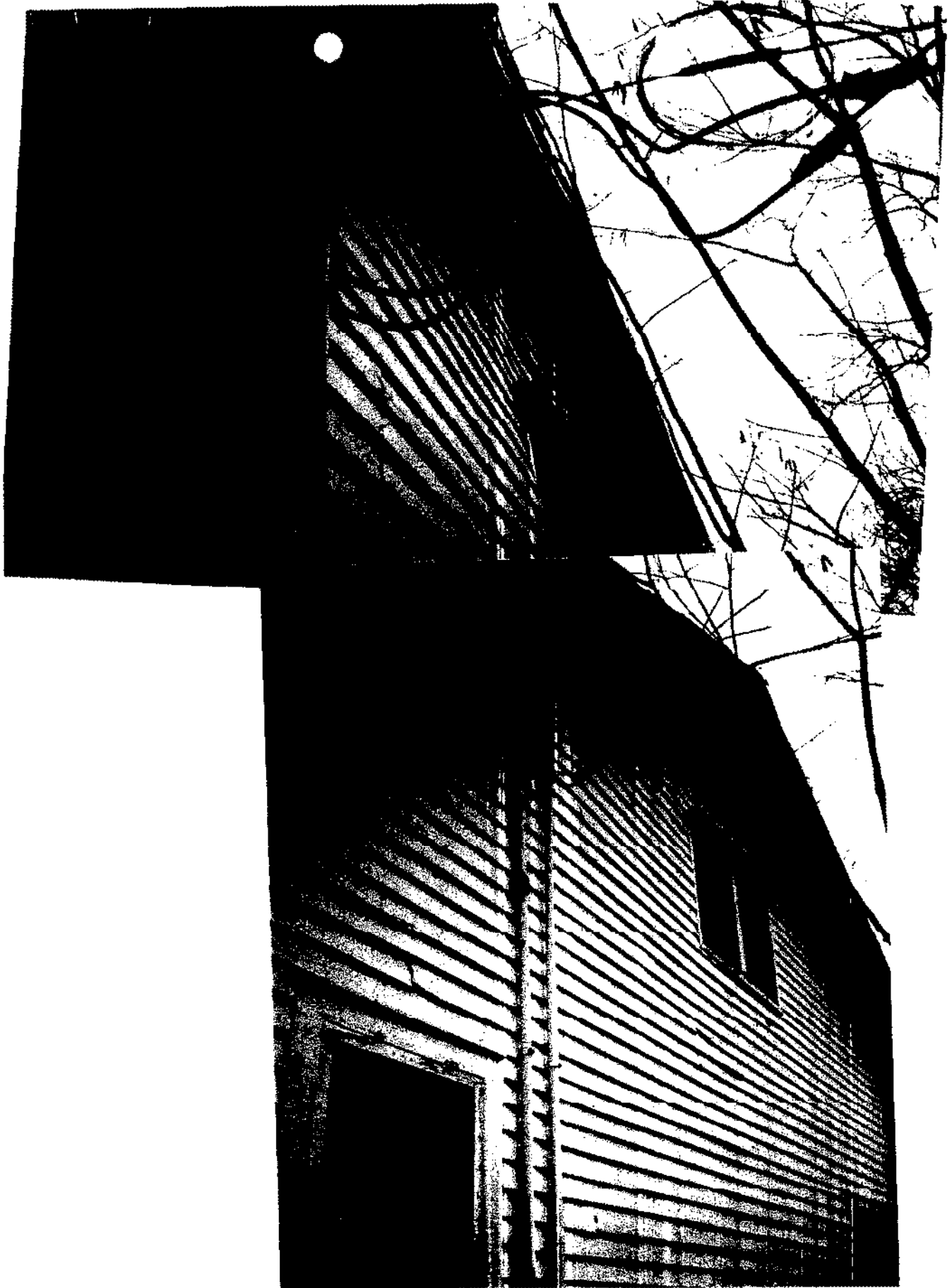
A high-contrast, black and white photograph of a building with horizontal siding, viewed from a low angle. Bare tree branches are visible in the upper right corner against a bright sky.