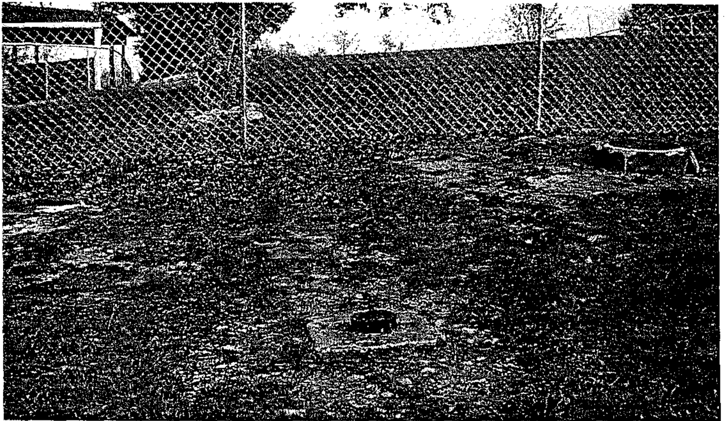
Montgomery Property on Lewis-Ward Road. The blowoff in front of the meters was installed in 1994 on the original property line.