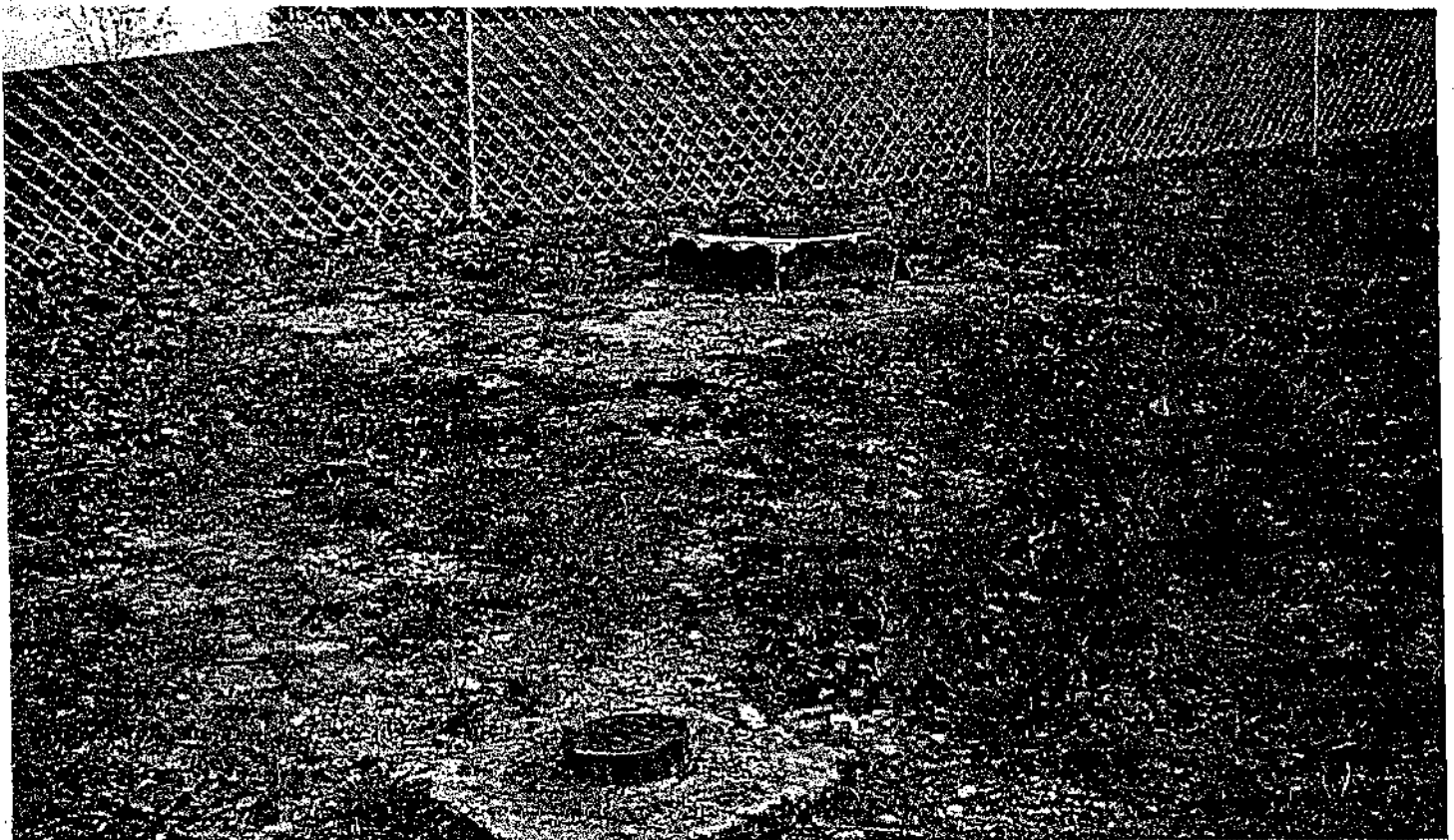
There have been numerous real estate transfers in this area and as a result, the property ownership and boundary lines are now different from what existed in 1996.