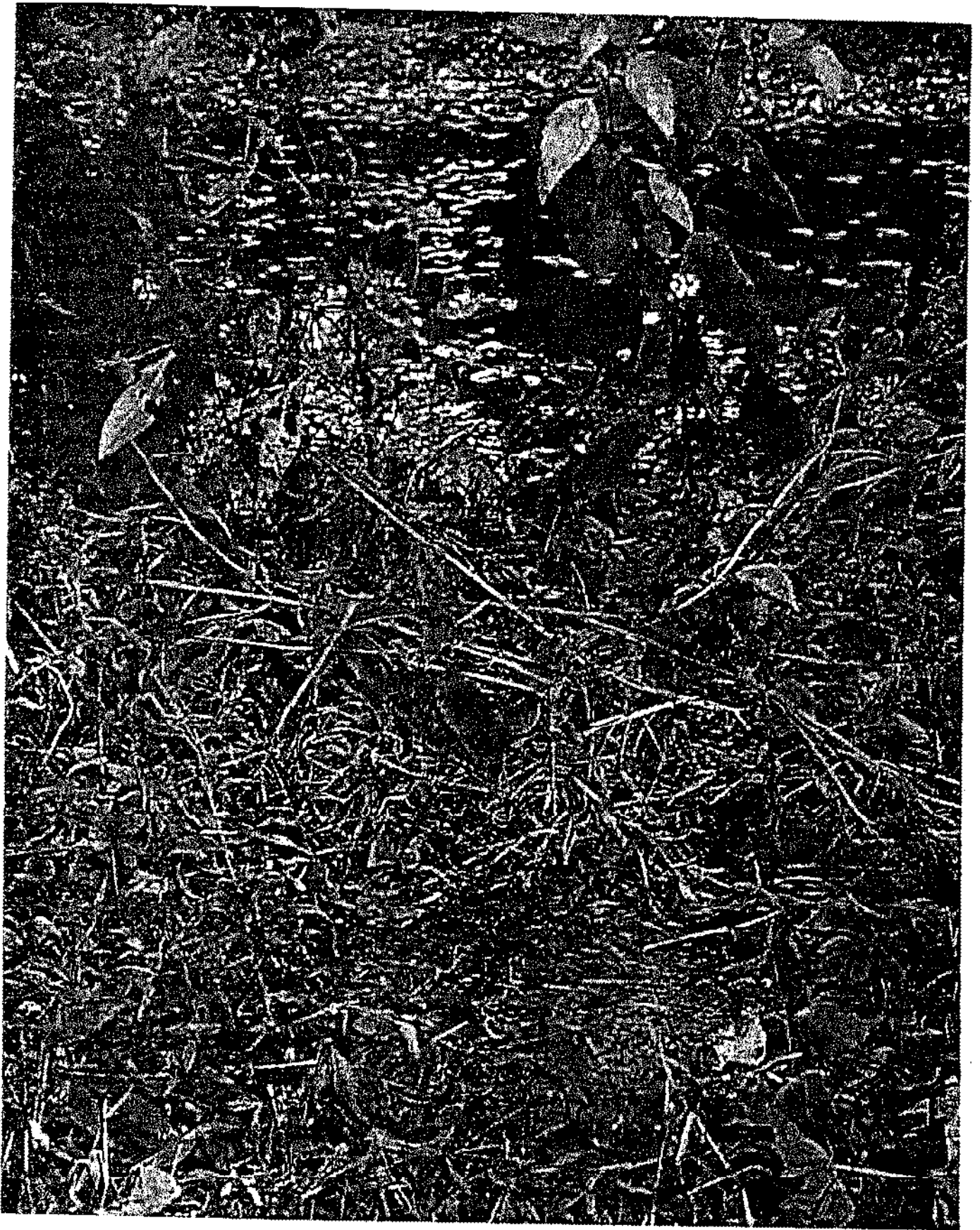
Kenneth Todd water meter on the opposite side of the East Fork of Black Creek from the Todd property.