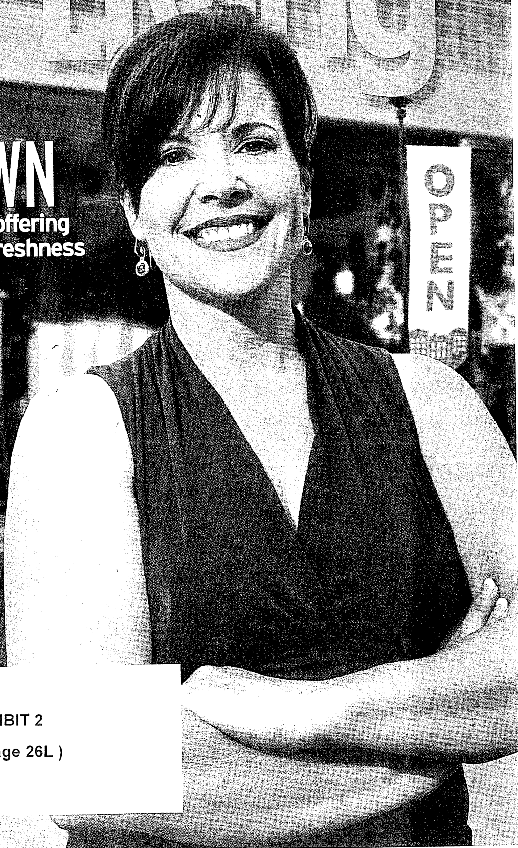
EXHIBIT 2 ( Ref. Page 26L )

PERFECT PICTURES Kentucky Living photographers spill their secrets