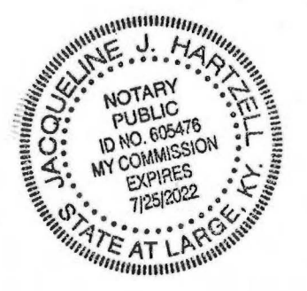
State at Large Commission Expires: July 25, 2022 ID#: 605476