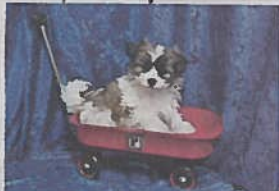
OCHERESE puppies. Have a memorable spring by giving yourself a little love. Photos at ochereuse.com 812-993-0281, 812-582-0682 A+ Member BBB.

gentle, 2yrs old, chocolate, house broke, microchipped, $100. 812-967-8910.