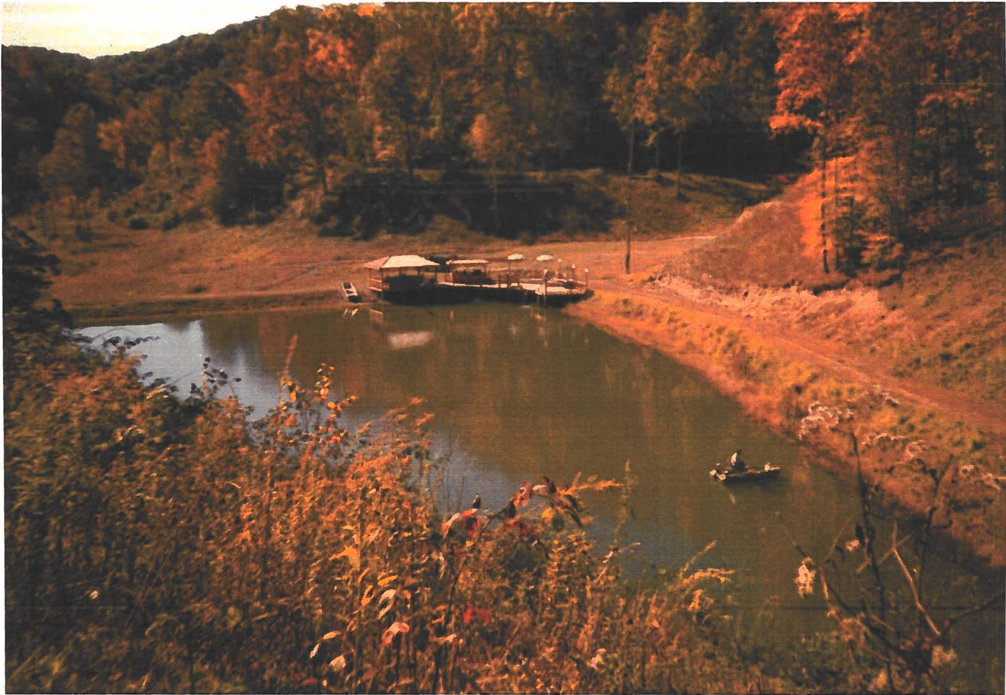
EXHIBIT (NO. 3) (CASE NO. 2021-00346) "UPPER POND" | 95 ACRES WATER SHED

"DIRECT PATH" OF "TRANS MISSION LINES" ↓