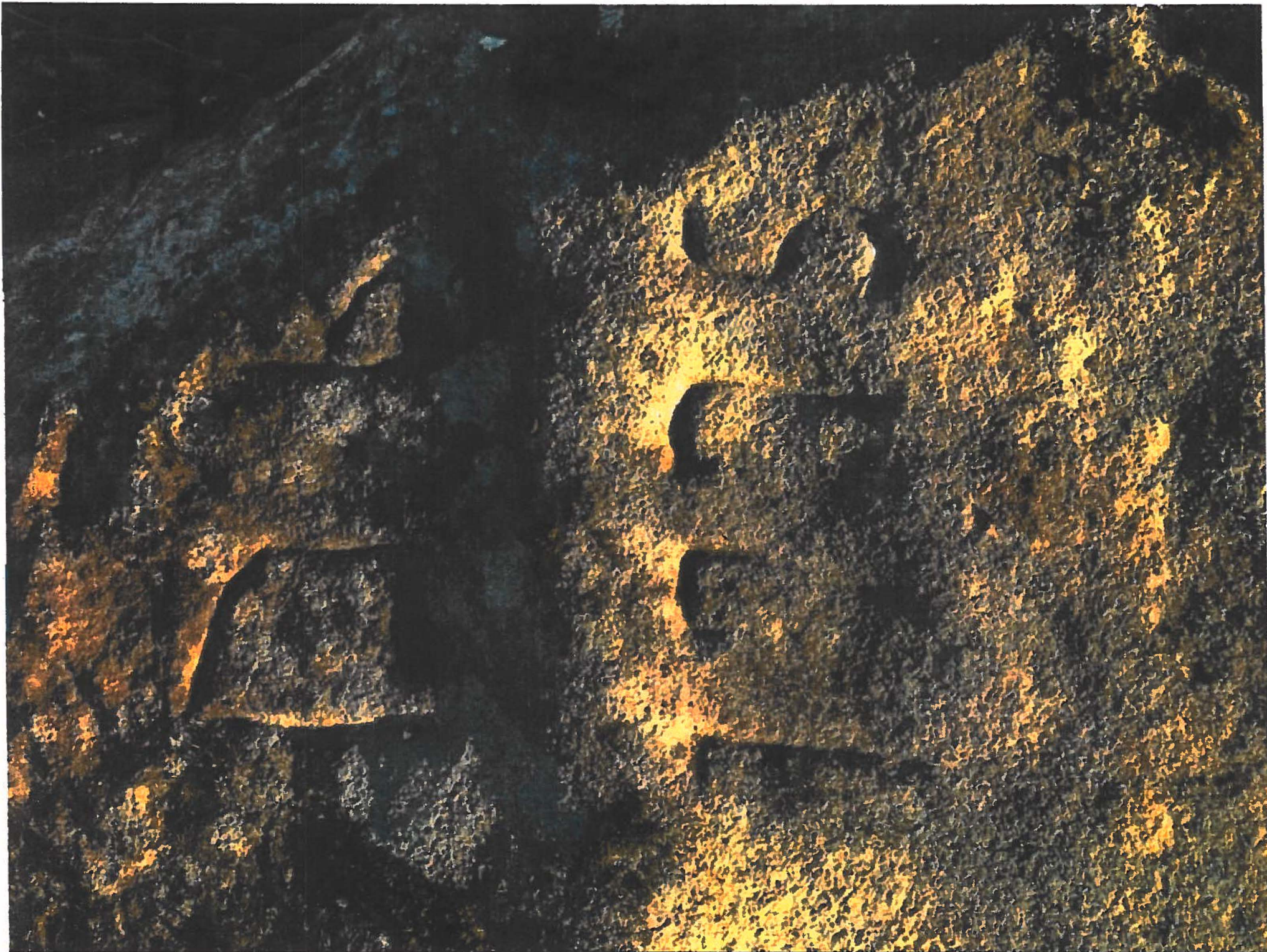
EXHIBIT (NO. 1) (CASE NO. 2021-00746)