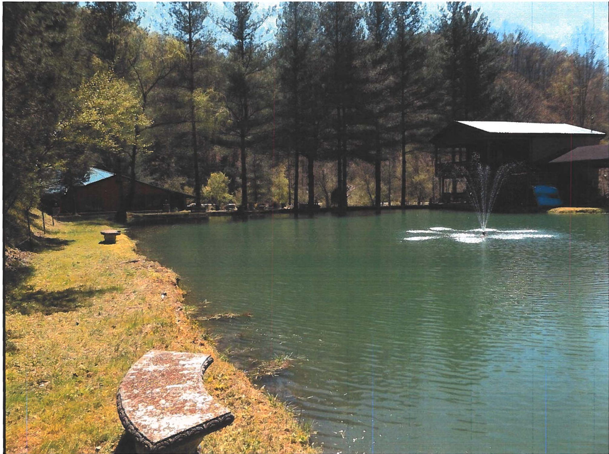
EXHIBIT NO. 2 (CASE NO. 2021-00346) LAWER DOWN WITH HOMIES

"45" ACRE WATER SHED / IN DIRECT PATH OF TRANSMISSION LINES 8