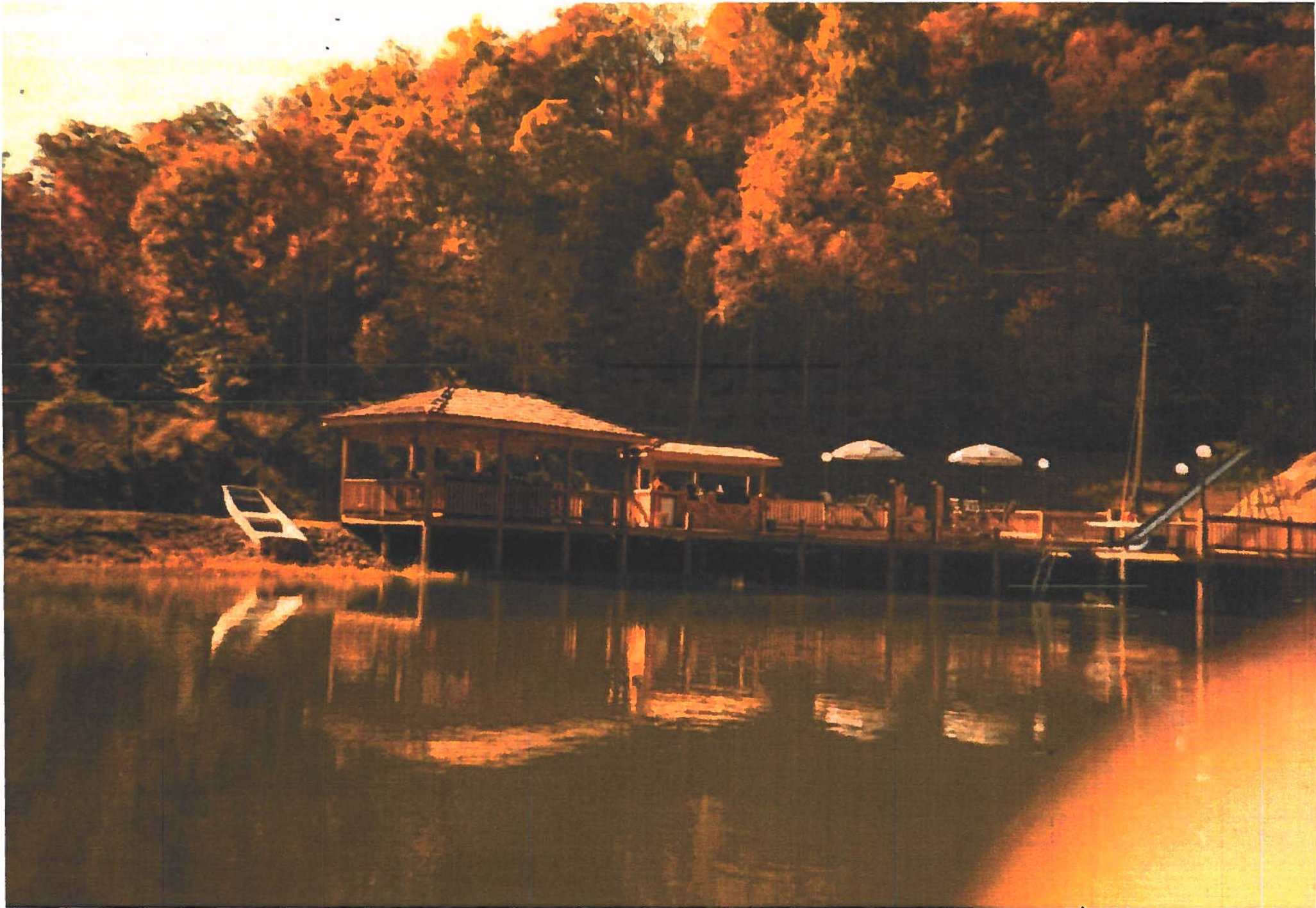
EXHIBIT (NO. 4) CASE (NO. "2021-00346") " WAPLER POND ": DECK COMPLEX W/ CABANA CARRYING LINE & BRAND REPEATER . INCLUDING

95 ACRE WATERSHED / IN DIRECT PATH OF TRANSMISSION LINE S.