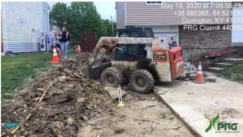
440950 - Investigator5.JPG