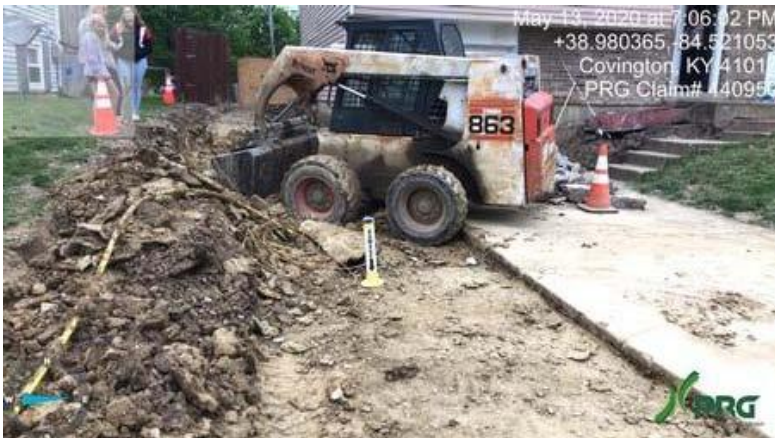
440950 - Investigator7.JPG