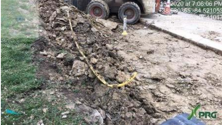
440950 - Investigator9.JPG