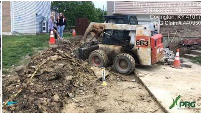
440950 - Investigator6.JPG