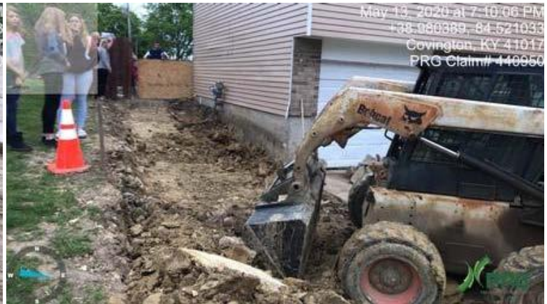
440950 - Investigator20.JPG