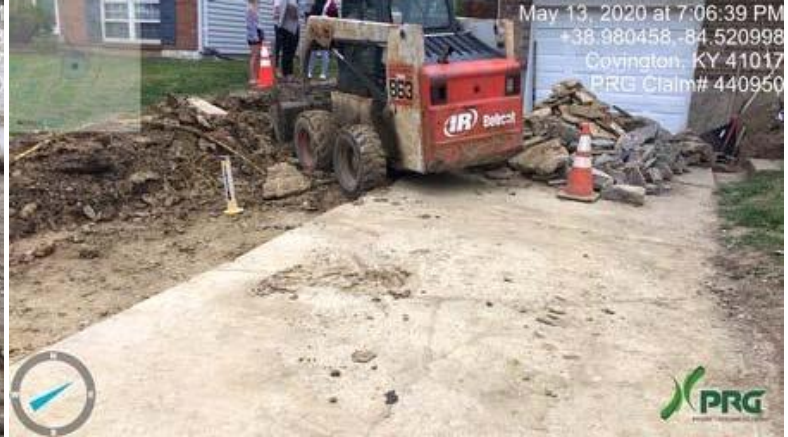
440950 - Investigator18.JPG