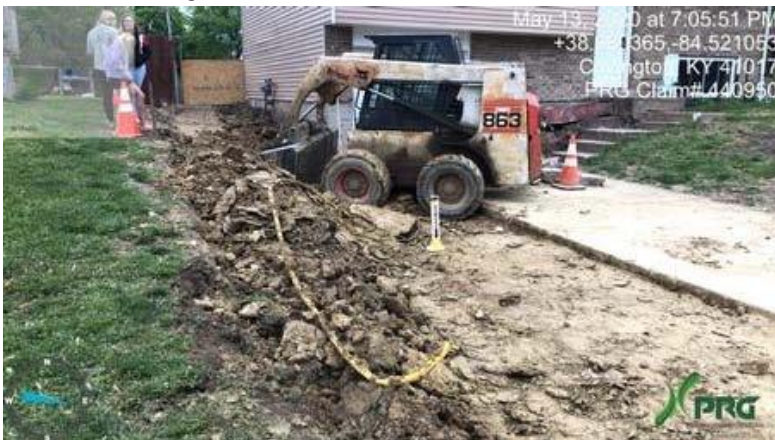
440950 - Investigator3.JPG