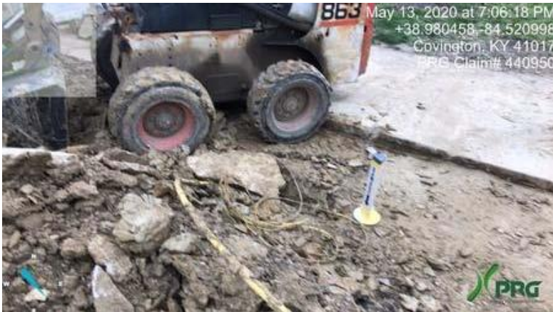
440950 - Investigator15.JPG