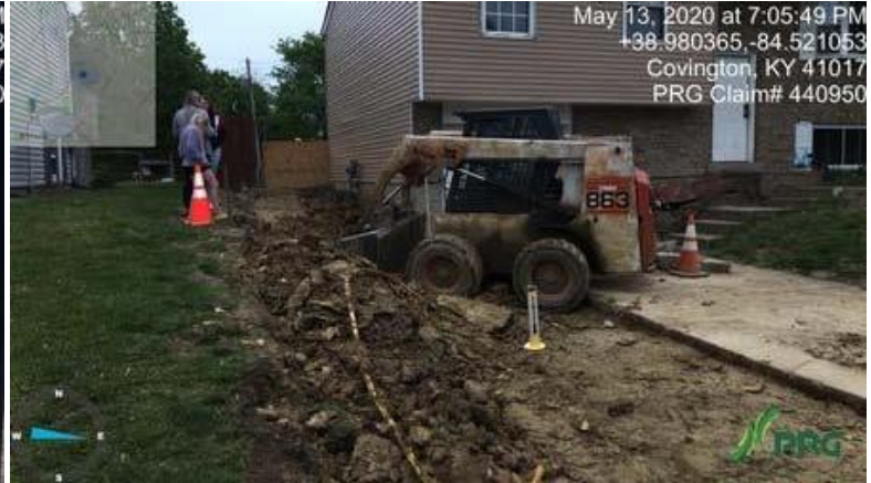
440950 - Investigator2.JPG