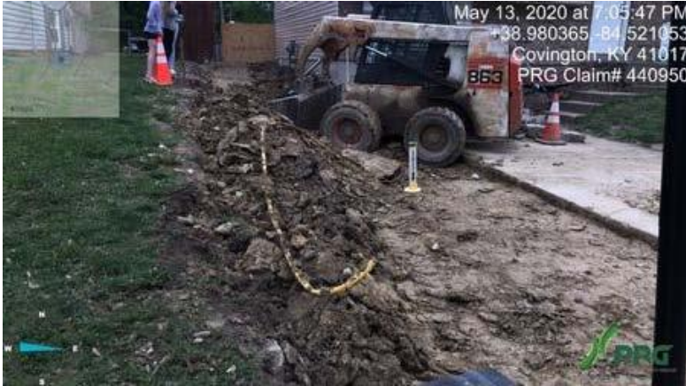
440950 - Investigator1.JPG