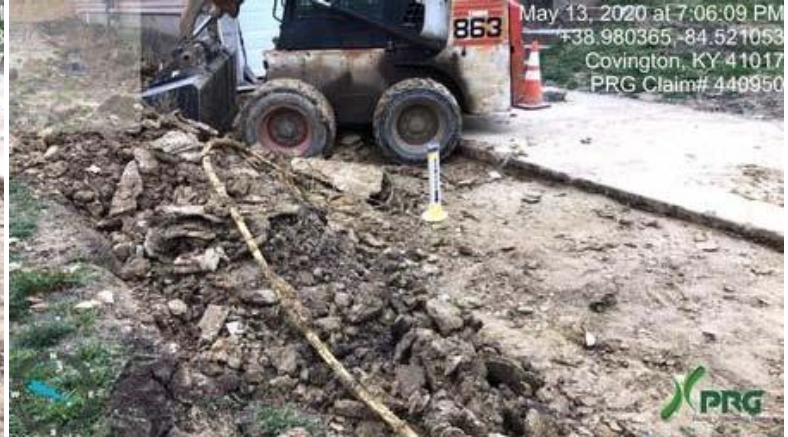
440950 - Investigator10.JPG