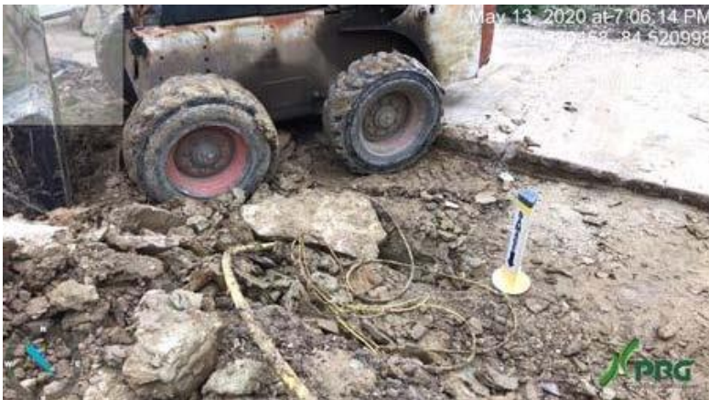
440950 - Investigator13.JPG