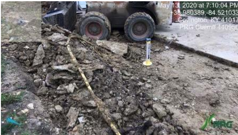
440950 - Investigator19.JPG