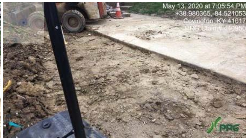
440950 - Investigator4.JPG