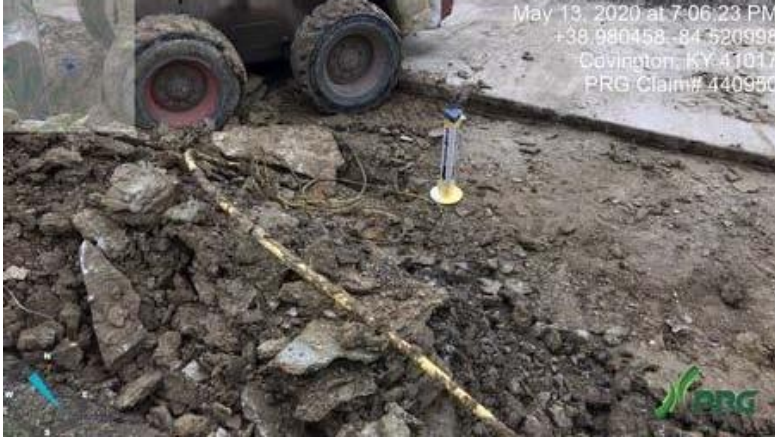
440950 - Investigator17.JPG