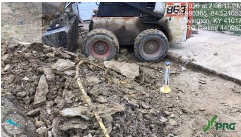
440950 - Investigator11.JPG