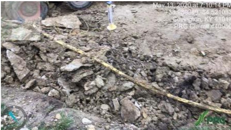
440950 - Investigator23.JPG