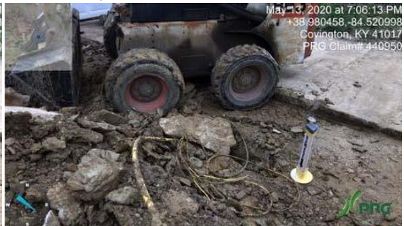
440950 - Investigator12.JPG