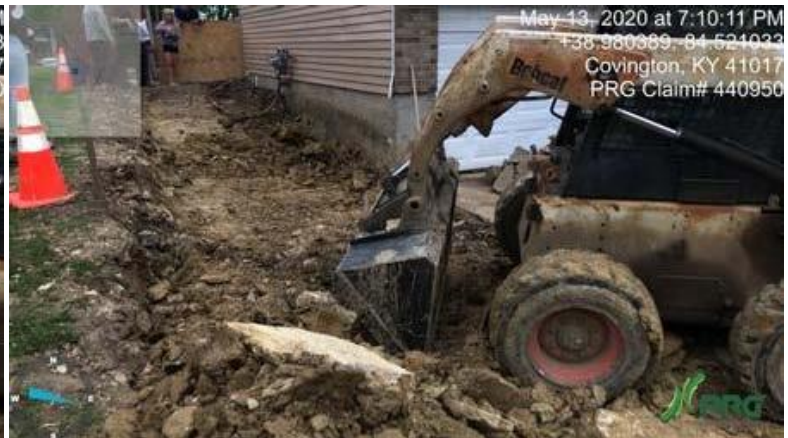
440950 - Investigator22.JPG