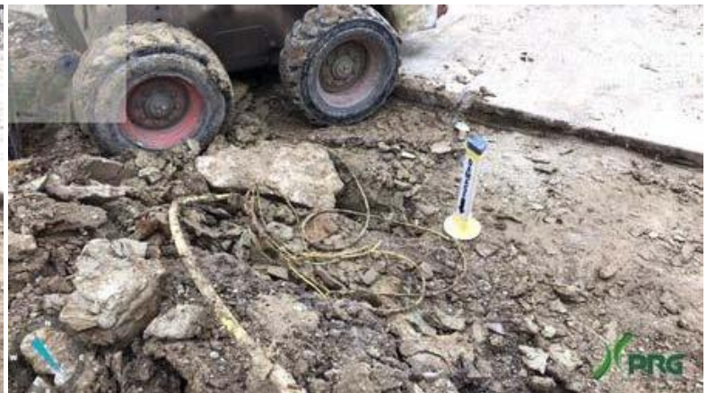
440950 - Investigator14.JPG