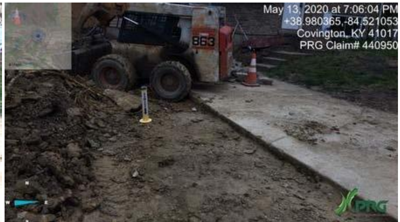
440950 - Investigator8.JPG