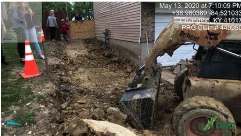
440950 - Investigator21.JPG