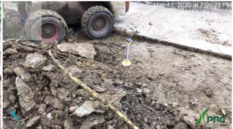
440950 - Investigator16.JPG