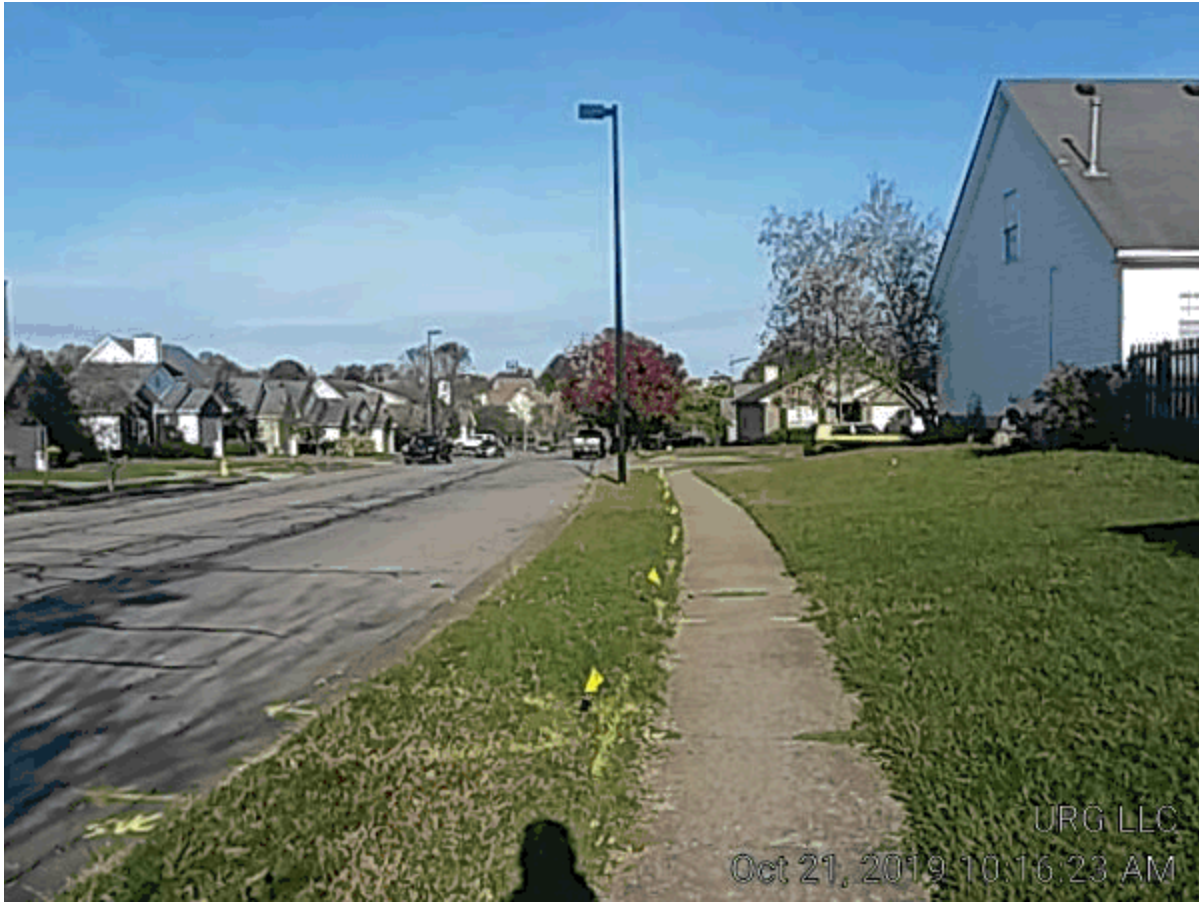
You can see both locate marks post-damage in the picture below: