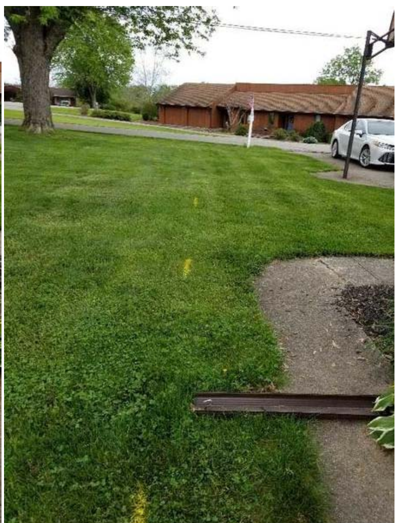
Property of United States Infrastructure Corporation Photo created on 05/27/2020 16:09:51 PM EDT