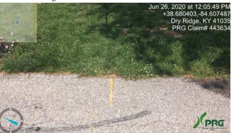
443634 - Investigator3.JPG