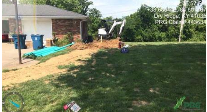
443634 - Investigator7.JPG