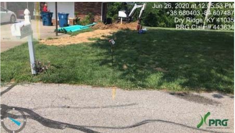
443634 - Investigator5.JPG