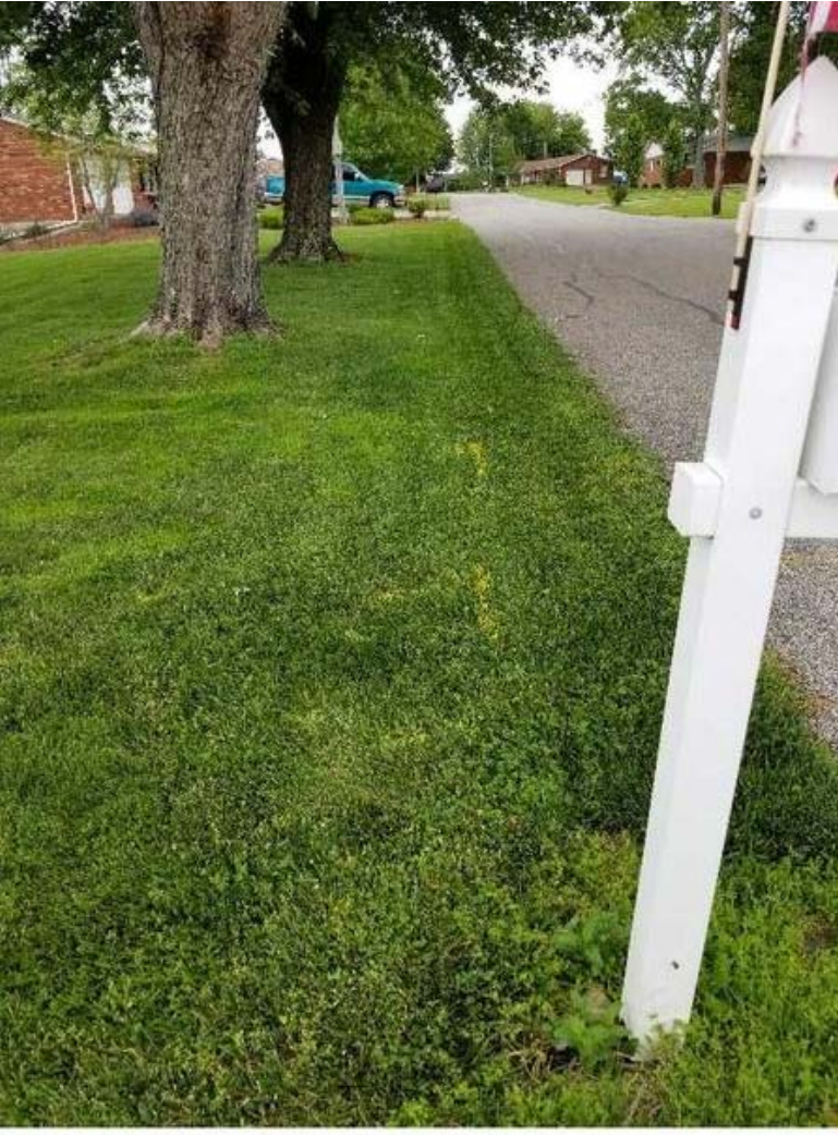
Property of United States Infrastructure Corporation Photo created on 05/27/2020 16:08:54 PM EDT