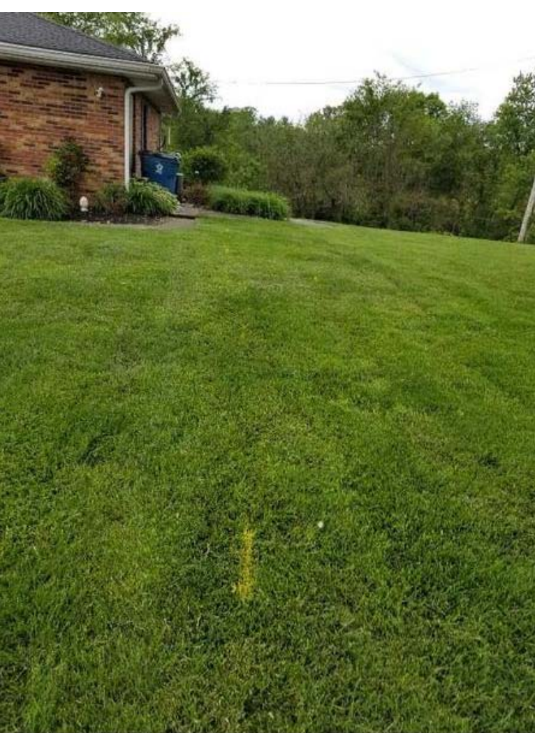
Property of United States Infrastructure Corporation Photo created on 05/27/2020 16:10:02 PM EDT