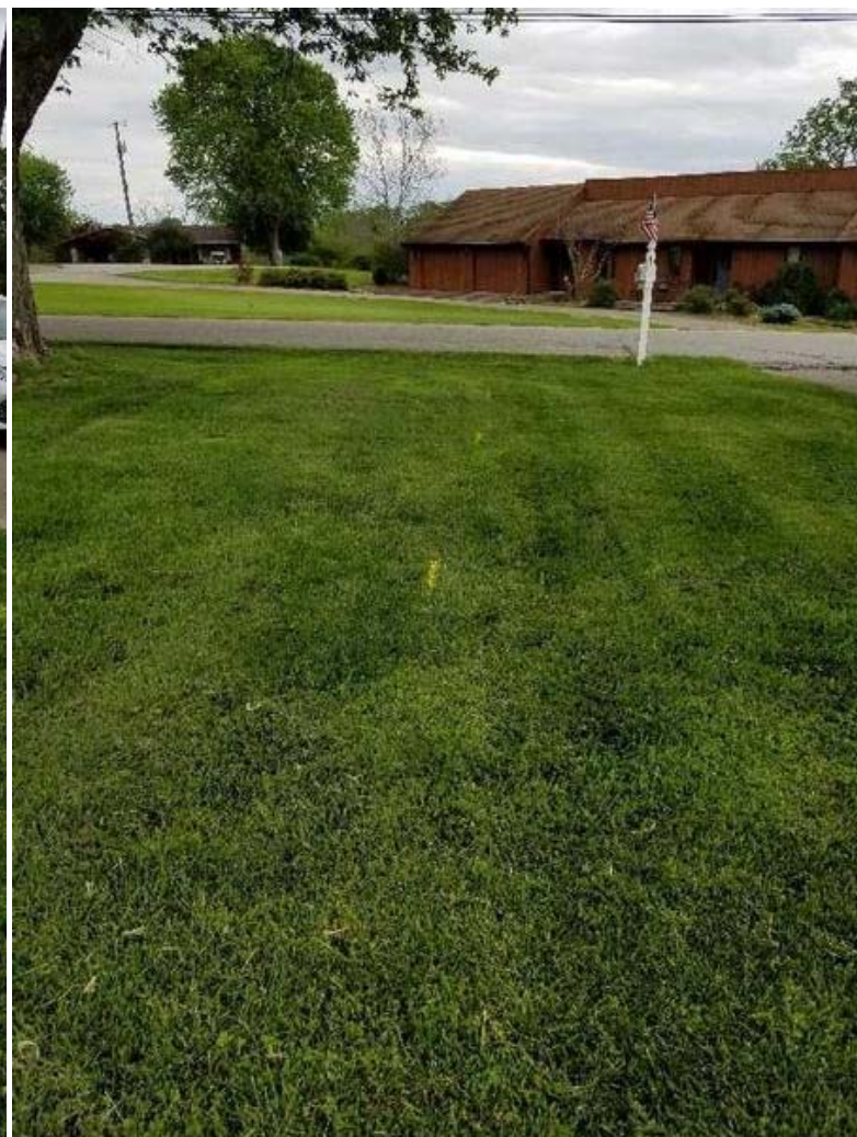
Property of United States Infrastructure Corporation Photo created on 05/27/2020 16:09:55 PM EDT