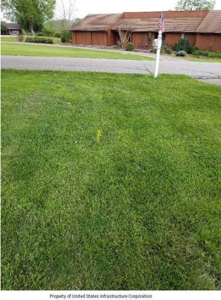
Photo created on 05/27/2020 16:09:58 PM EDT