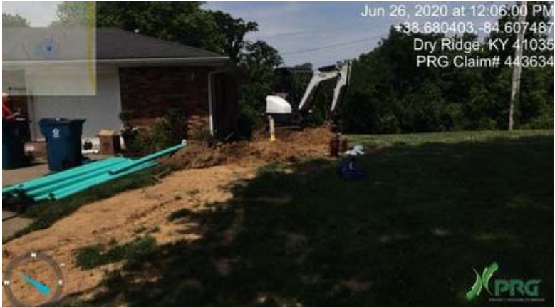
Page: 14936341 Investigator8.JPG