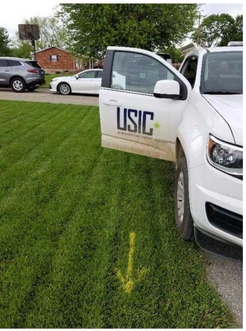
Photo created on 05/27/2020 16:08:40 PM EDT