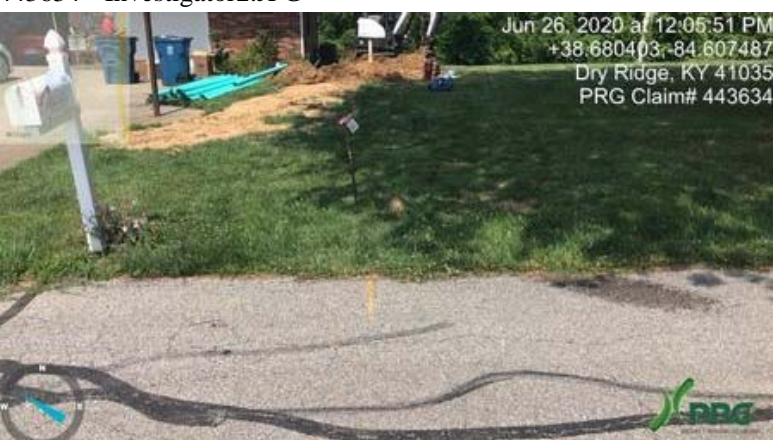
443634 - Investigator4.JPG