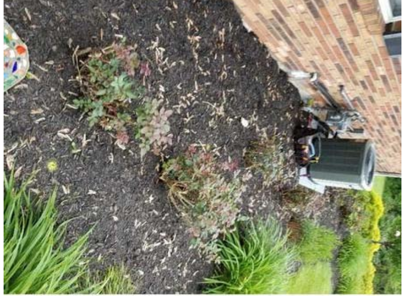
Photo created on 05/27/2020 16:09 33 PM EDT