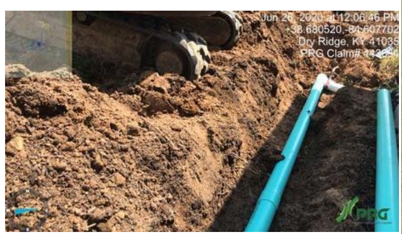
443634 - Investigator55.JPG