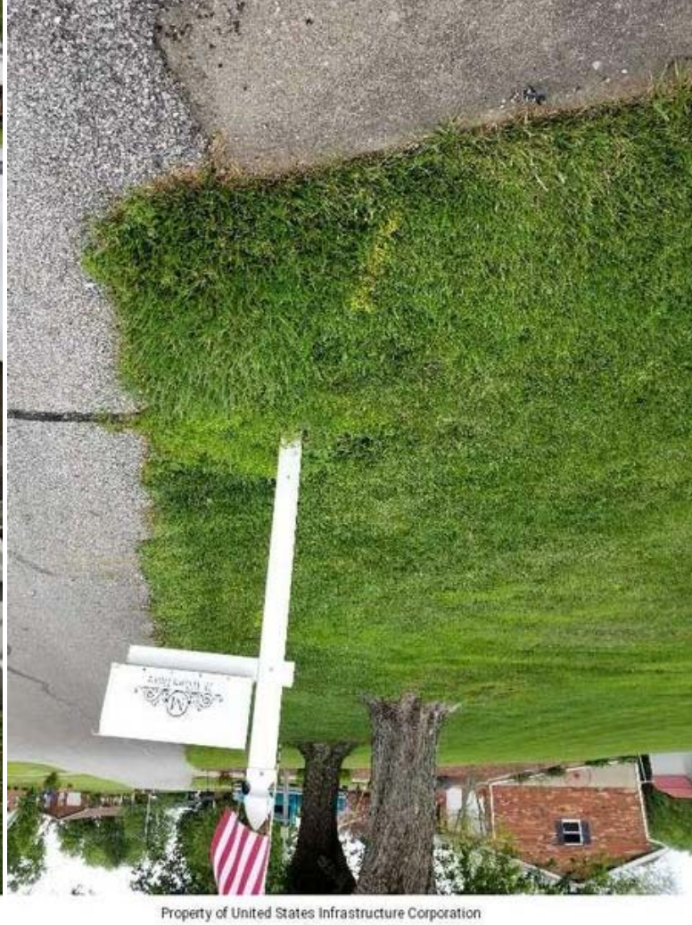
Property of United States Infrastructure Corporation Photo created on 05/27/2020 16:08:43 PM EDT