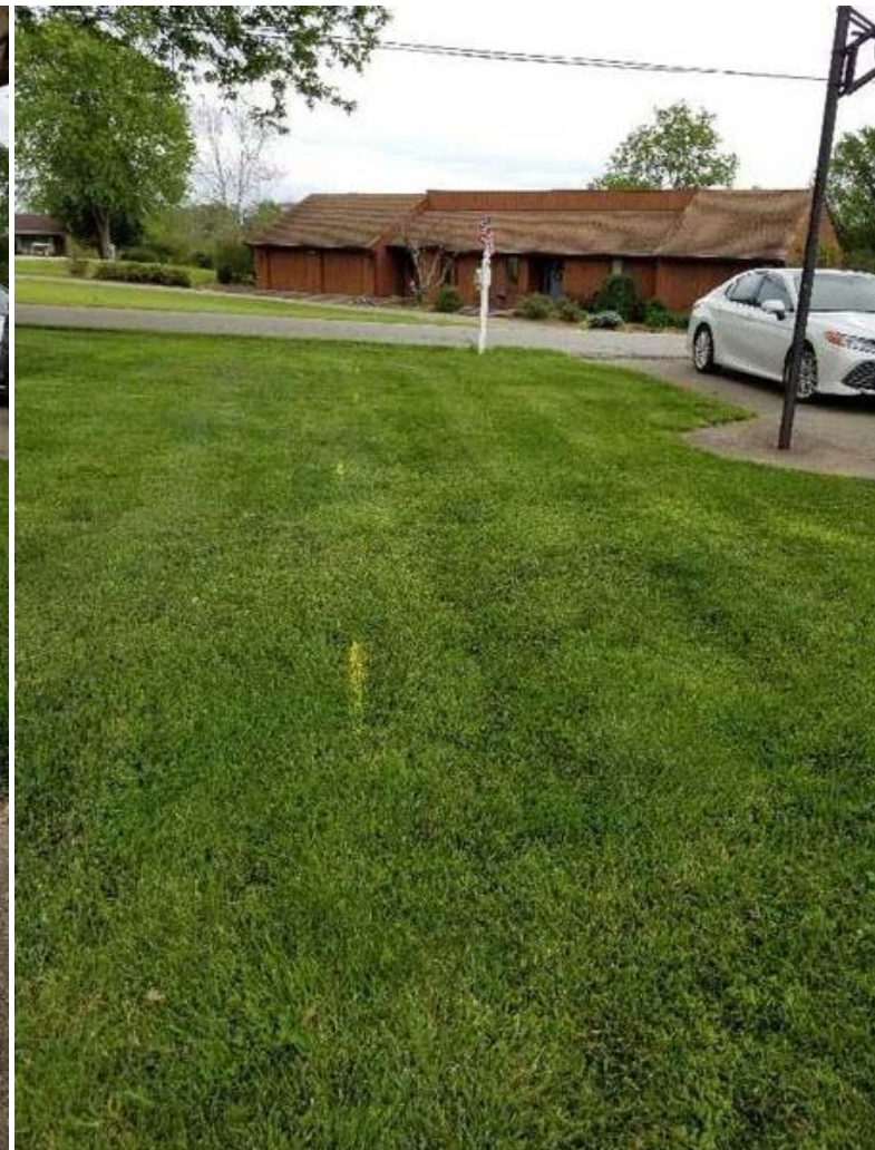
Property of United States Infrastructure Corporation Photo created on 05/27/2020 16:09:53 PM EDT