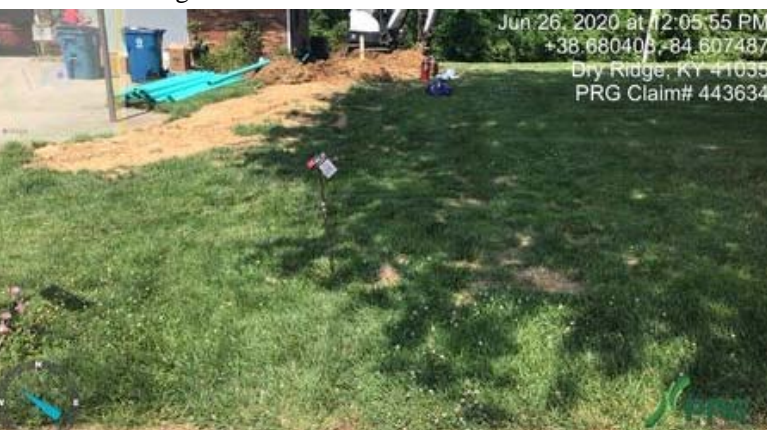
443634 - Investigator6.JPG