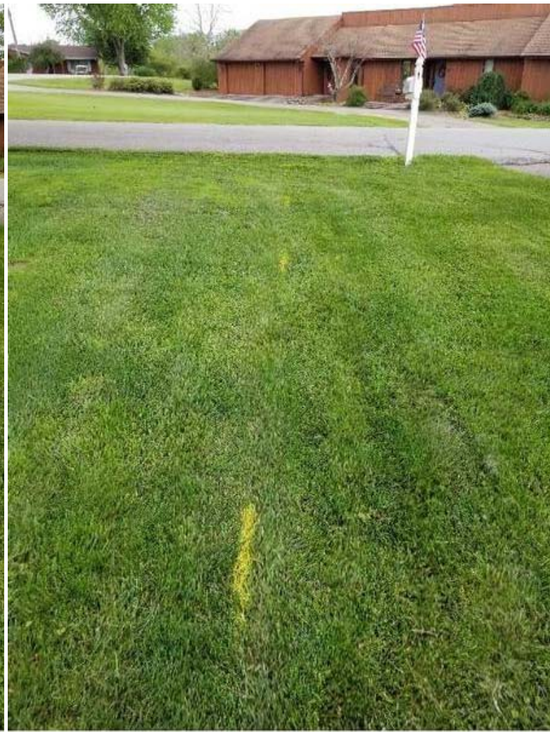
Property of United States Infrastructure Corporation Photo created on 05/27/2020 16:09:57 PM EDT