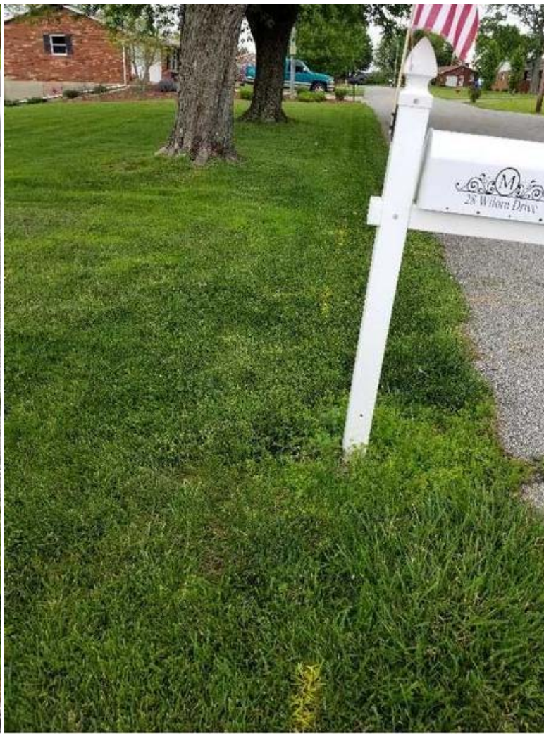
Property of United States Infrastructure Corporation Photo created on 05/27/2020 16:08:53 PM EDT