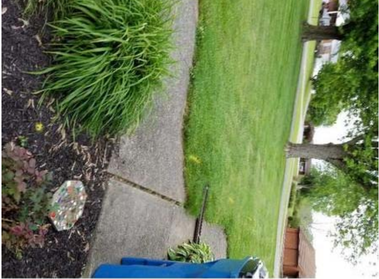
Photo created on 05/27/2020 16:09:49 PM EDT