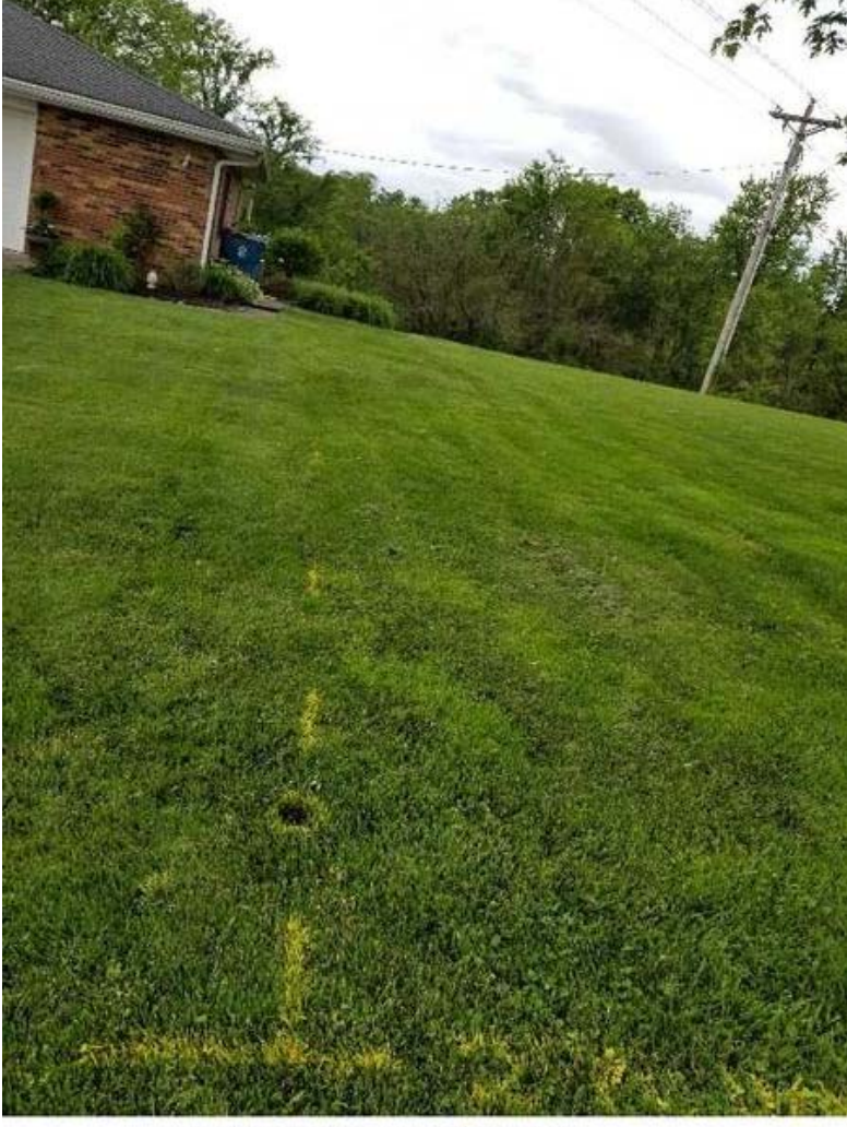
Property of United States Infrastructure Corporation Photo created on 05/27/2020 16:10:05 PM EDT