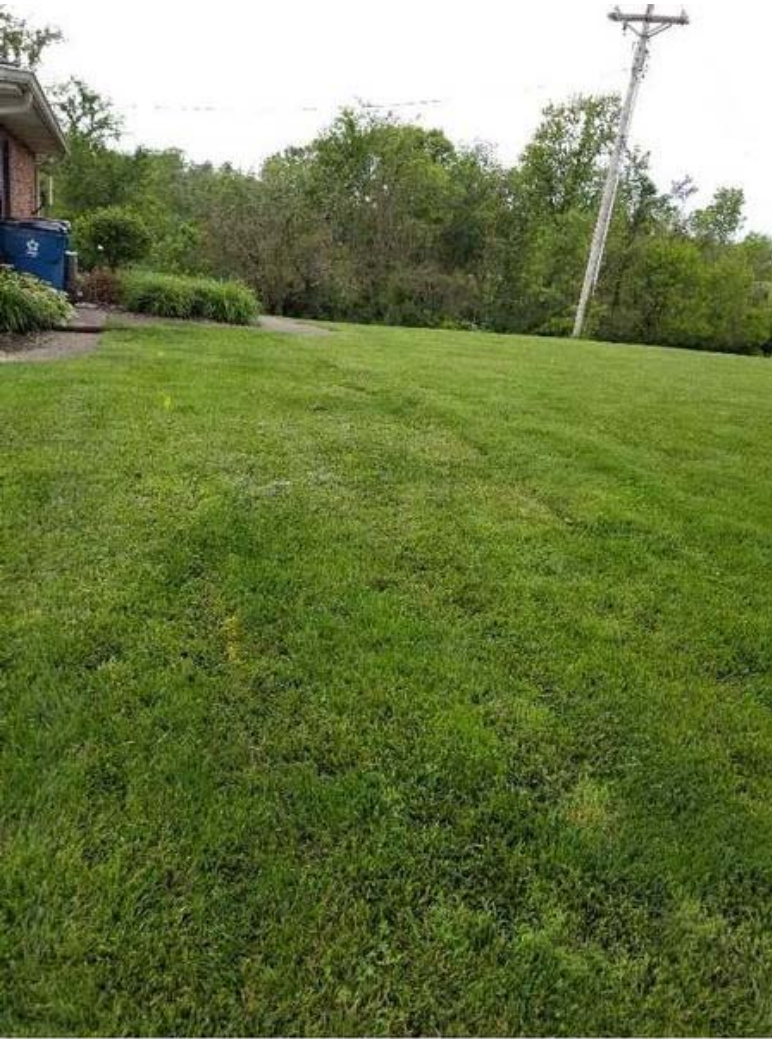
Photo created on 05/27/2020 16:10:00 PM EDT