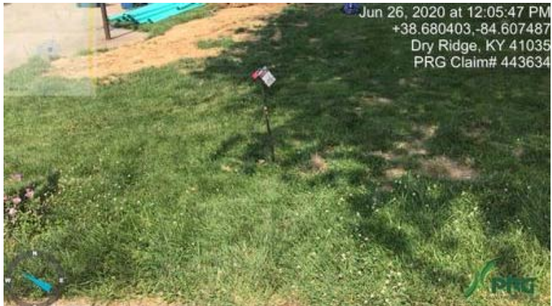
443634 - Investigator2.JPG