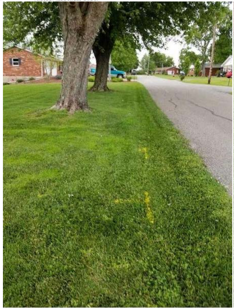
Property of United States Infrastructure Corporation Photo created on 05/27/2020 16:08:55 PM EDT