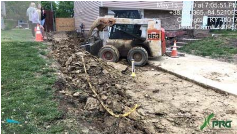
440950 - Investigator3.JPG