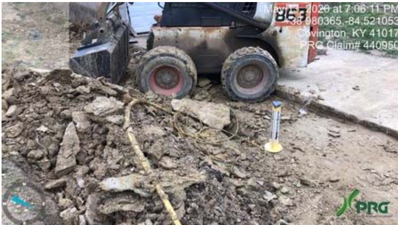
440950 - Investigator11.JPG