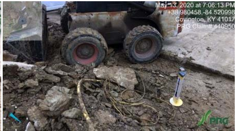
440950 - Investigator12.JPG