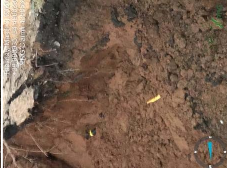
435856 - Investigator2.jpeg