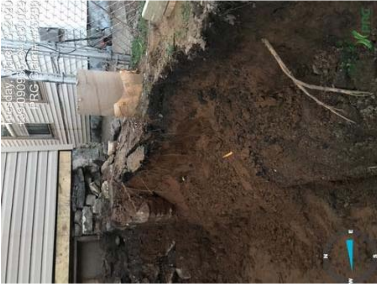
435856 - Investigator1.jpeg