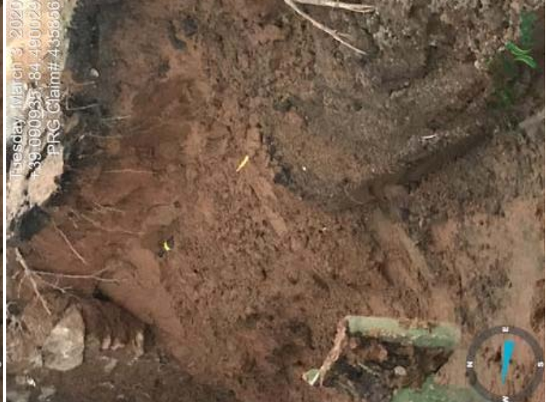
435856 - Investigator6.jpeg