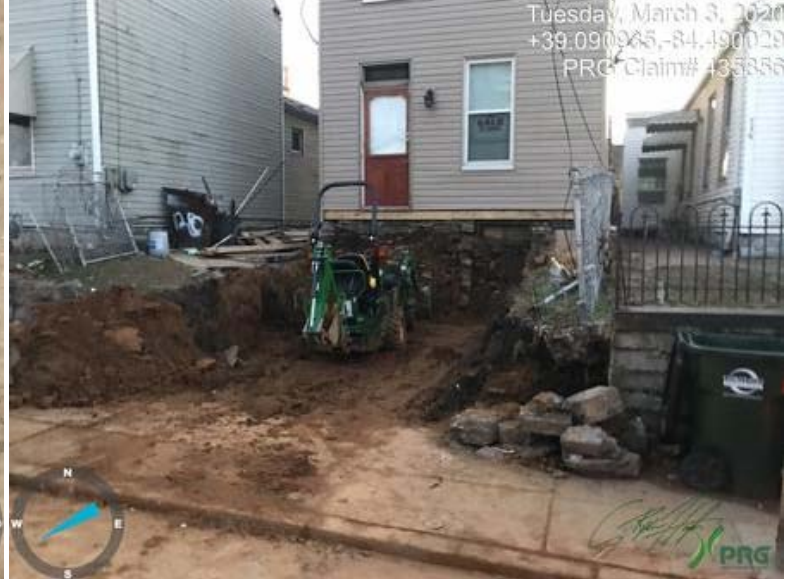
435856 - Investigator4.jpeg