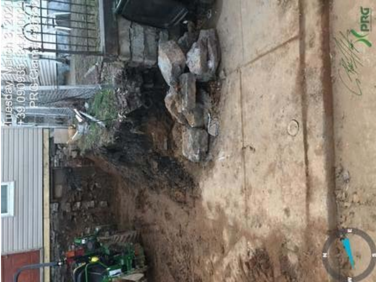
435856 - Investigator3.jpeg