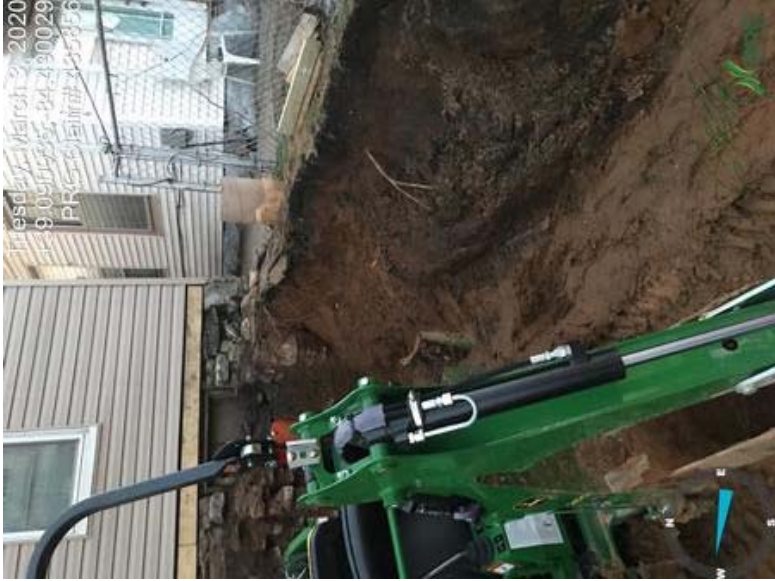
435856 - Investigator7.jpeg