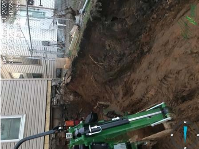
435856 - Investigator5.jpeg