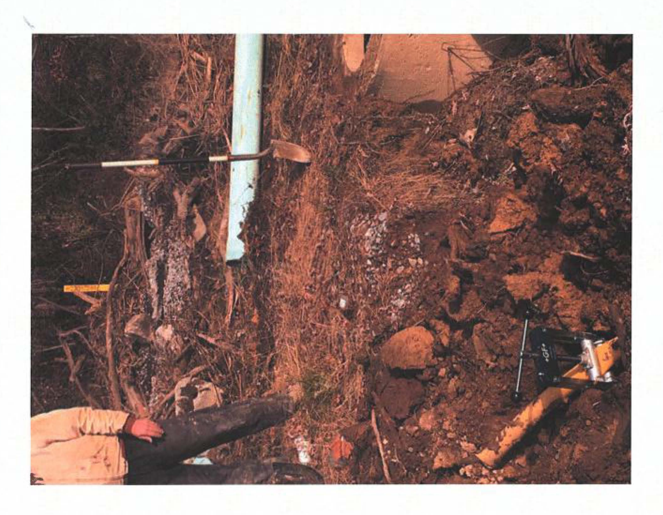
Sent from my iPhone