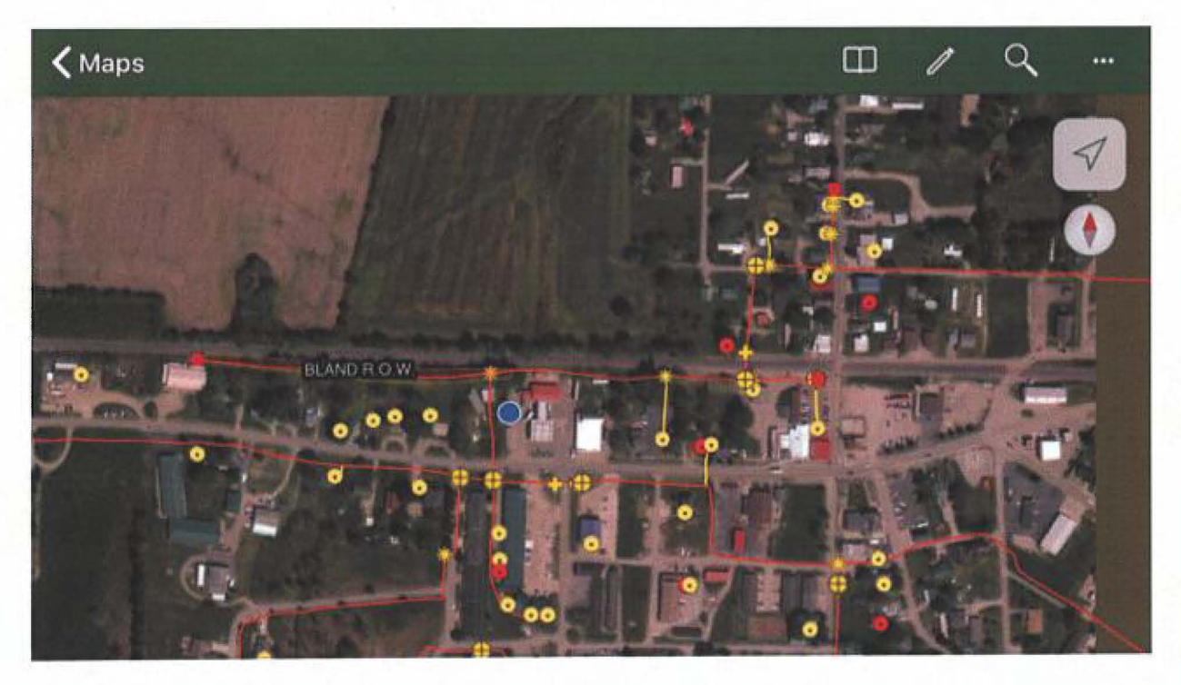
Sent from my iPhone