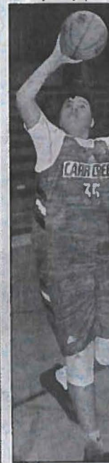
Kenyon Higgins scores