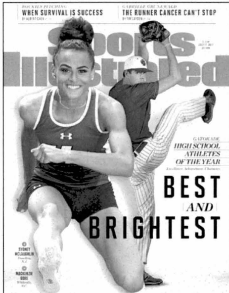
Sports signee Sydney McLaughlin became a rare high school athlete to be featured on the cover of Sports Illustrated.