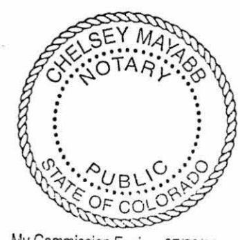
Notary Public - State of Colorado