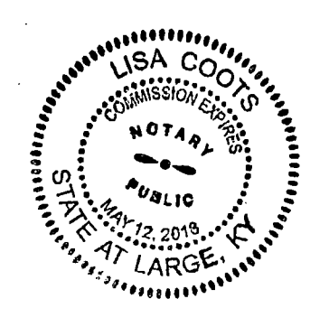
NOTARY PUBLIC State-at-Large