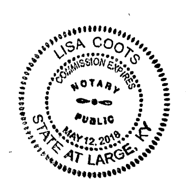
NOTARY PUE State-at-Large