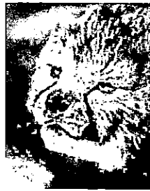
One of five cheetah cubs that were born via C-section at the Cincinnati Zoo on March 8.

It's not all bad news from the zoo: The premature cubs' condition has improved during the last few days, zoo officials said. The cubs — three boys and two girls — have been getting around-the-clock critical care in