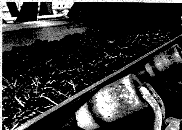
An ongoing University of Kentucky/East Kentucky Power Cooperative biomass research project includes testing ways to mix dried switchgrass with coal to generate electricity at a conventional power plant.

-National Rural Electric Cooperative Association