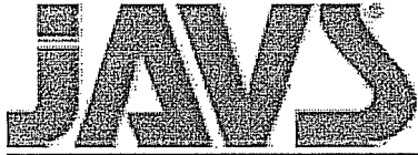
Exhibit List Report

Case Number: 2010-00490_thru_00495_22Mar11