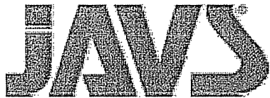
Exhibit List Report

Case Number: 2010-00490_thru_00495_22Mar11