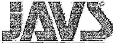
Exhibit List Report

Case Number: 2010-00490_thru_00495_22Mar11