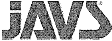
Exhibit List Report

Case Number: 2010-00264_thru_00286_12Oct10