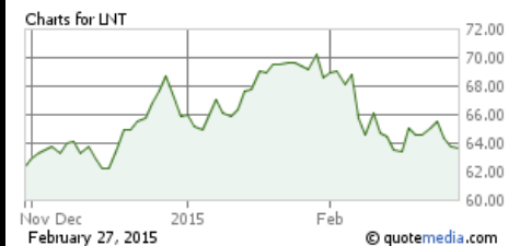
Chart for LNT