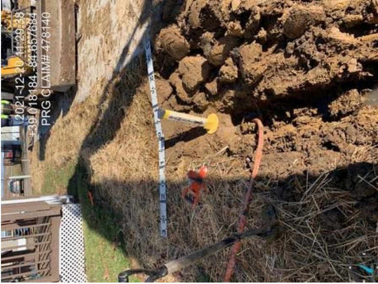
478140 - Investigator1.jpeg