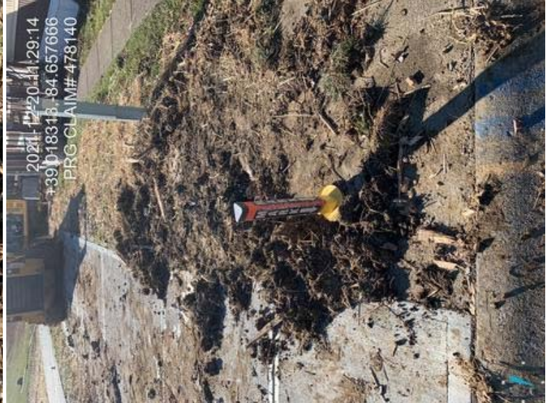
478140 - Investigator4.jpeg