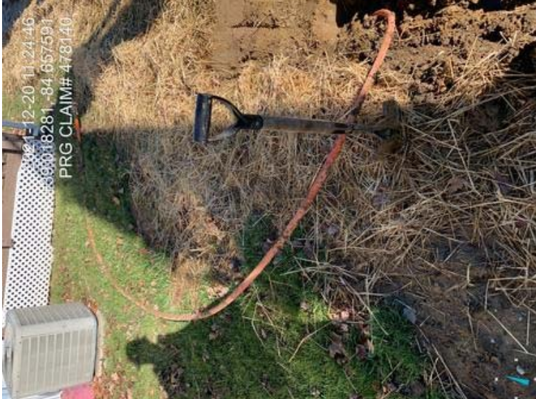
478140 - Investigator9.jpeg