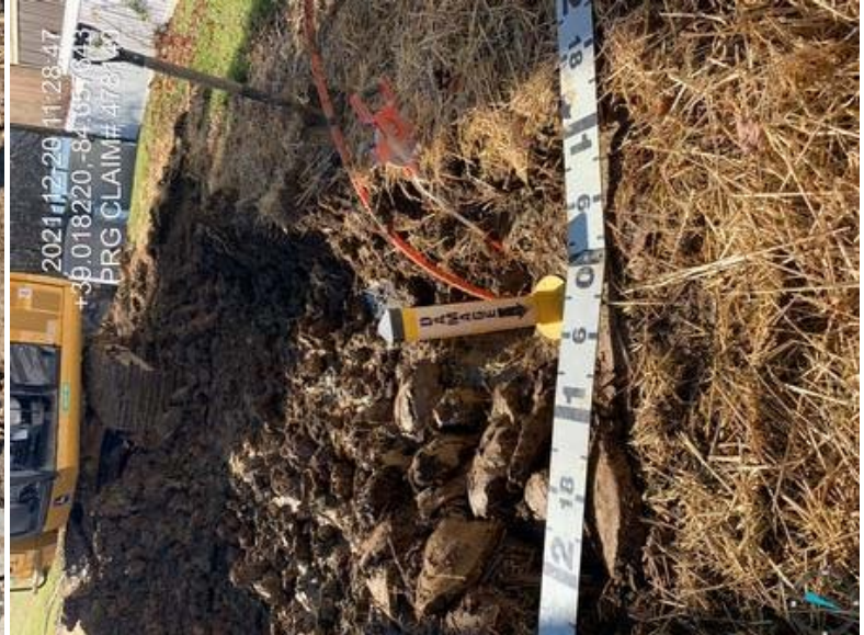
478140 - Investigator6.jpeg