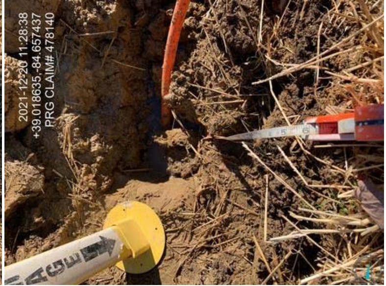
478140 - Investigator8.jpeg