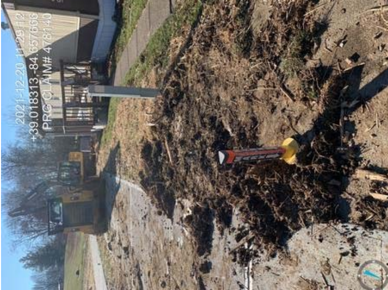
478140 - Investigator5.jpeg