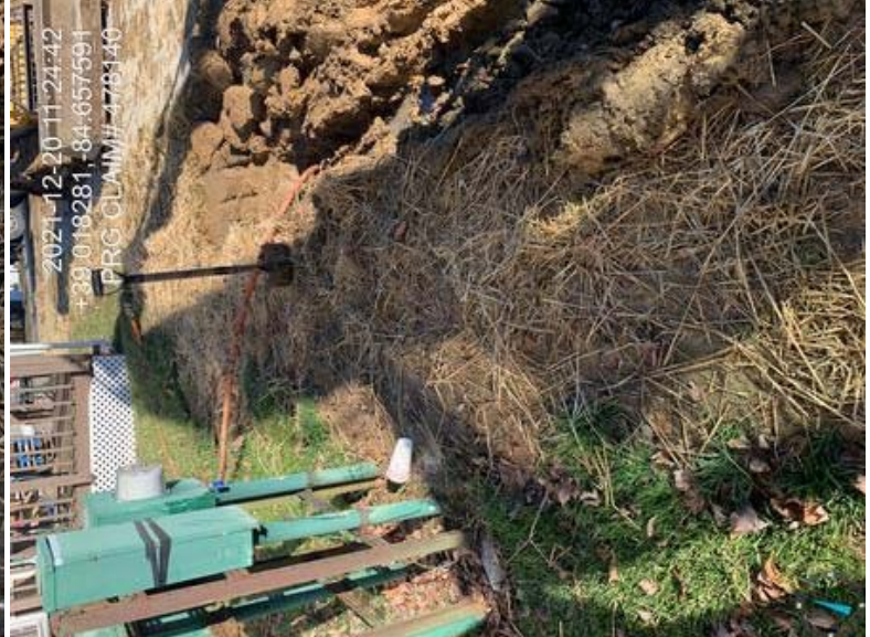
478140 - Investigator10.jpeg