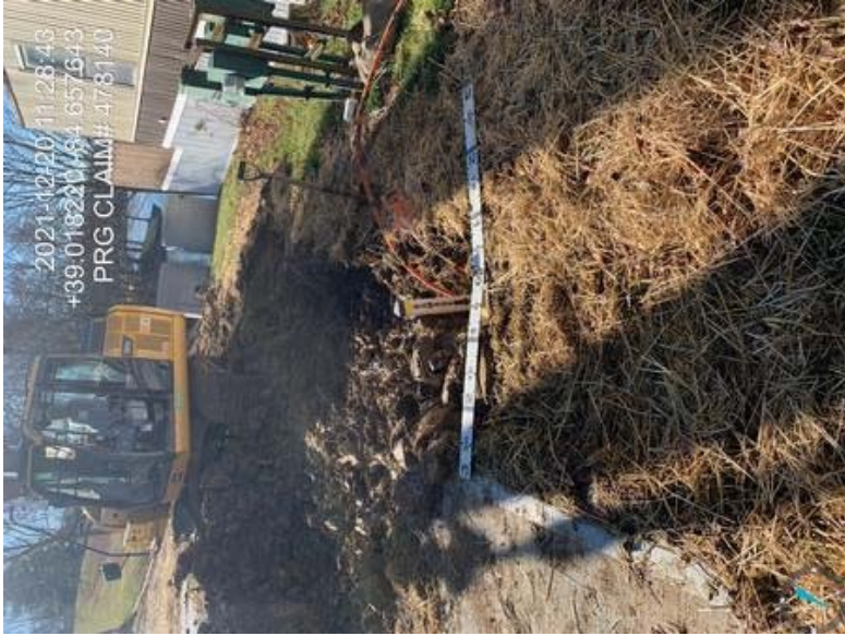
478140 - Investigator7.jpeg