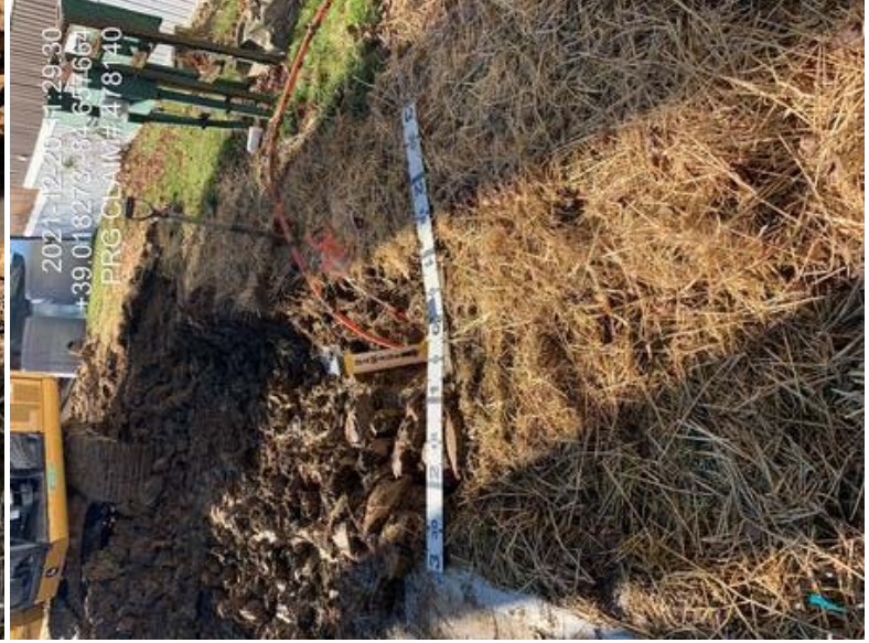
478140 - Investigator2.jpeg