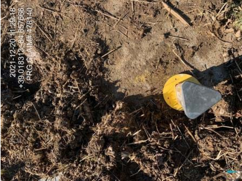
478140 - Investigator3.jpeg