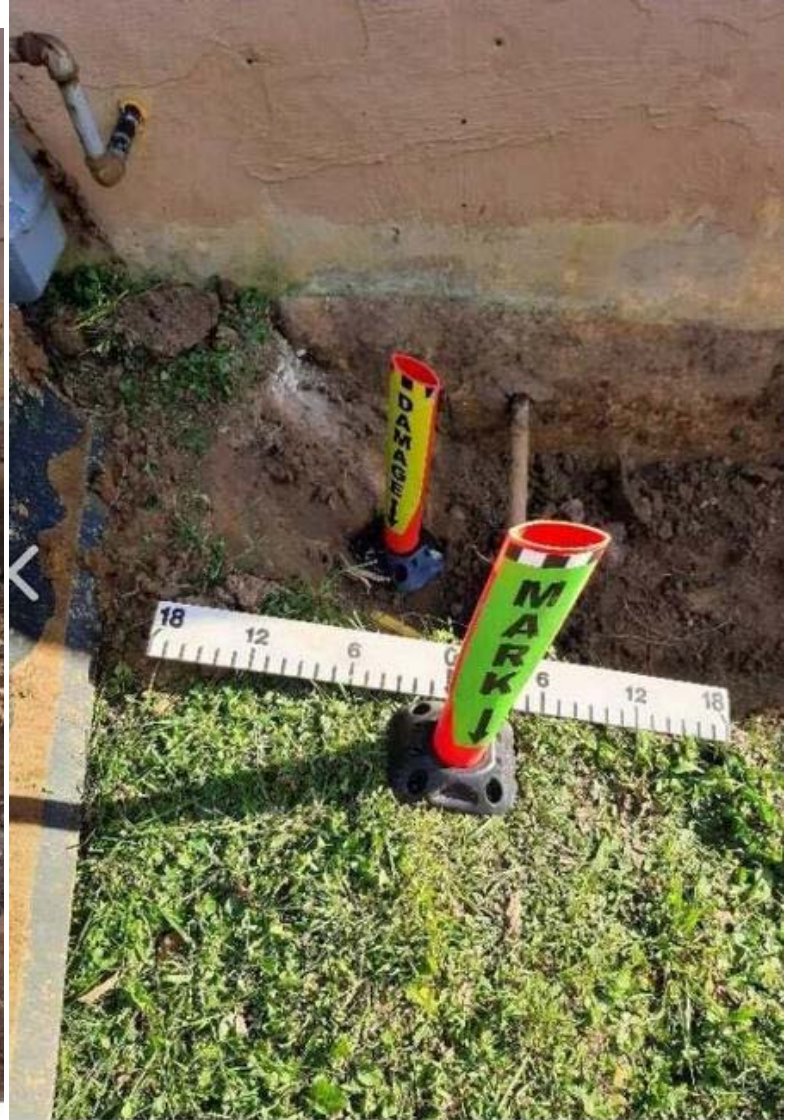
Photo created on 08/05/2021 18:33:04 PM EDT