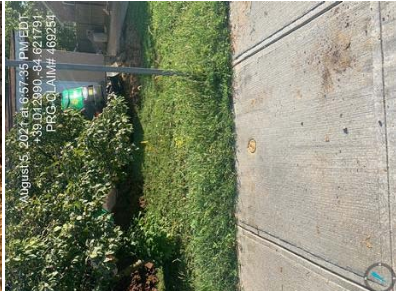
469254 - Investigator12.jpeg