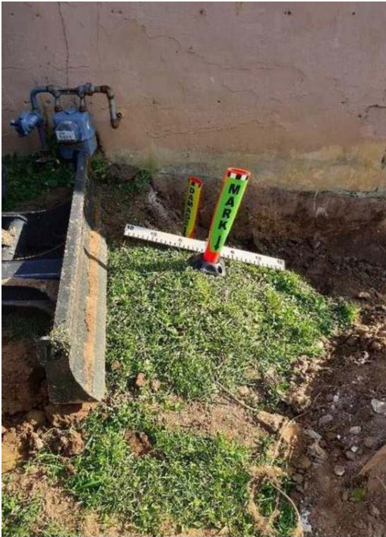
Photo created on 08/05/2021 18:33:01 PM EDT