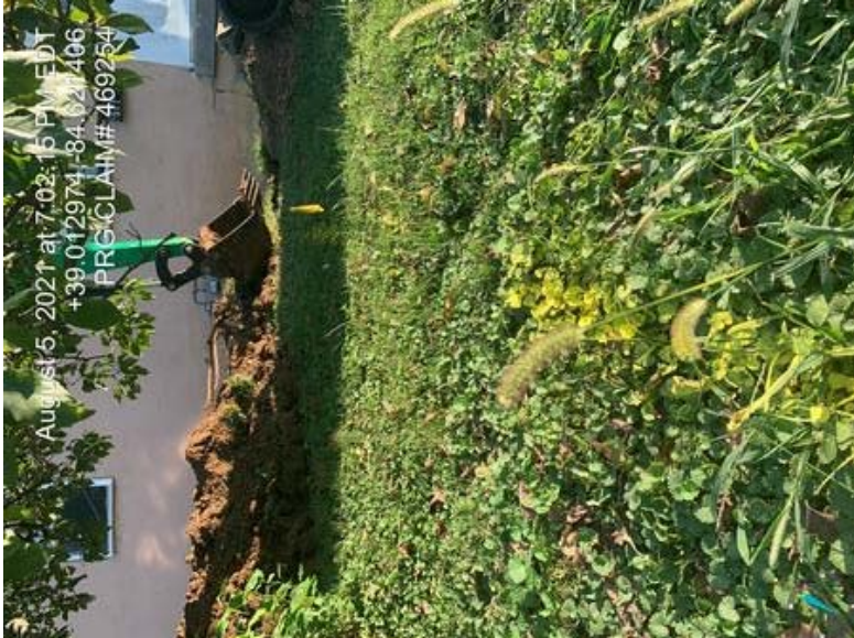
469254 - Investigator5.jpeg