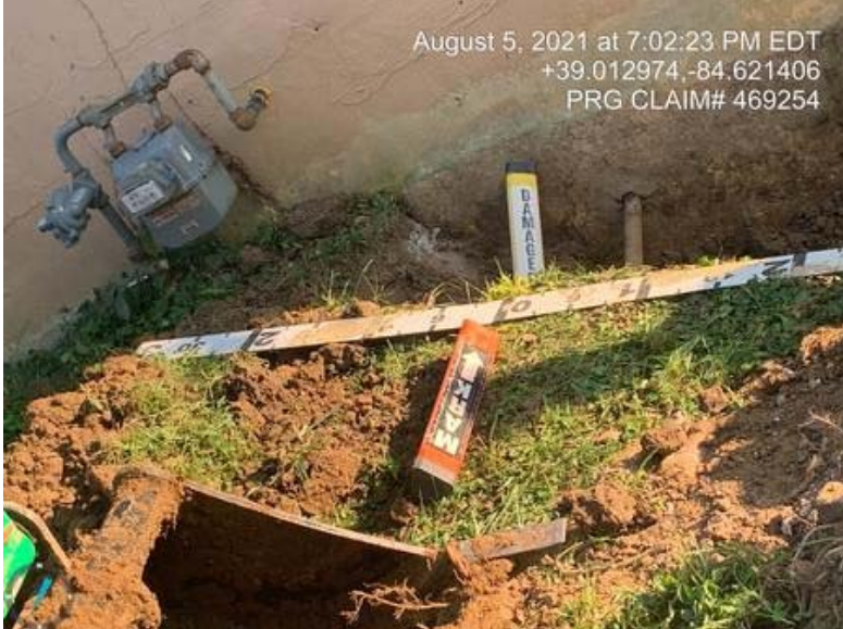
469254 - Investigator3.jpeg