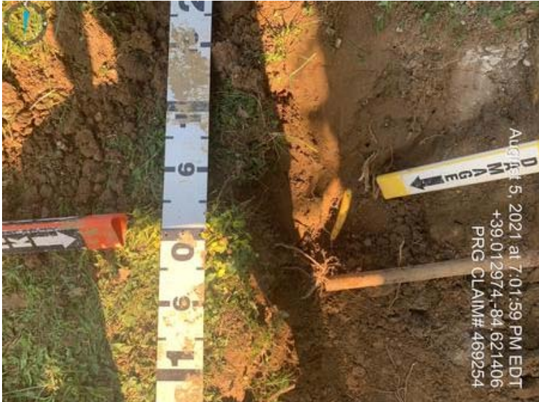
469254 - Investigator9.jpeg