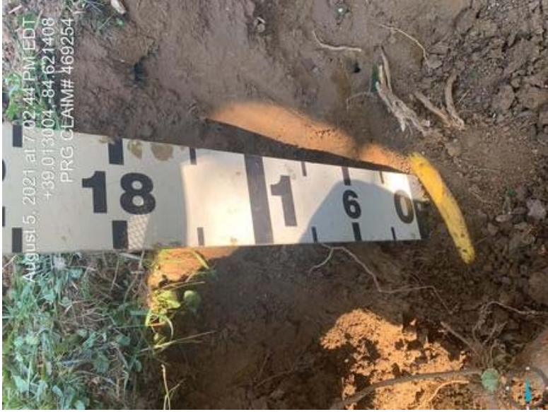
469254 - Investigator1.jpeg