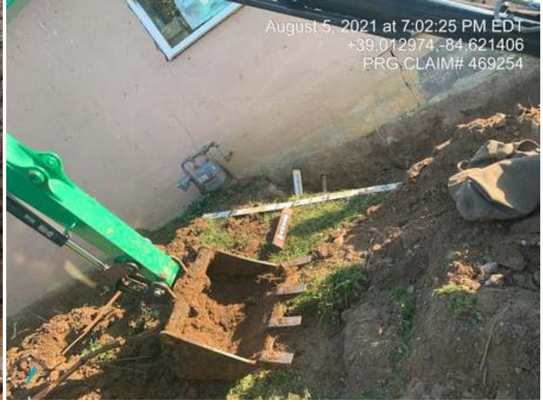
469254 - Investigator2.jpeg