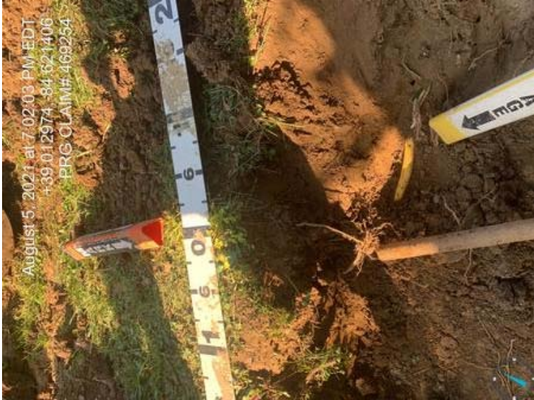
469254 - Investigator7.jpeg