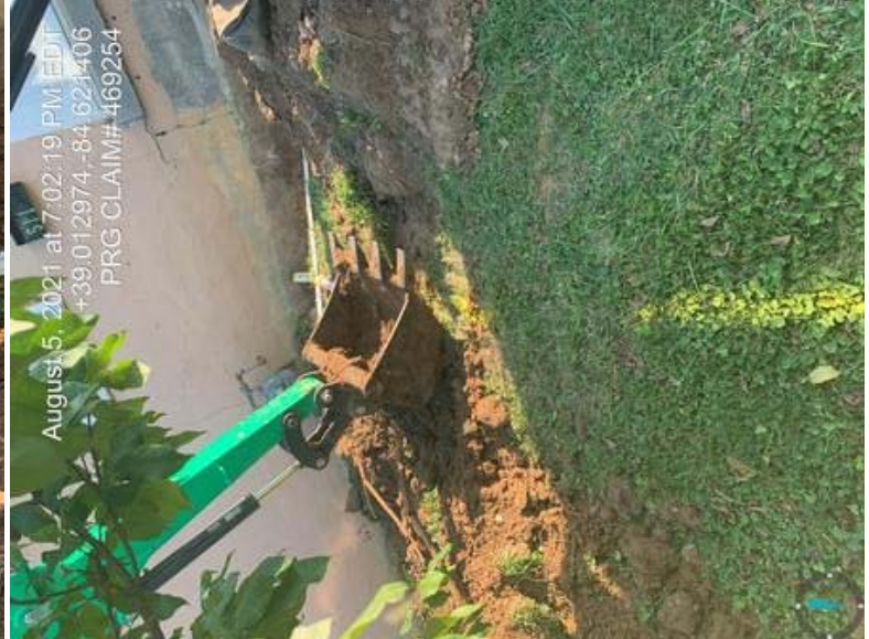
469254 - Investigator4.jpeg