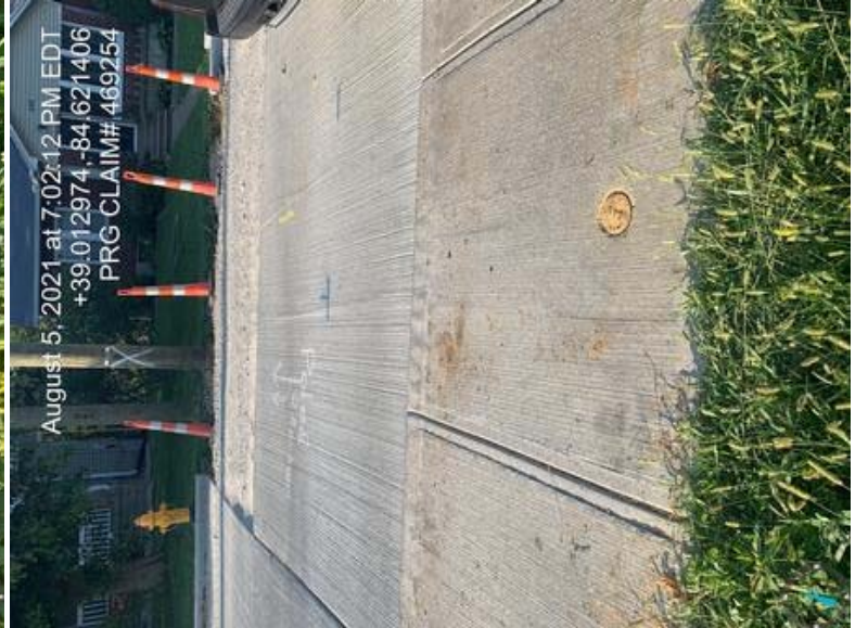
469254 - Investigator6.jpeg