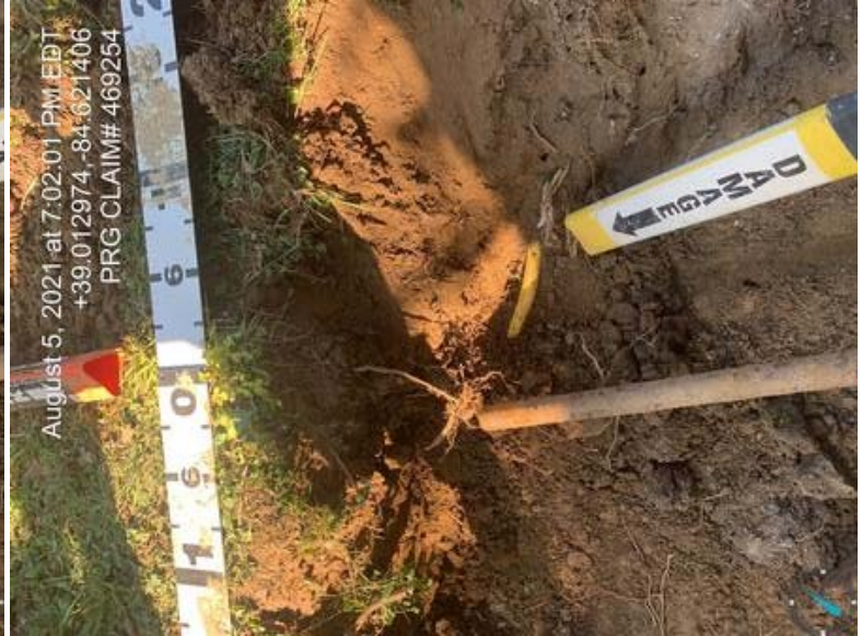
469254 - Investigator8.jpeg