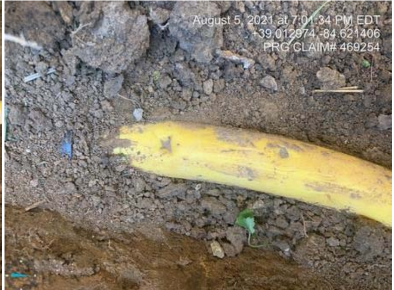
469254 - Investigator10.jpeg