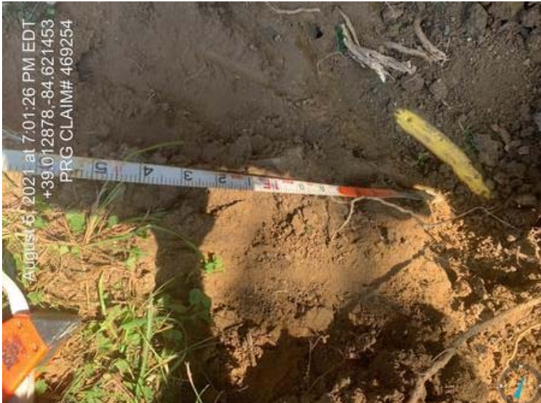
469254 - Investigator11.jpeg