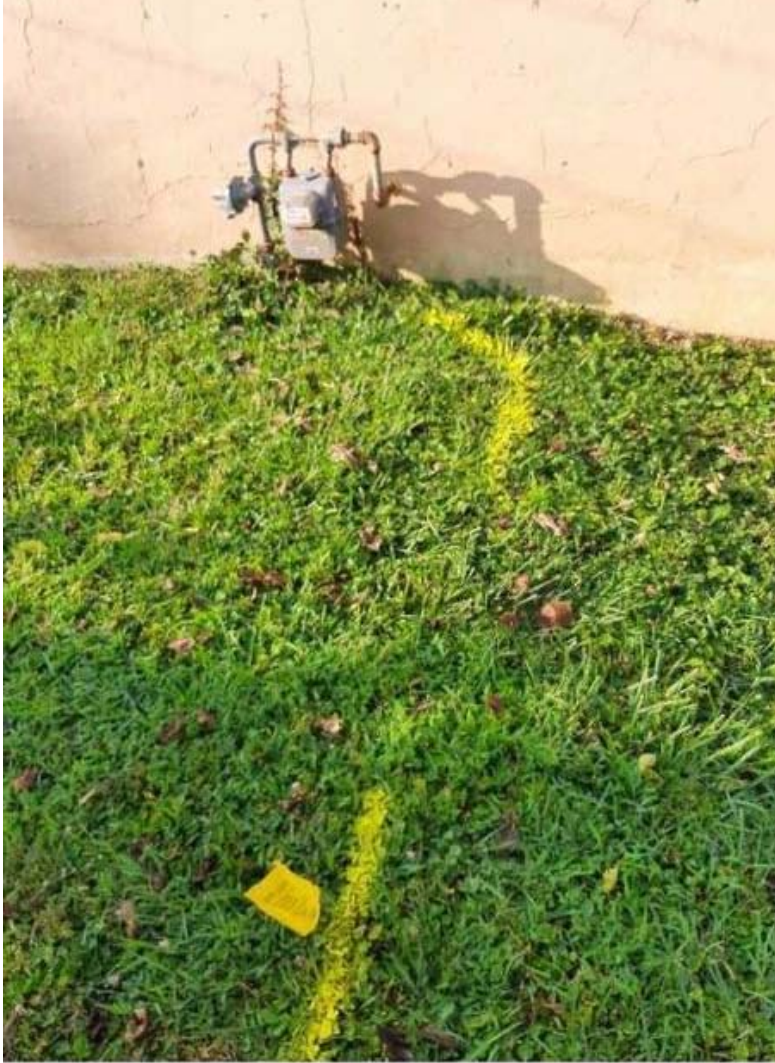
Photo created on 08/02/2021 08:33:10 AM EDT