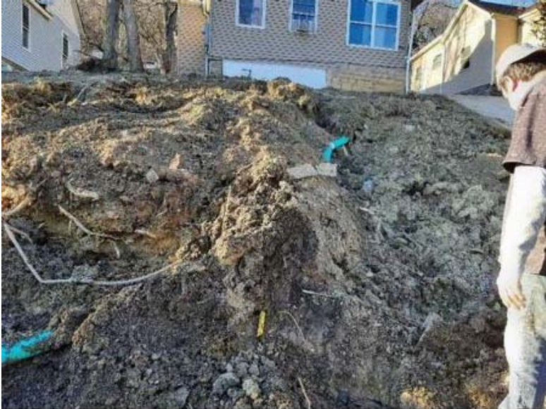
459545 - Locate Damage1.JPG