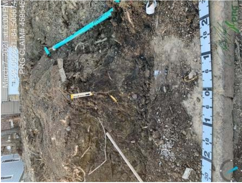
459545 - Investigator1.jpeg