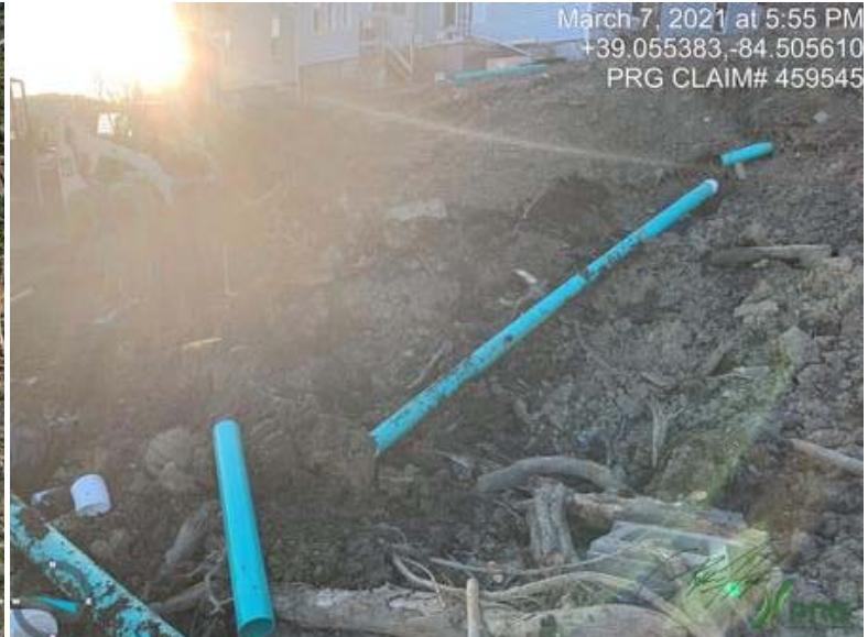
459545 - Investigator6.jpeg