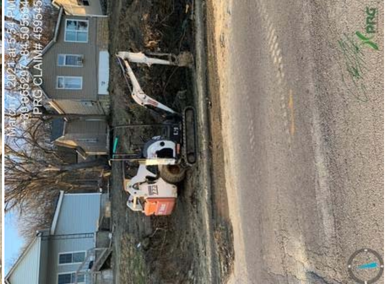
459545 - Investigator10.jpeg