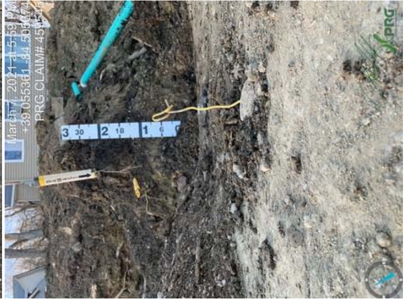
459545 - Investigator2.jpeg