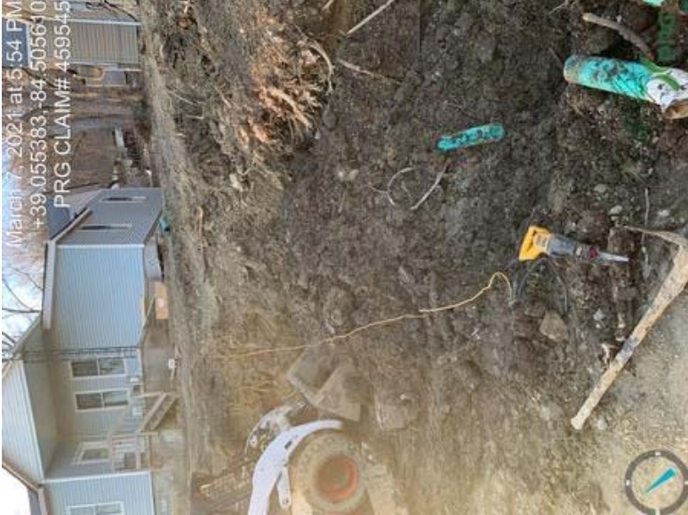
459545 - Investigator9.jpeg