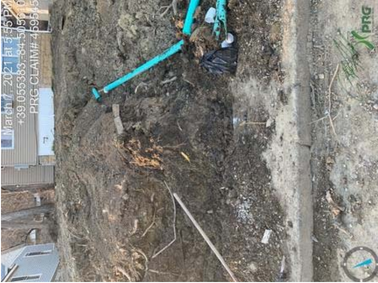
459545 - Investigator7.jpeg