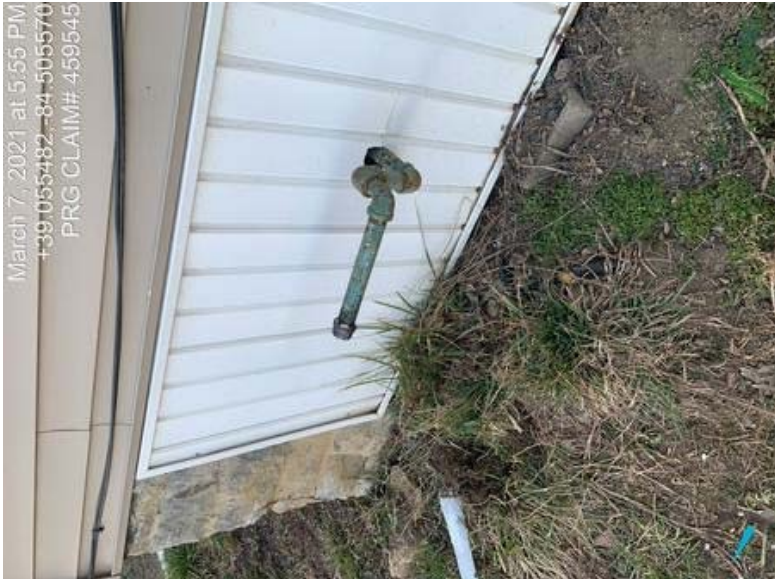
459545 - Investigator5.jpeg