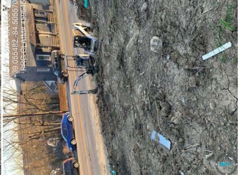
459545 - Investigator4.jpeg