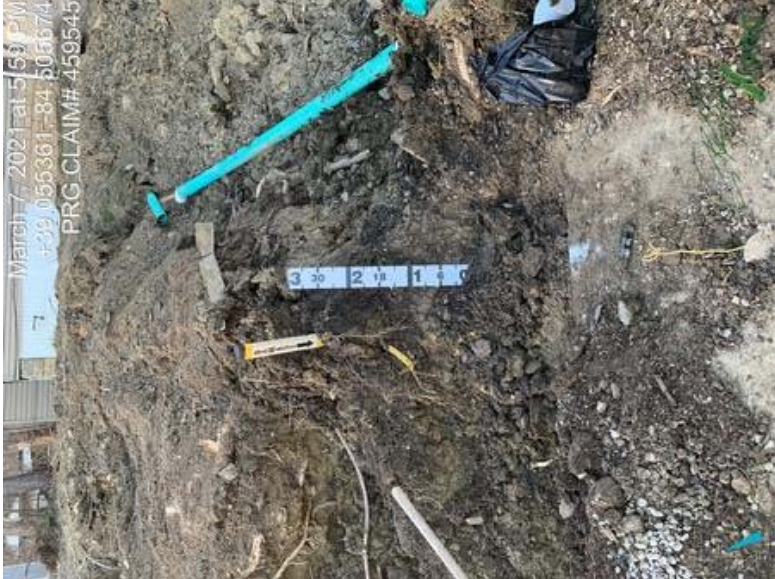
459545 - Investigator3.jpeg