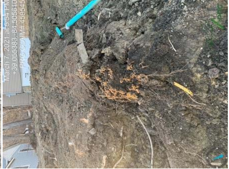
459545 - Investigator8.jpeg