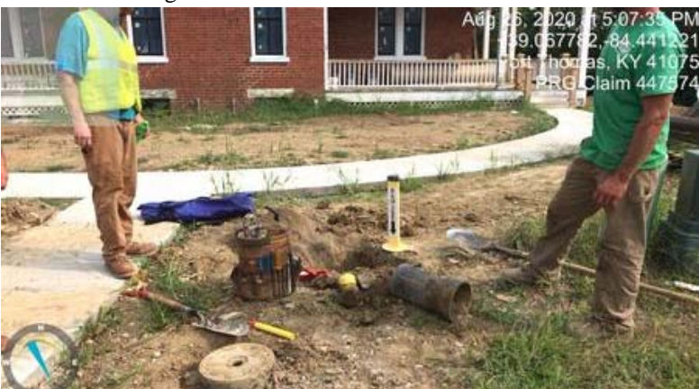
447574 - Investigator7.JPG