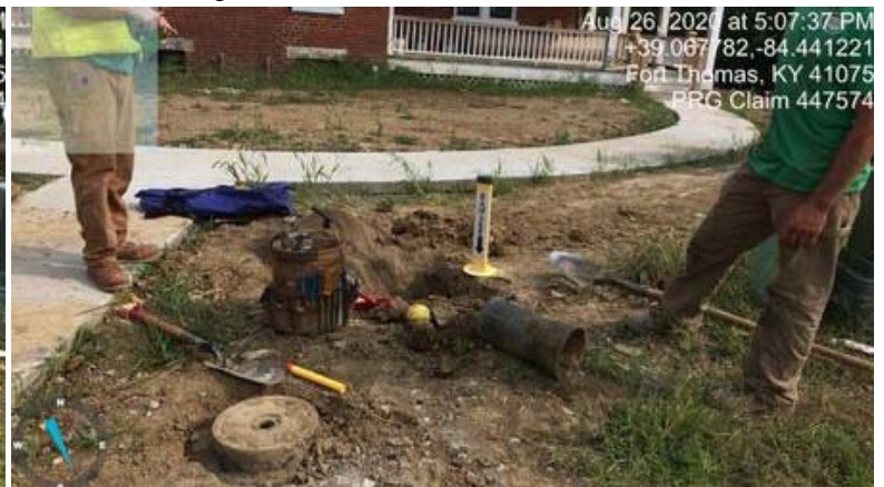
Page: 1449573 - Investigator8.JPG