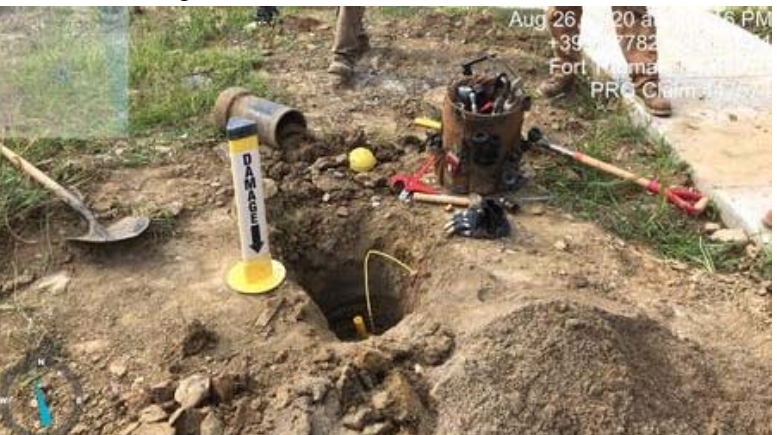
447574 - Investigator4.JPG