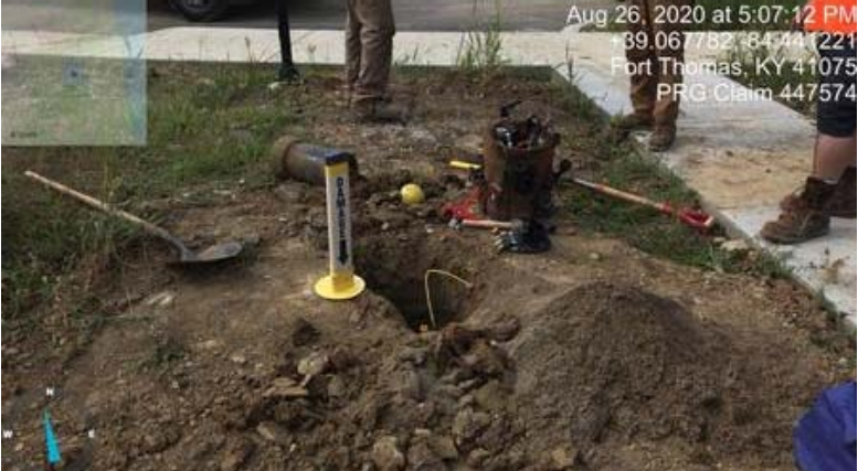
447574 - Investigator2.JPG