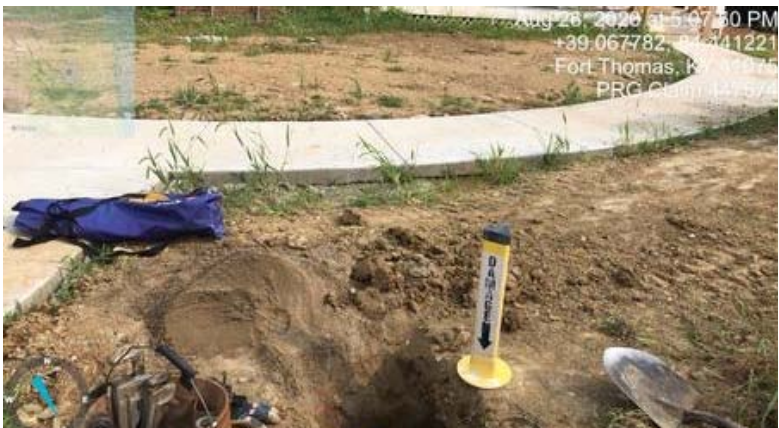
447574 - Investigator15.JPG