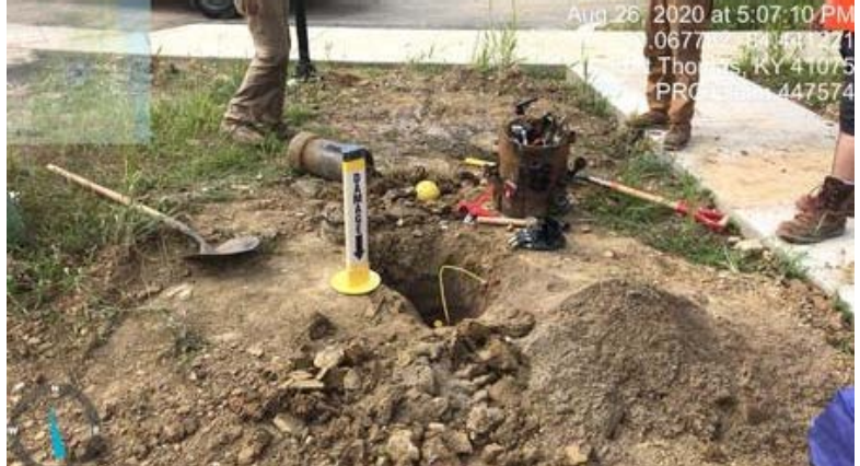
447574 - Investigator1.JPG