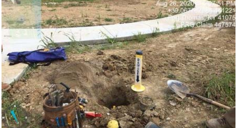
Page: 2447574 - Investigator16.JPG