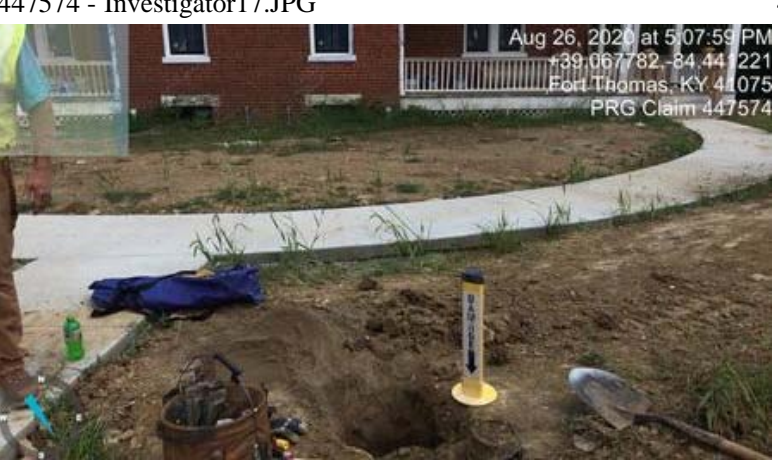
447574 - Investigator19.JPG