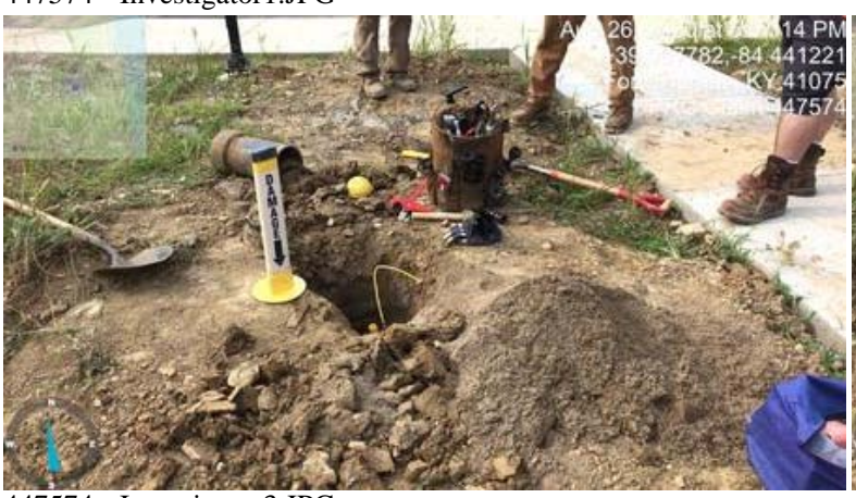
447574 - Investigator3.JPG