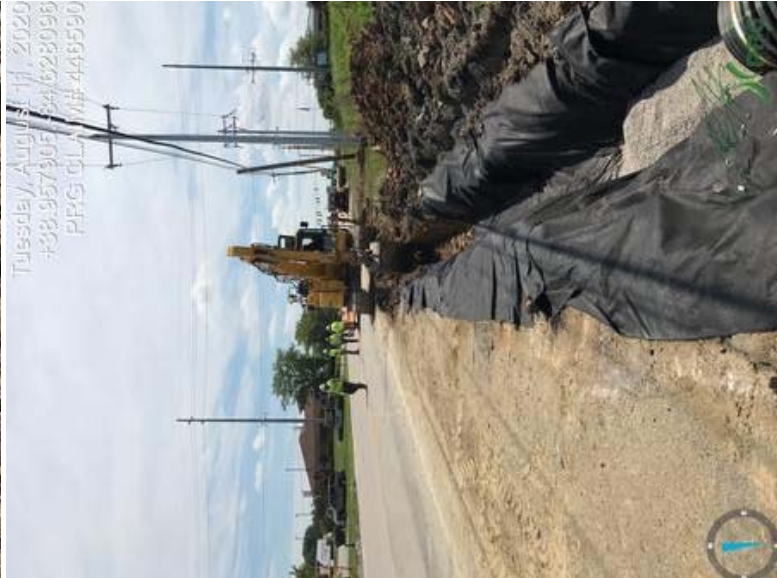
446590 - Investigator18.jpeg