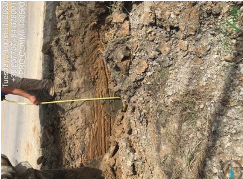
446590 - Investigator30.jpeg