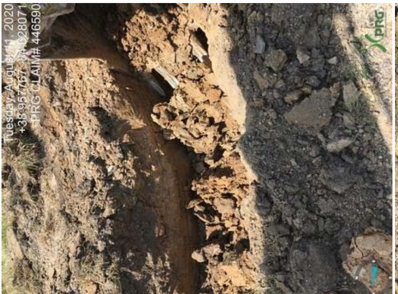
446590 - Investigator5.jpeg