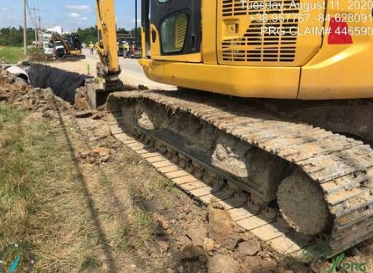
446590 - Investigator28.jpeg