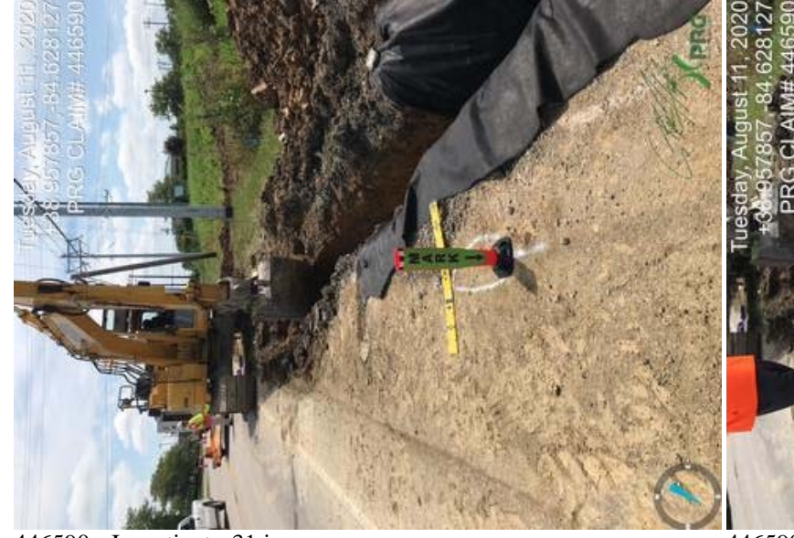
446590 - Investigator31.jpeg