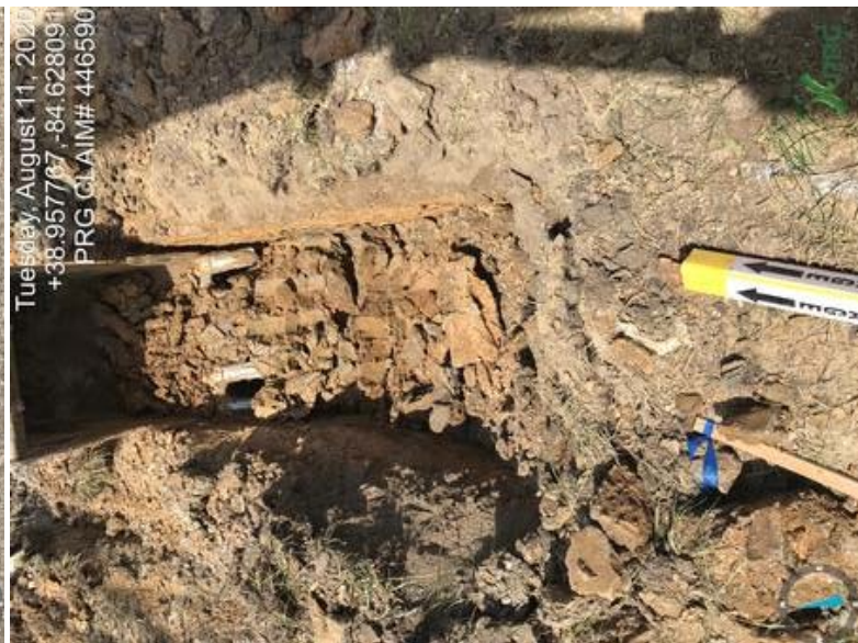
446590 - Investigator24.jpeg