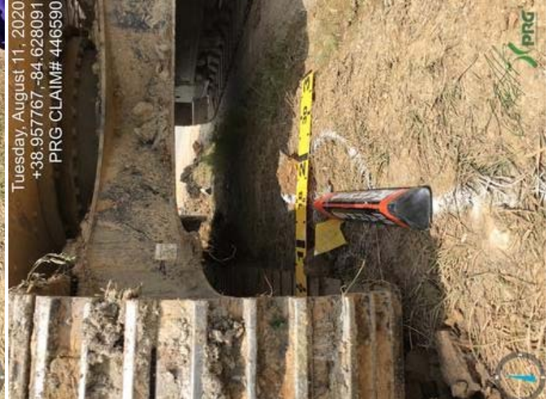
446590 - Investigator26.jpeg