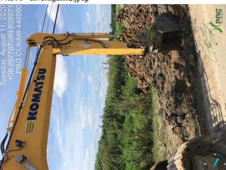
446590 - Investigator4.jpeg