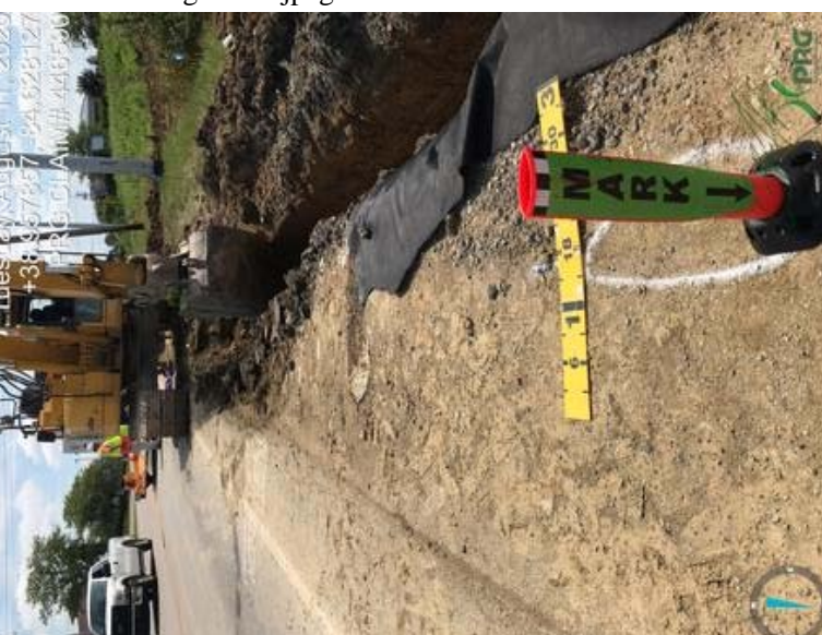
446590 - Investigator34.jpeg