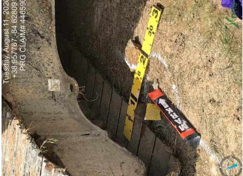
446590 - Investigator25.jpeg