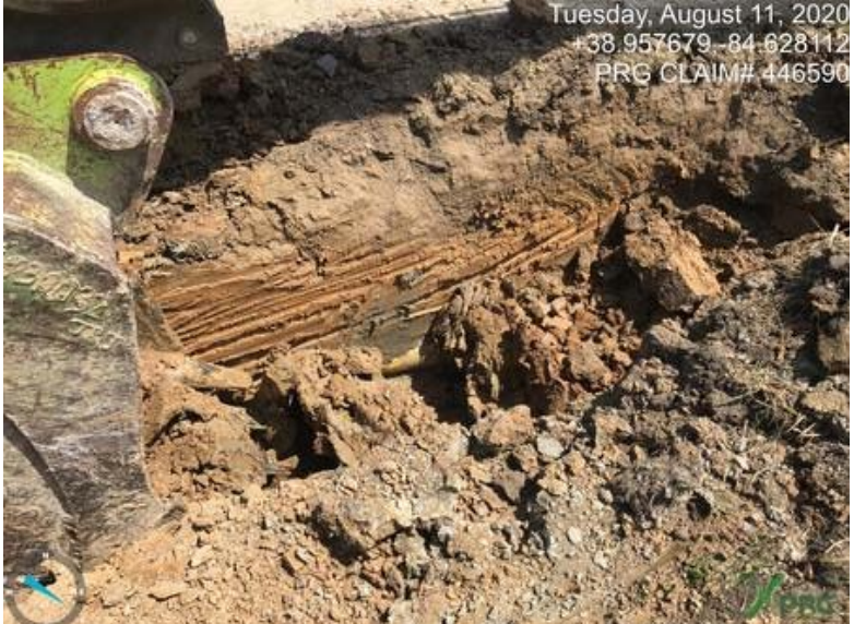
446590 - Investigator17.jpeg