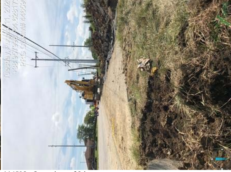
446590 - Investigator20.jpeg