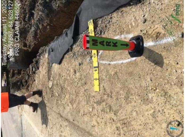
446590 - Investigator32.jpeg