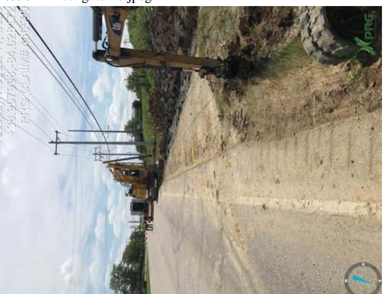
446590 - Investigator22.jpeg