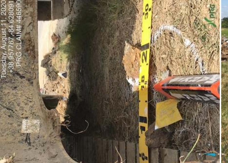
446590 - Investigator27.jpeg