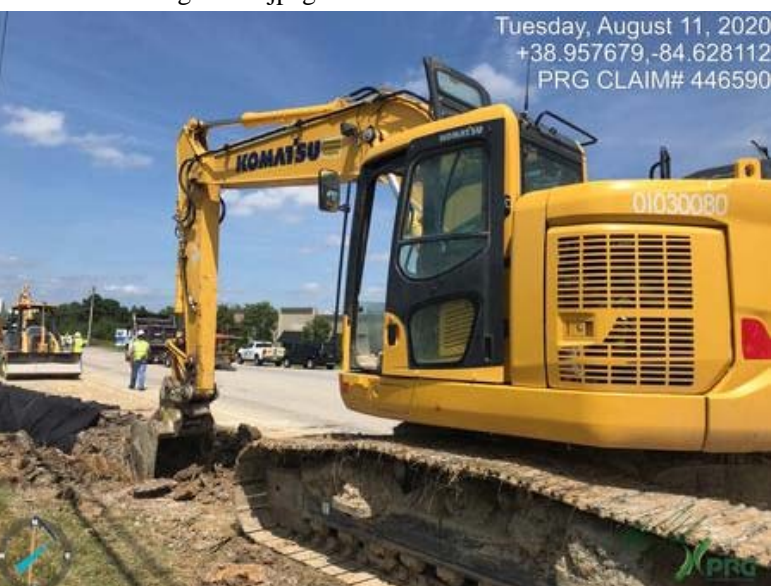
446590 - Investigator12.jpeg