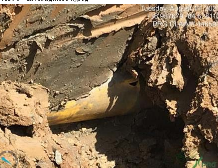
446590 - Investigator16.jpeg