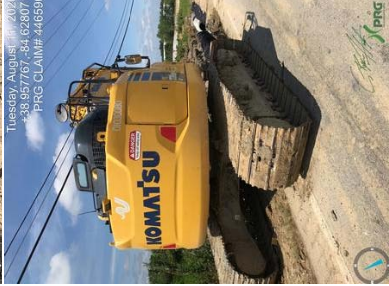
446590 - Investigator8.jpeg