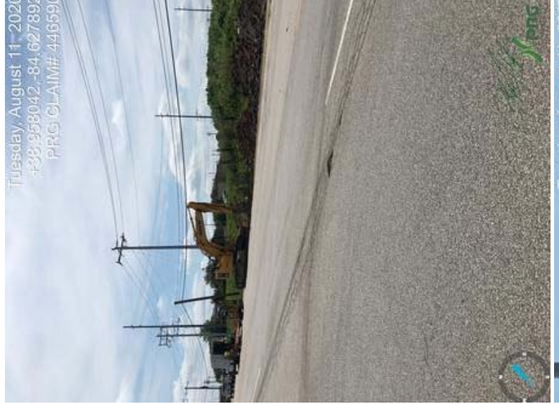
446590 - Investigator1.jpeg