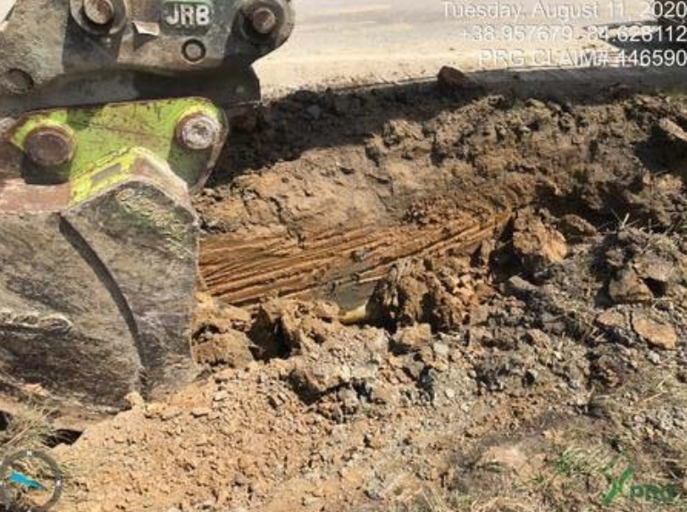
446590 - Investigator14.jpeg