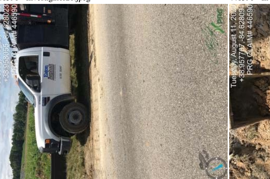
446590 - Investigator23.jpeg