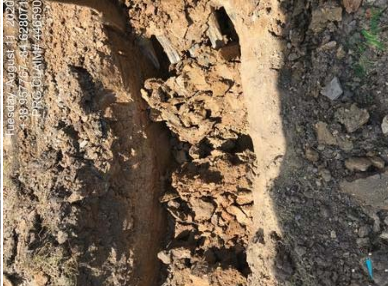
446590 - Investigator6.jpeg Page: 1 of 7