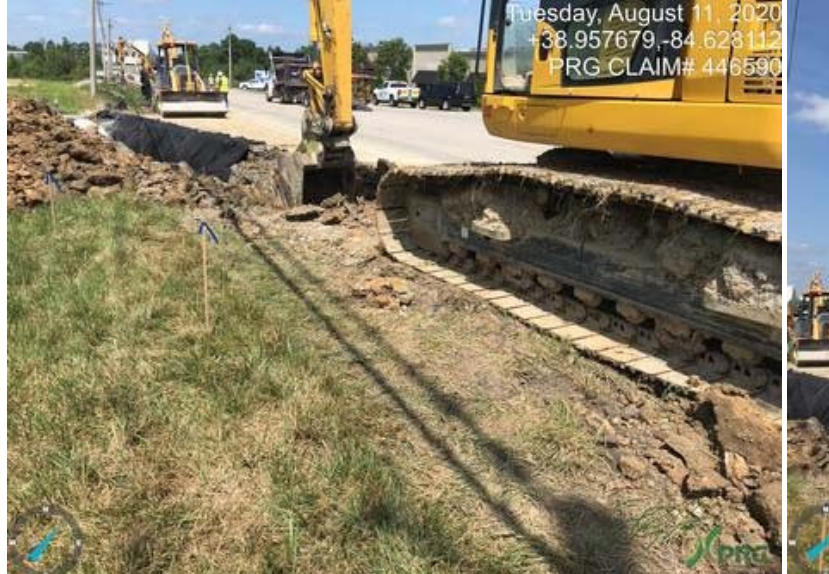
446590 - Investigator11.jpeg