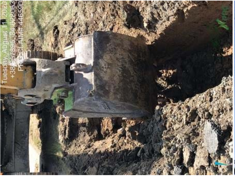
446590 - Investigator3.jpeg