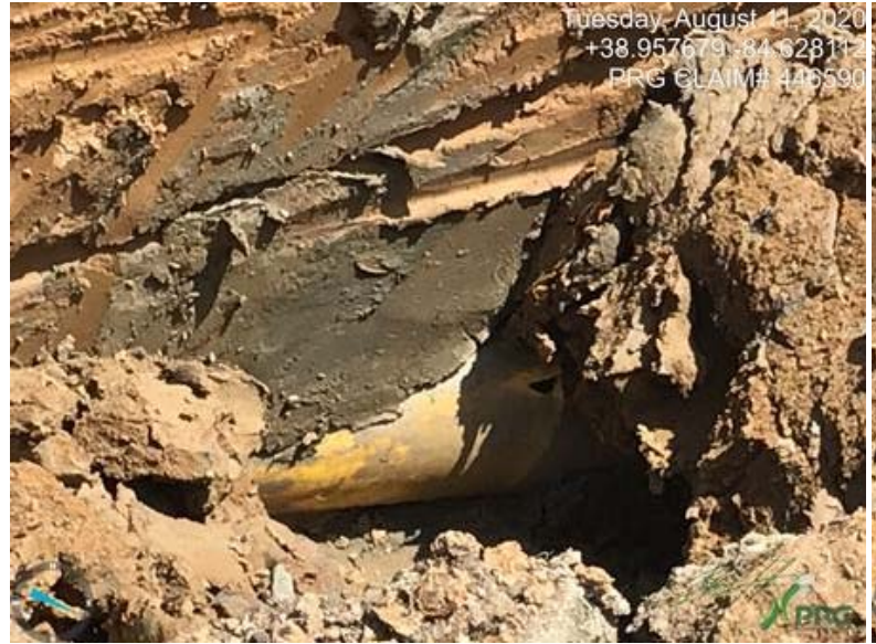
446590 - Investigator15.jpeg