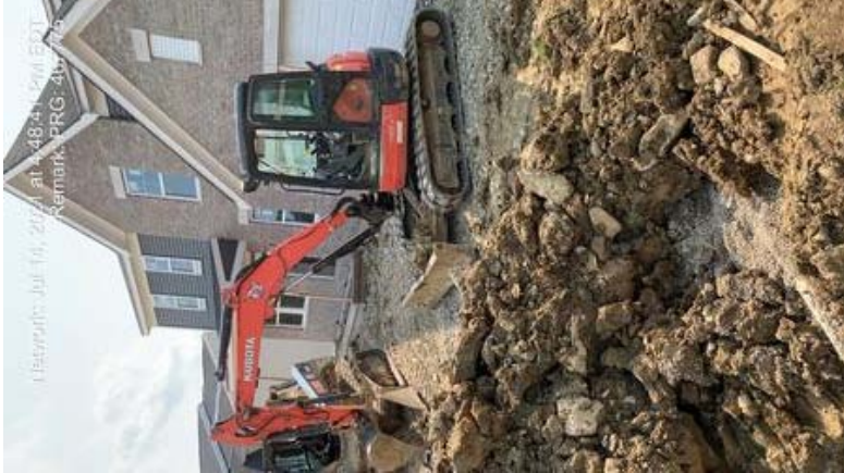
467775 - Investigator5.JPG