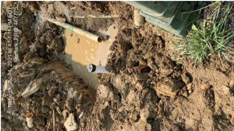
467775 - Investigator9.JPG