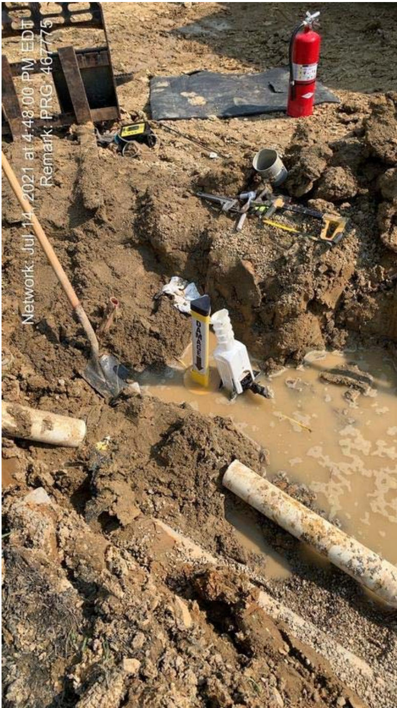
467775 - Investigator3.JPG