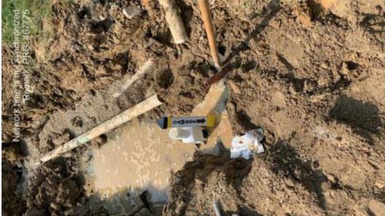
467775 - Investigator1.JPG