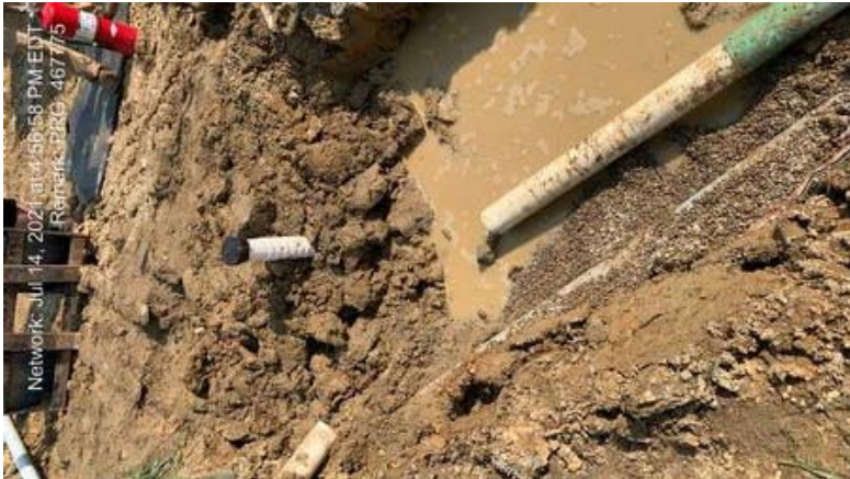
467775 - Investigator7.JPG