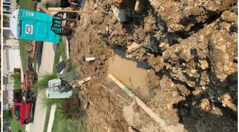
467775 - Investigator6.JPG