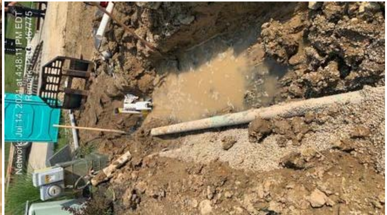
467775 - Investigator4.JPG