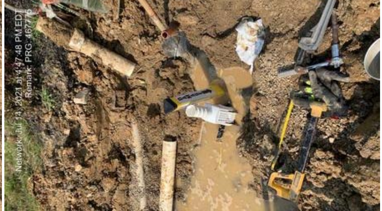
467775 - Investigator2.JPG