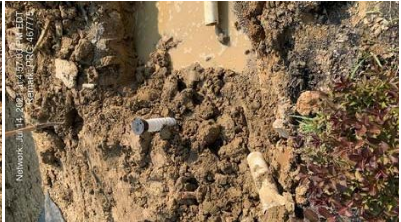
467775 - Investigator8.JPG