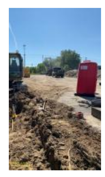
NOTE : Only 12 most recent photos shown. To view all 40 attachments, please view the ticket within DigTix.