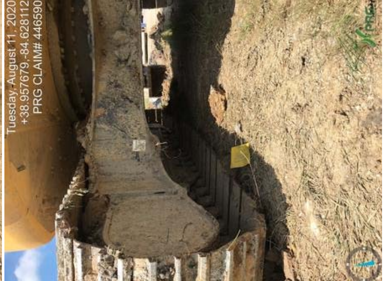
446590 - Investigator10.jpeg