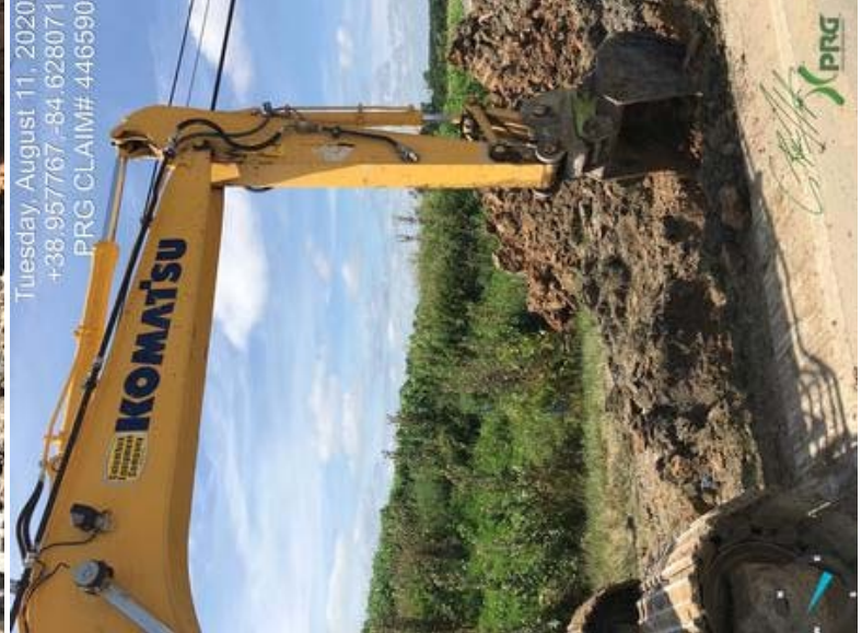
446590 - Investigator4.jpeg