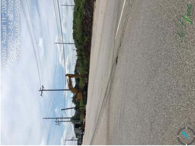
446590 - Investigator1.jpeg