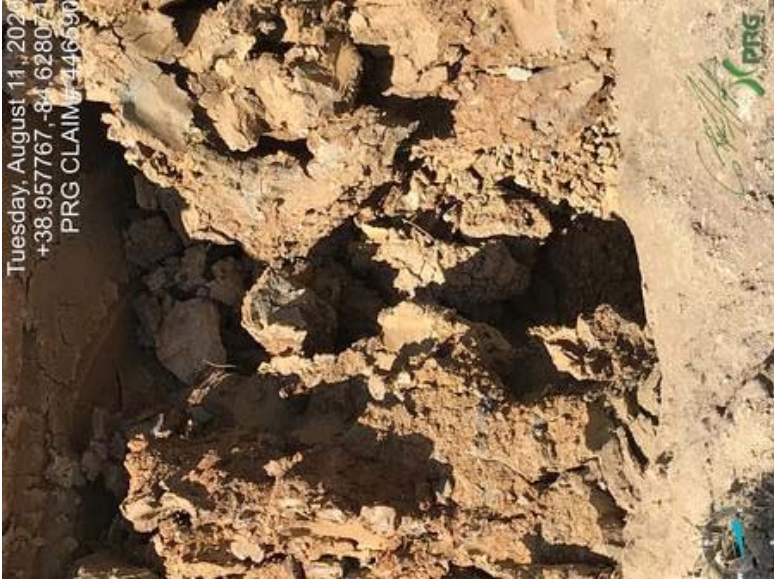
446590 - Investigator7.jpeg