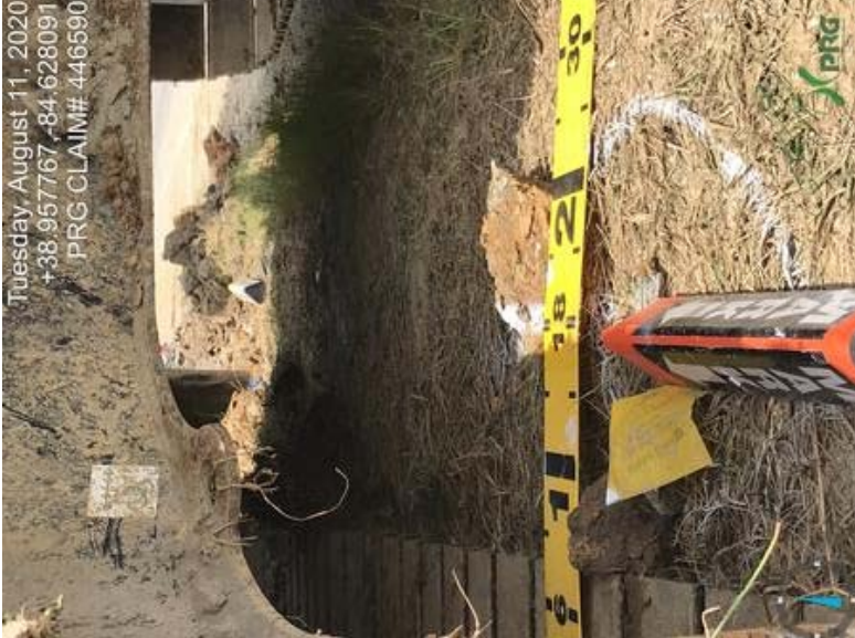
446590 - Investigator27.jpeg