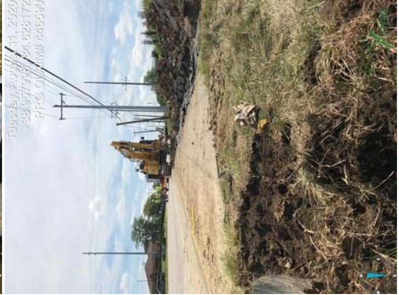
446590 - Investigator20.jpeg