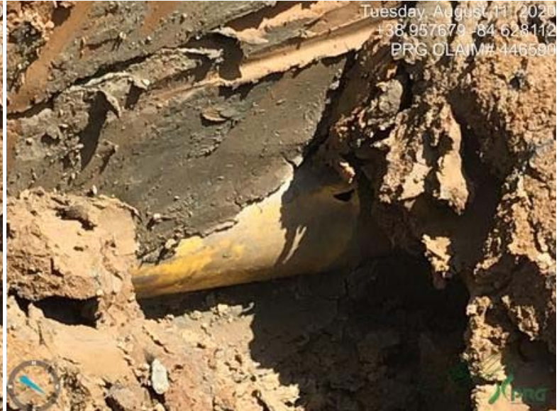
446590 - Investigator16.jpeg