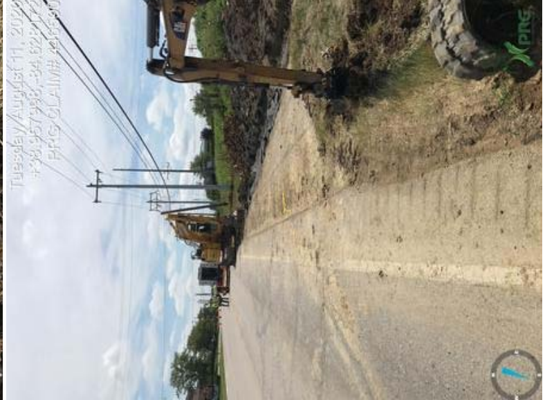
446590 - Investigator22.jpeg