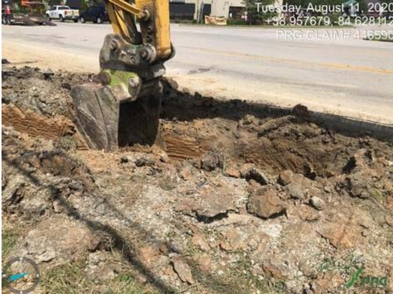
446590 - Investigator13.jpeg