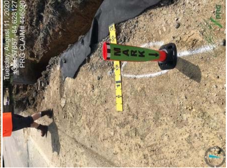
446590 - Investigator32.jpeg