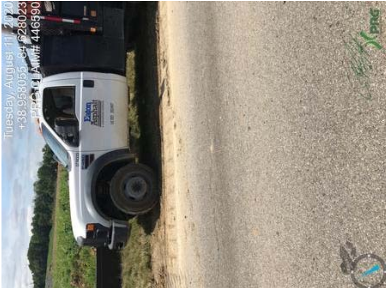
446590 - Investigator23.jpeg