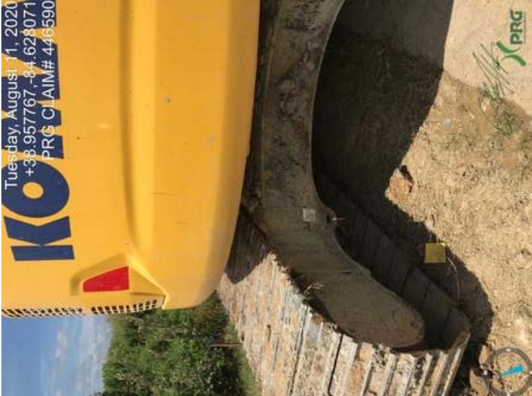
446590 - Investigator9.jpeg