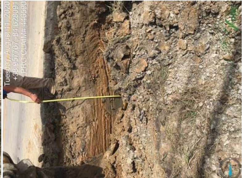
446590 - Investigator30.jpeg