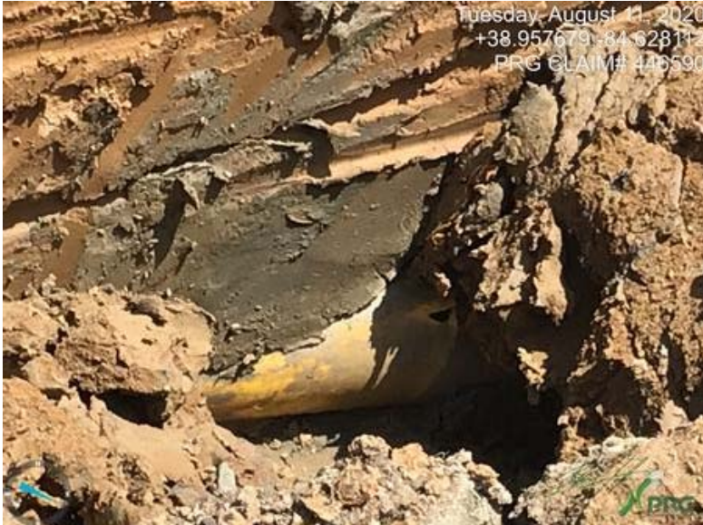
446590 - Investigator15.jpeg