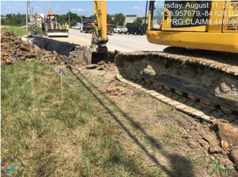
446590 - Investigator11.jpeg