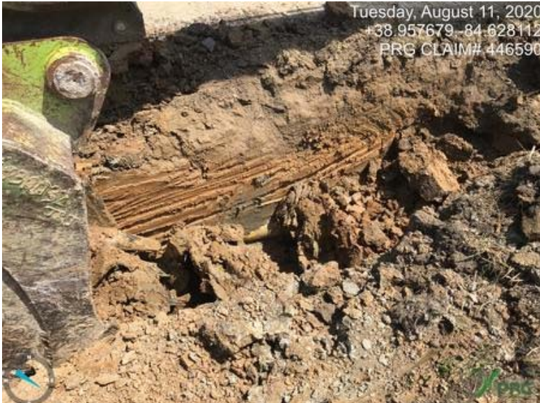
446590 - Investigator17.jpeg