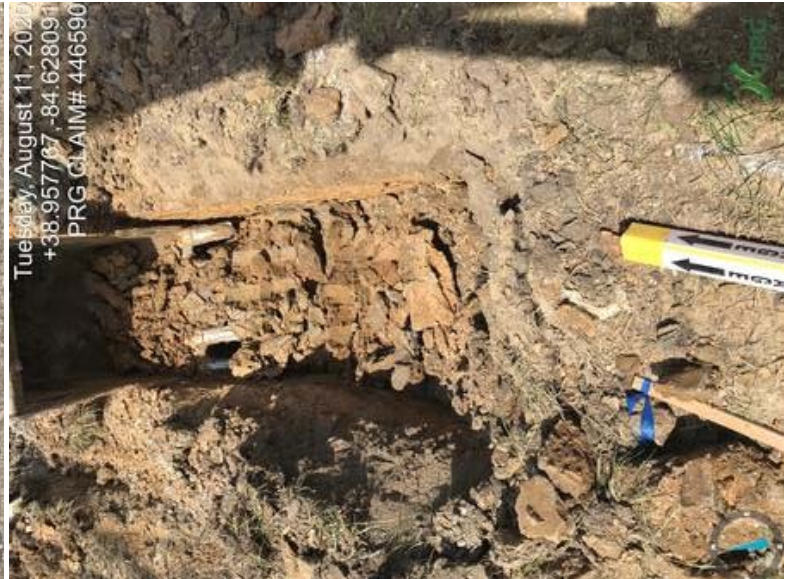
446590 - Investigator24.jpeg