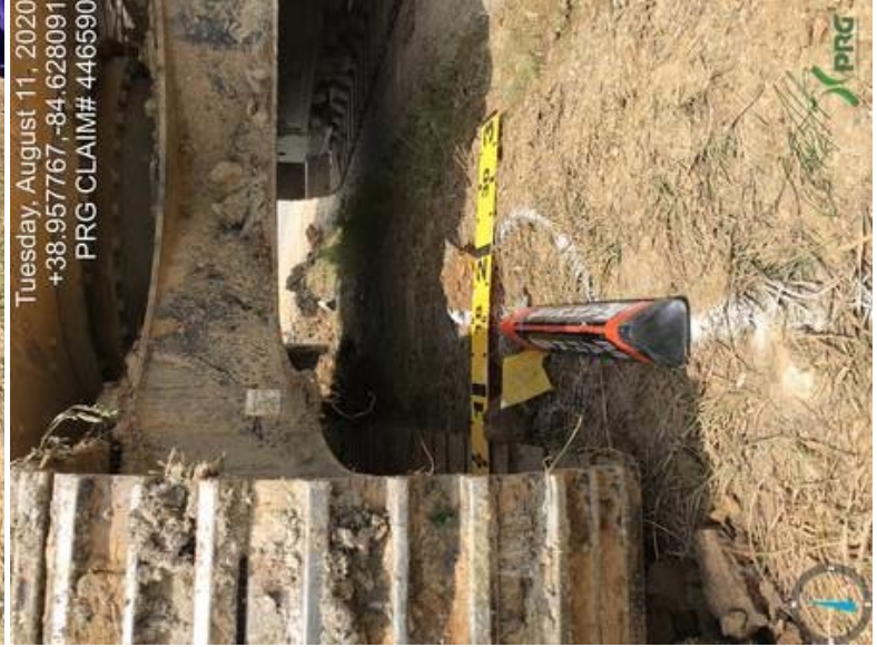
446590 - Investigator26.jpeg