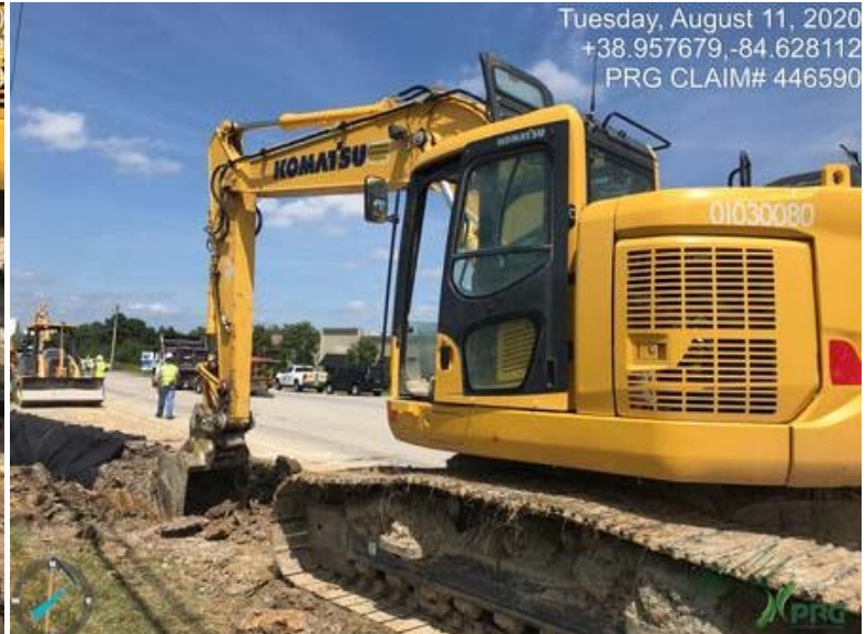
446590 - Investigator12.jpeg