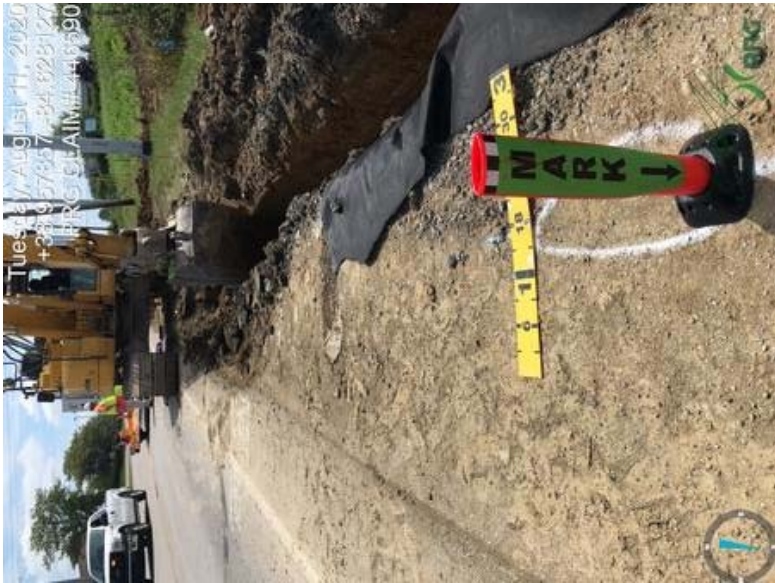
446590 - Investigator33.jpeg