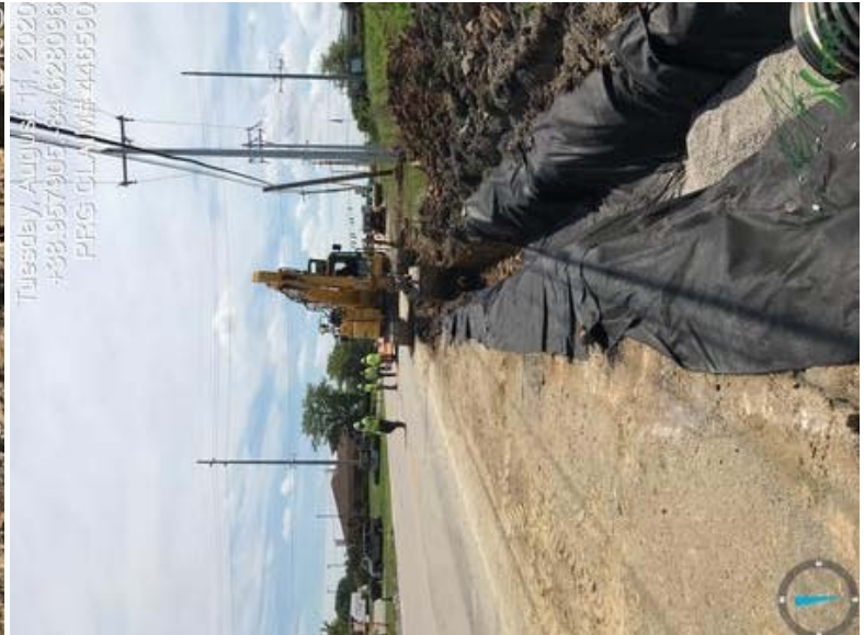
446590 - Investigator18.jpeg