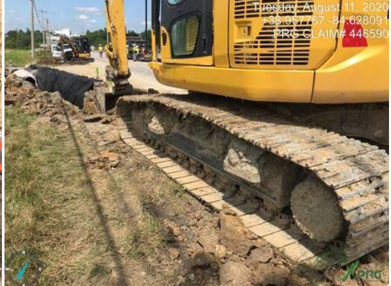
446590 - Investigator28.jpeg