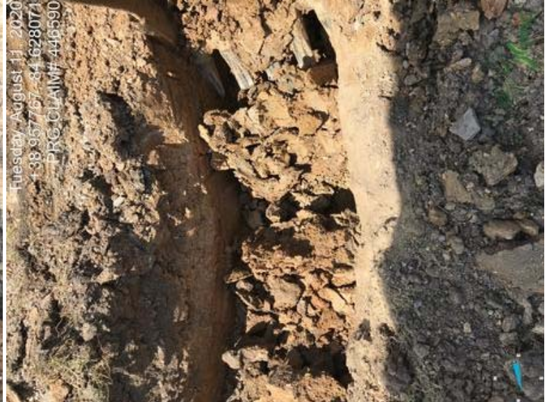
446590 - Investigator6.jpeg