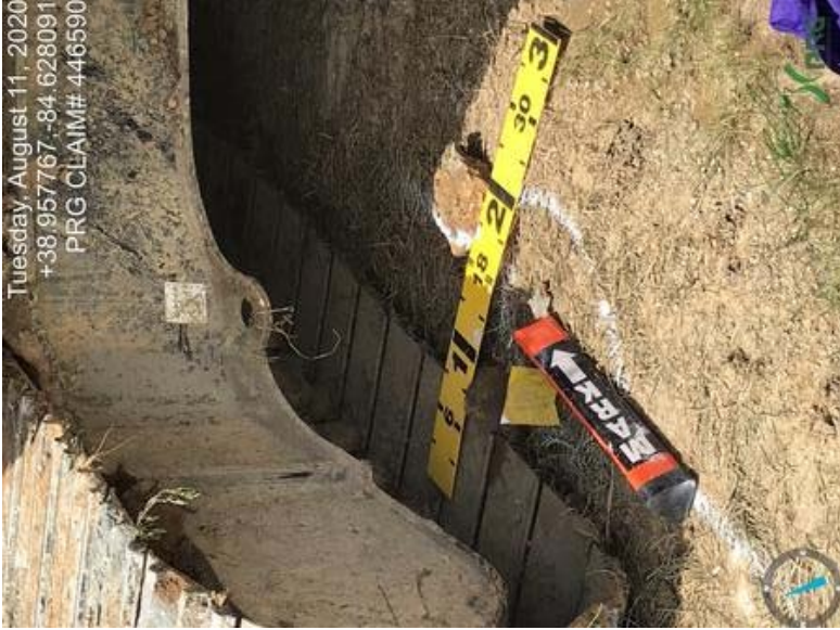
446590 - Investigator25.jpeg