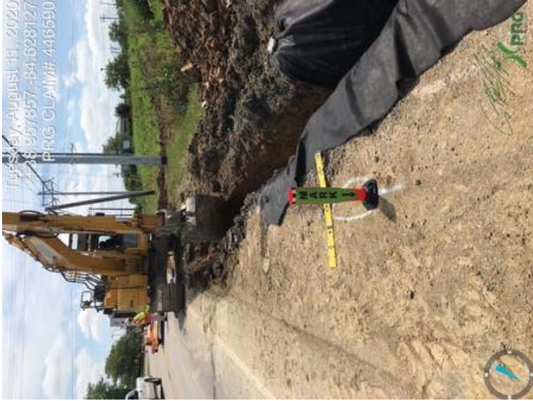
446590 - Investigator31.jpeg