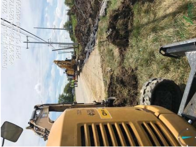
446590 - Investigator19.jpeg