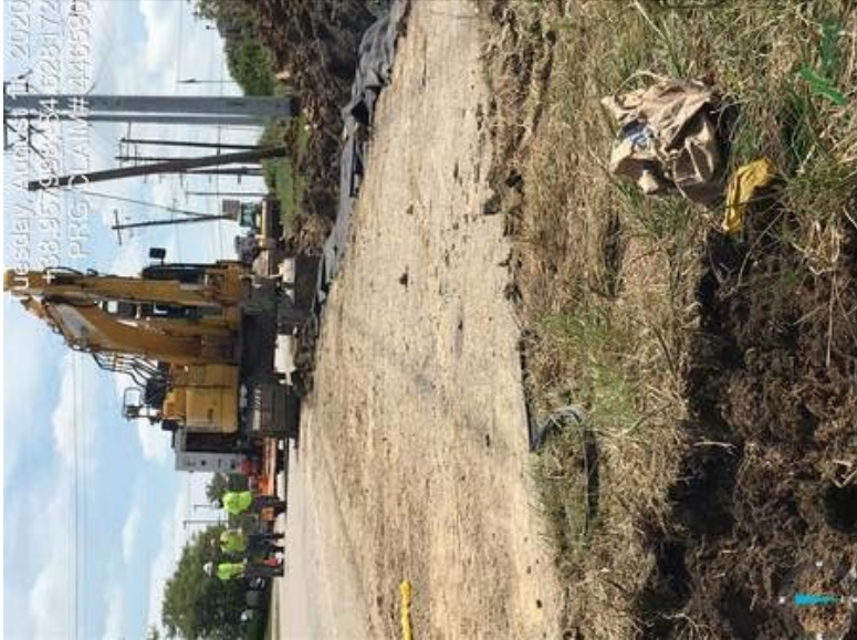
446590 - Investigator21.jpeg