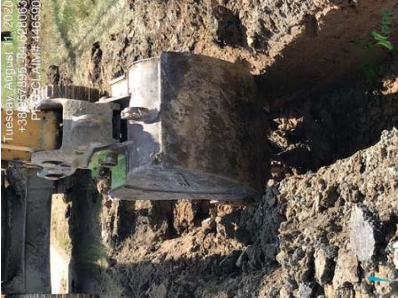
446590 - Investigator3.jpeg