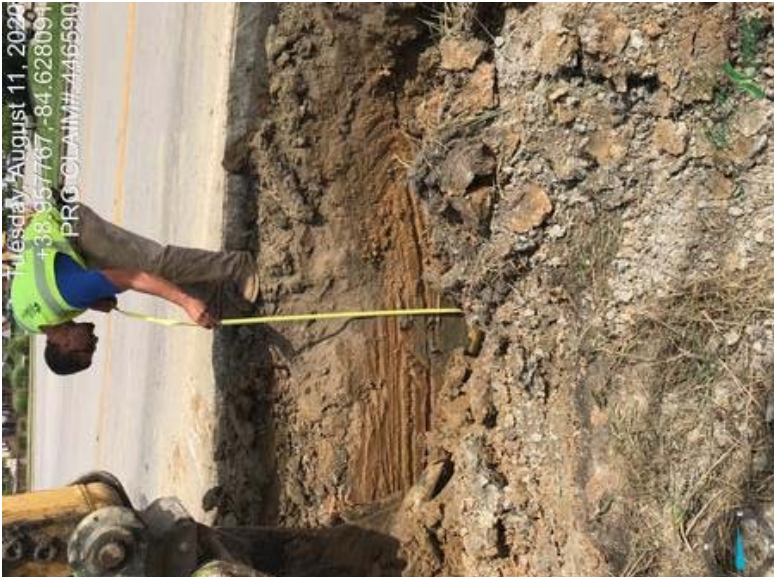
446590 - Investigator29.jpeg