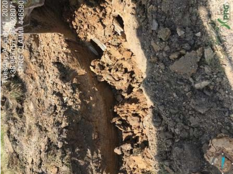
446590 - Investigator5.jpeg