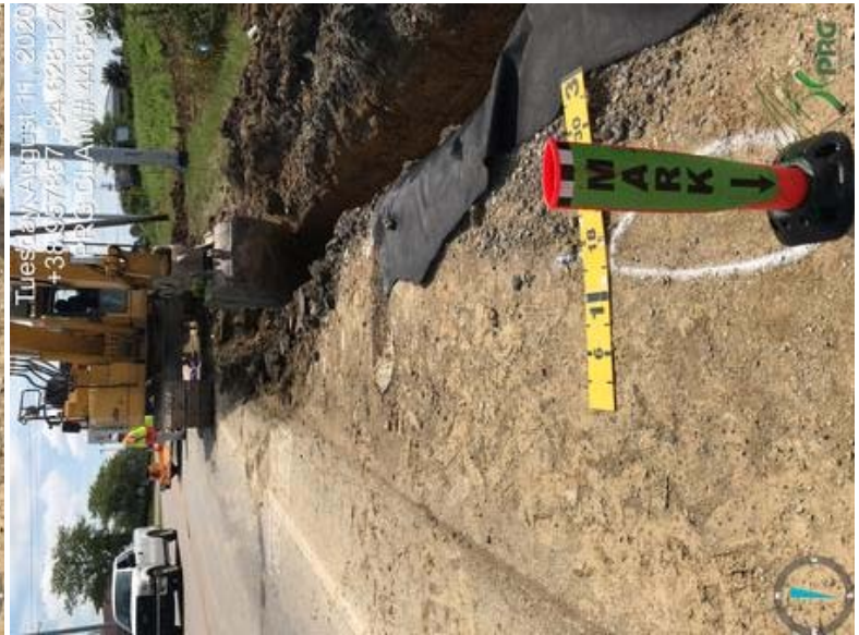
446590 - Investigator34.jpeg