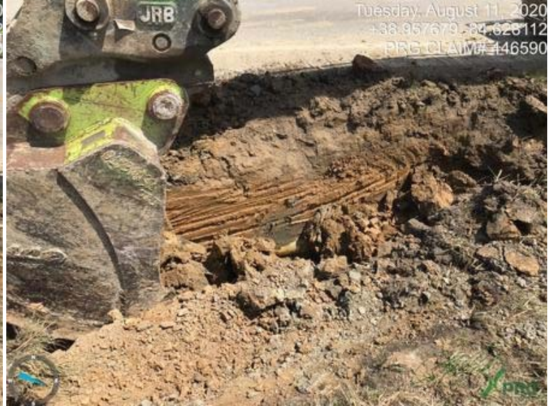
446590 - Investigator14.jpeg