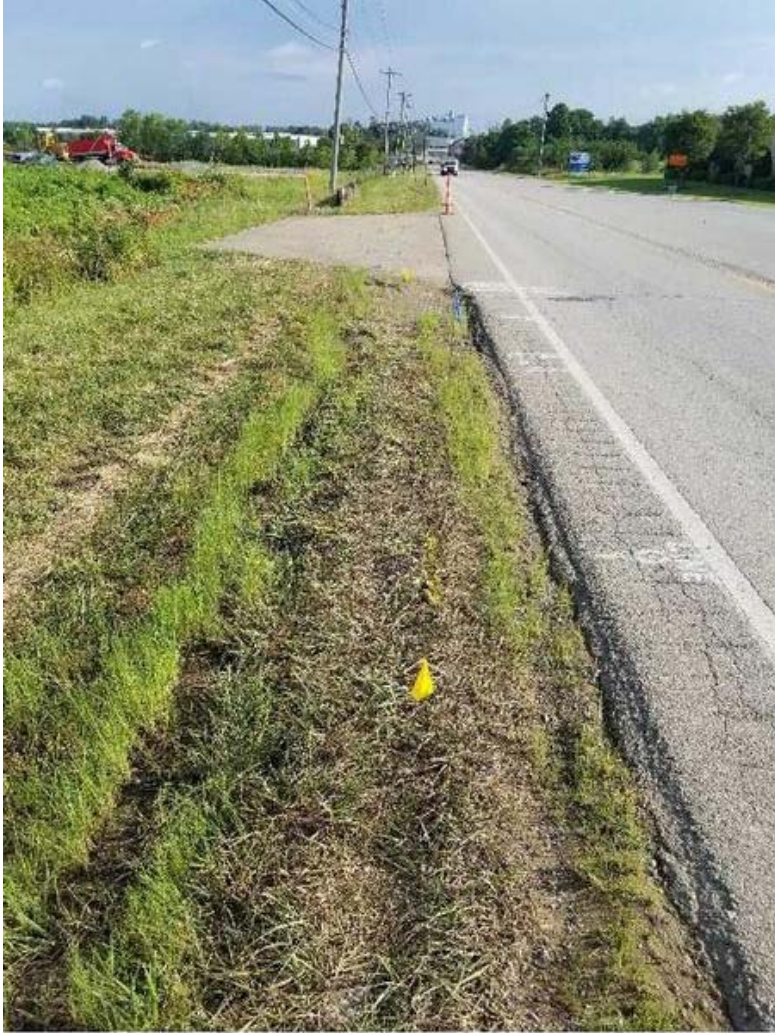
Photo created on 08/03/2020 08:58:54 AM EDT