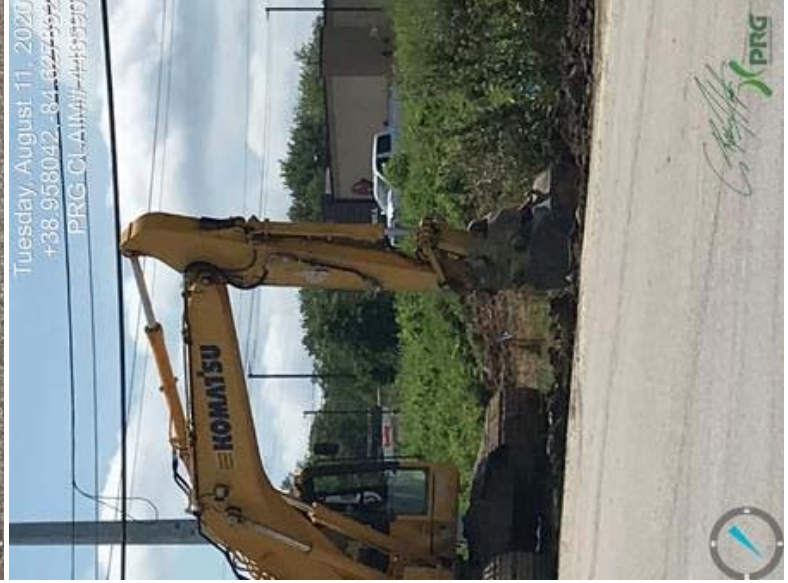
446590 - Investigator2.jpeg