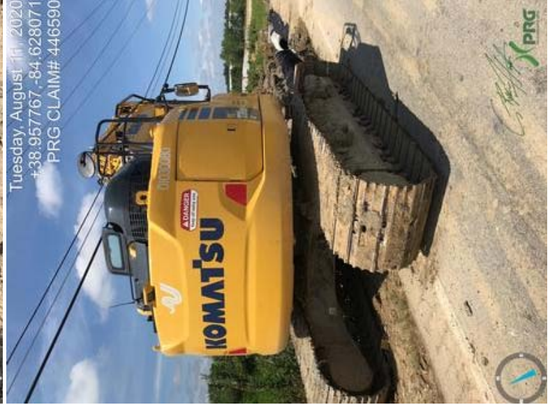
446590 - Investigator8.jpeg