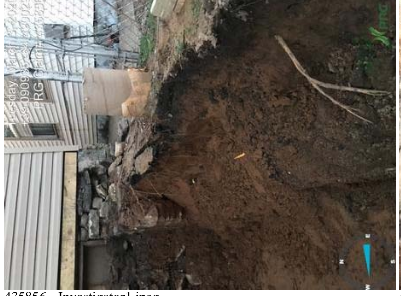
435856 - Investigator1.jpeg