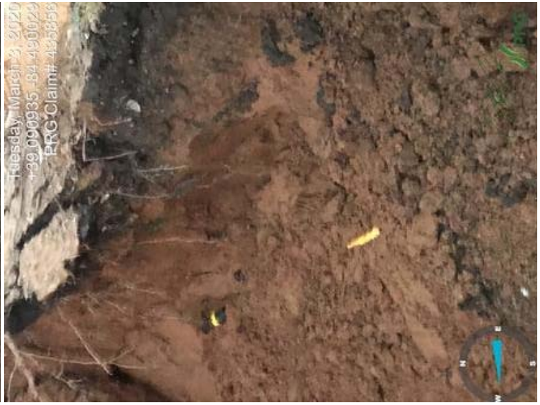
435856 - Investigator2.jpeg