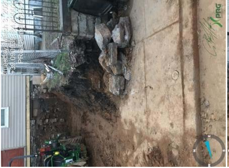
435856 - Investigator3.jpeg