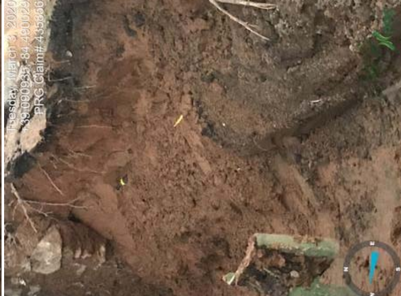
435856 - Investigator6.jpeg Page: 1 of 2