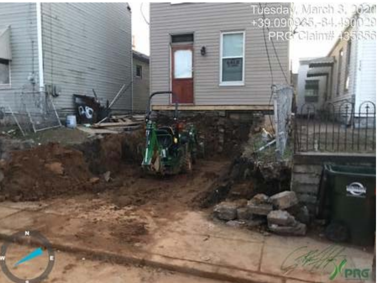
435856 - Investigator4.jpeg